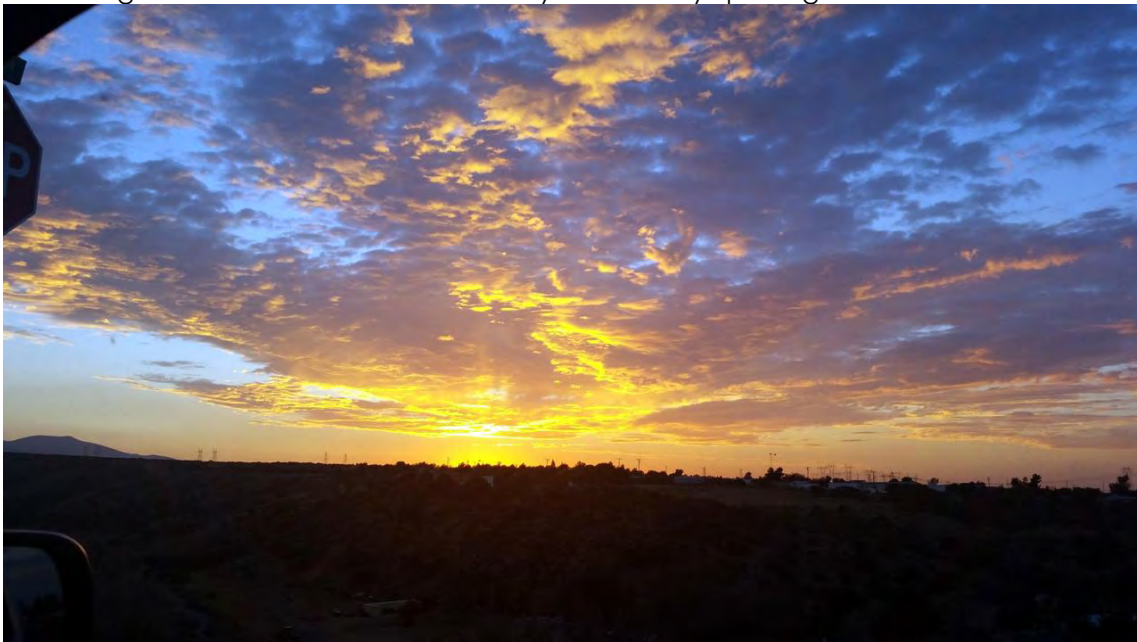
August Contest (Matin Taraz) Sunset After a Day of Soaring at Cajon Pass