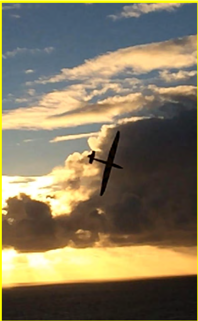
April Winner (Scott Condon) - 1/3 Scale L-213 at Torrey