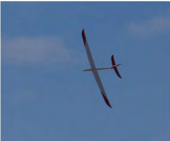
Offspring of a PNF and TWF.