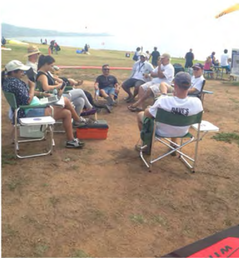
The usual gathering at the pit area.