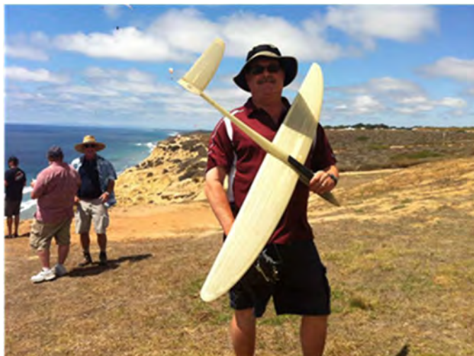
Ward's TWF Sirocco