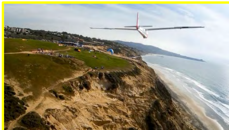
March Winner GoPro view trailing a Ka8 taken during the February Fun-Fly