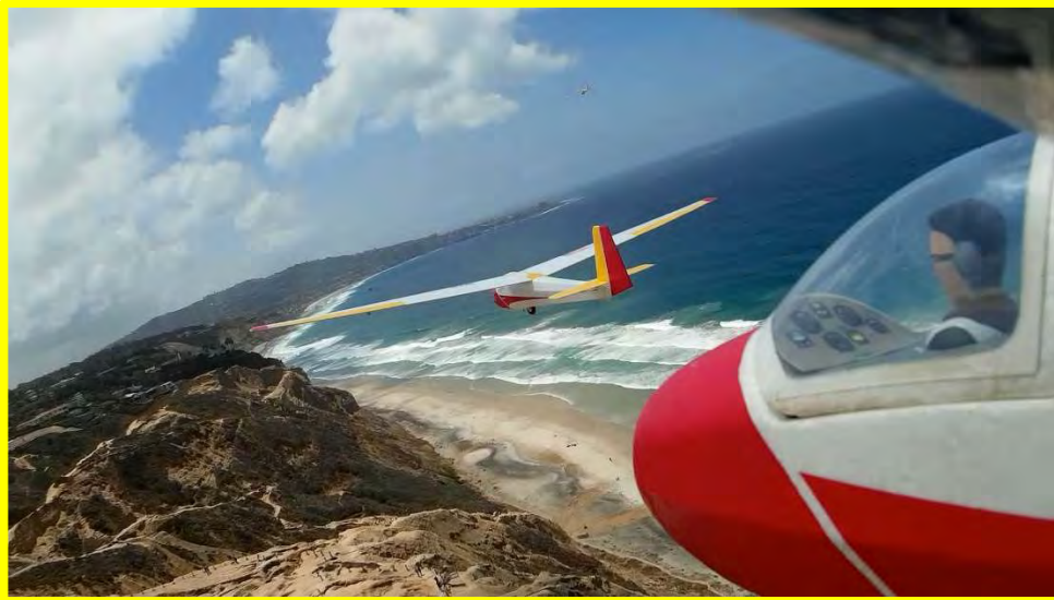
June Winner – Ka-8's flying over Torrey at the Foamy Fun Fly