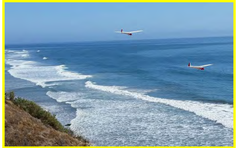
May Co-Winner – Ka-8's over Ellwood at this year's WeaselFest in Santa Barbara