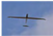
Brian's (from Riverside) plane inverted