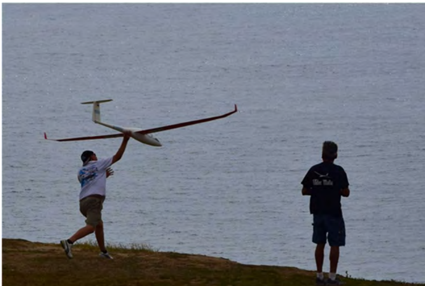
Tom's DG-1000