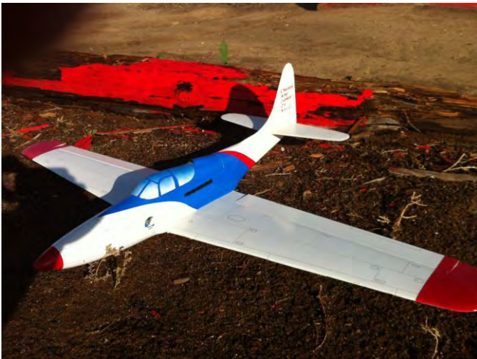
Greg Houck's PSS P-39.