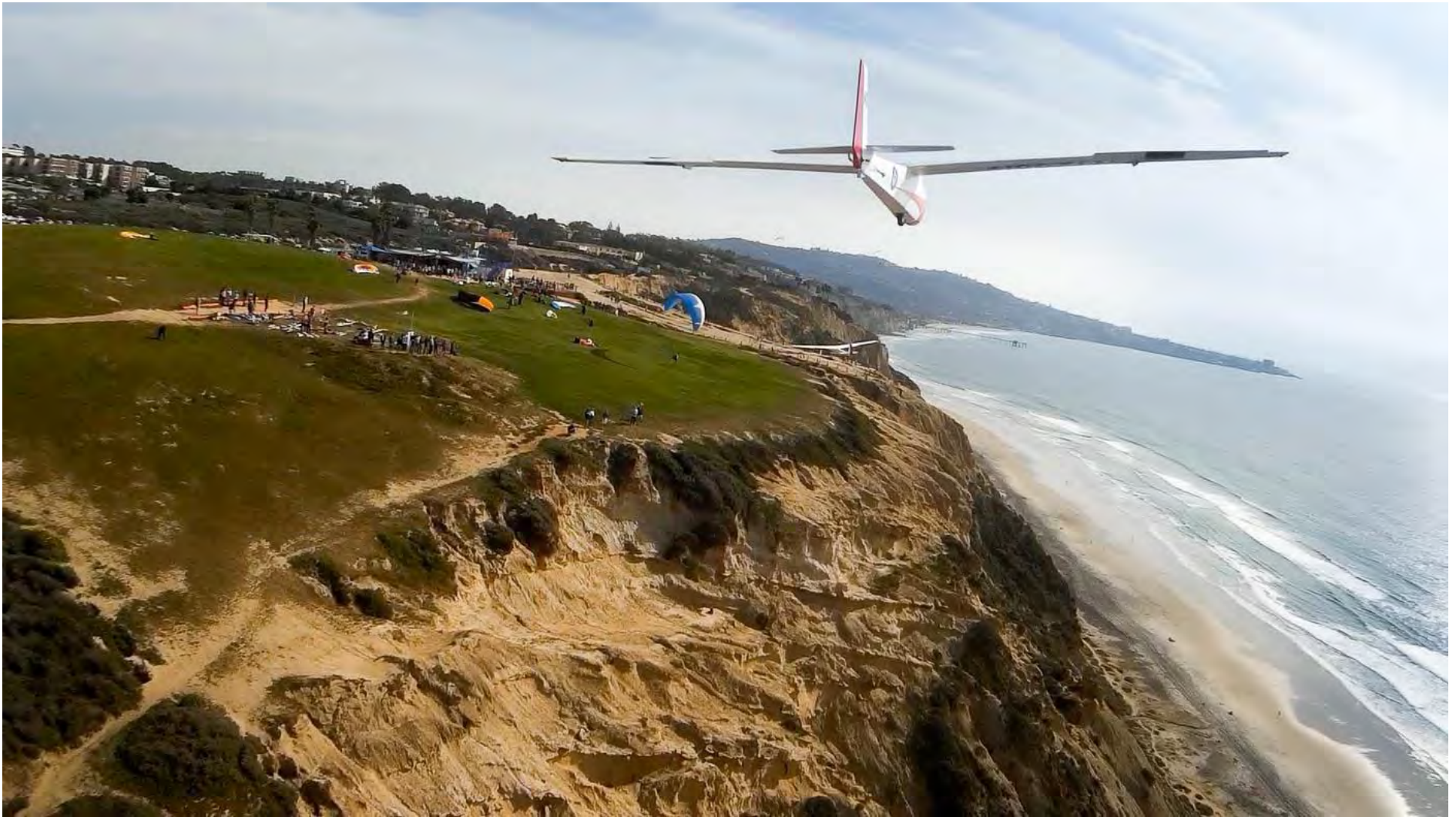
Ka-8 over Torrey - coming up on the Gliderport