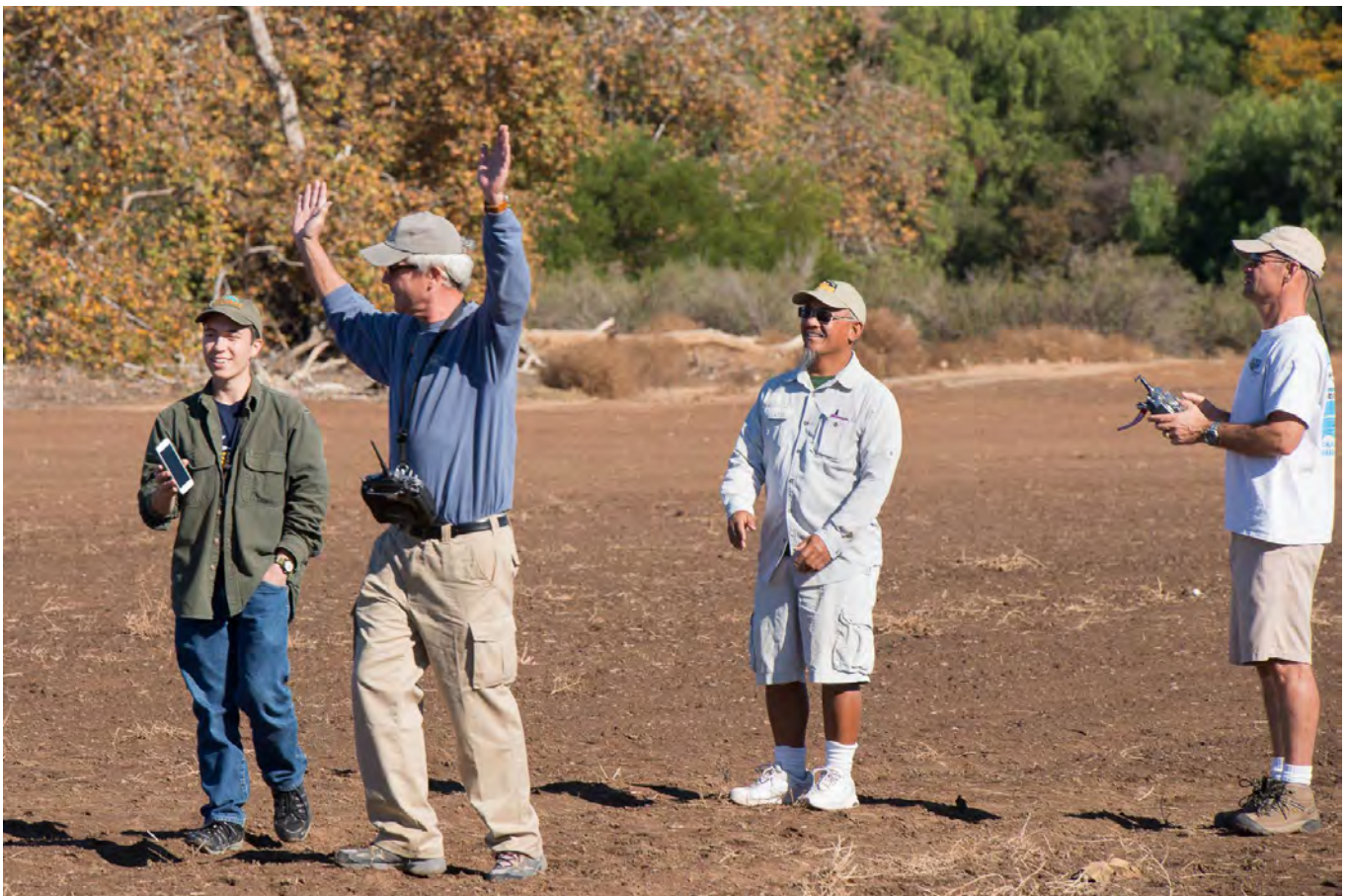
All in all, a great day!