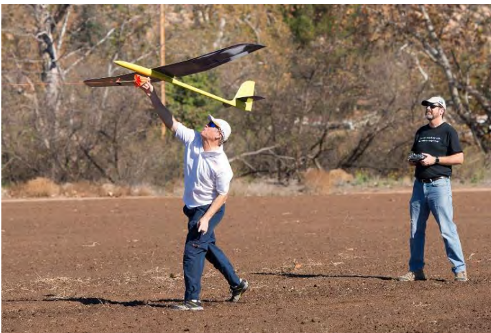
This is how you launch a moldie.