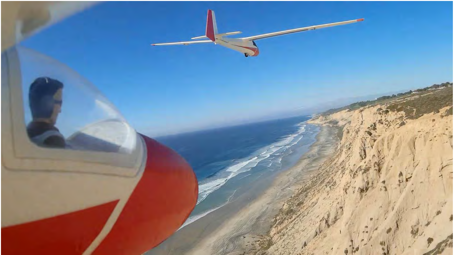
Ka-8's over Torrey