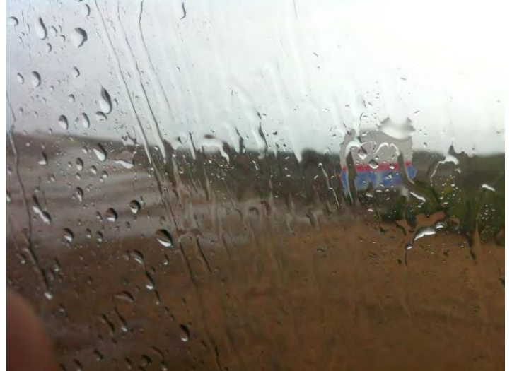
Rain squall.