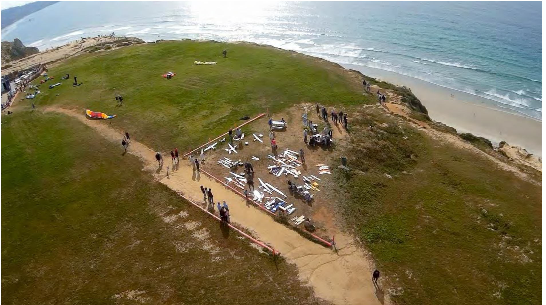
Bird's eye view of the Gliderport