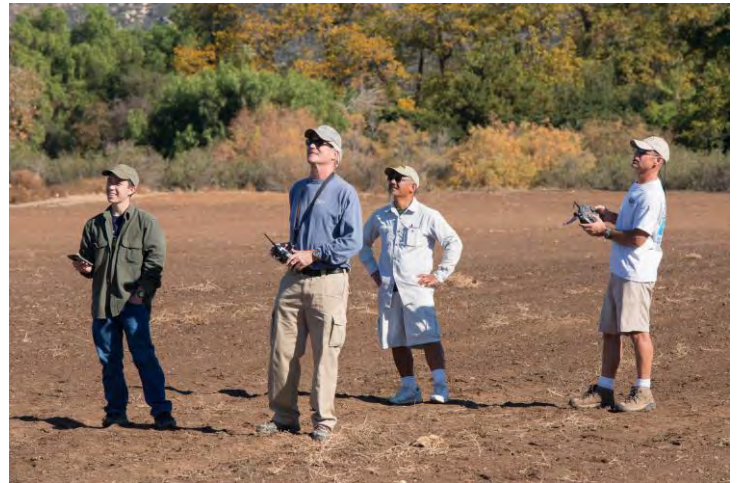
Flying, watching and timing.