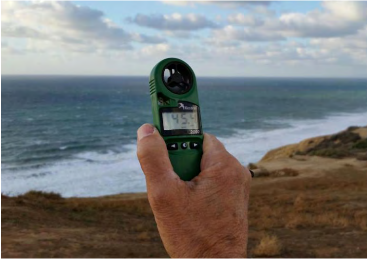
45 mph gust.

Rarely do you see a Skua, two Mach Ones and three Blutos at the bluff, but this day brought them out of the closet. I, unfortunately took few photos, but I stole a couple from RCGroups.