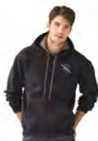
Product ID: A382-027-1680 Digitally Printed Gildan Hooded Sweatshirt