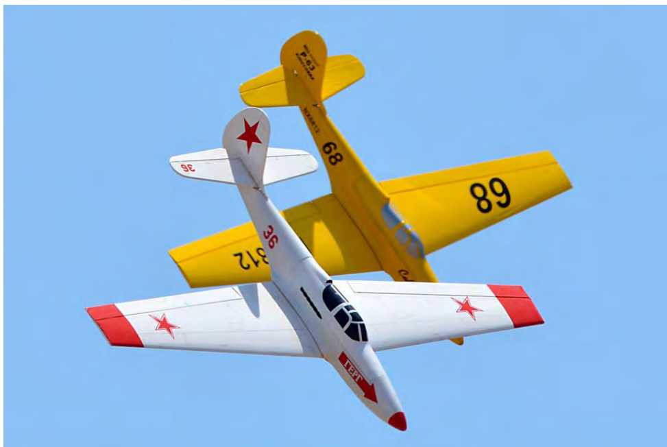
More FakeFest Airacobras (Pete Rissman)