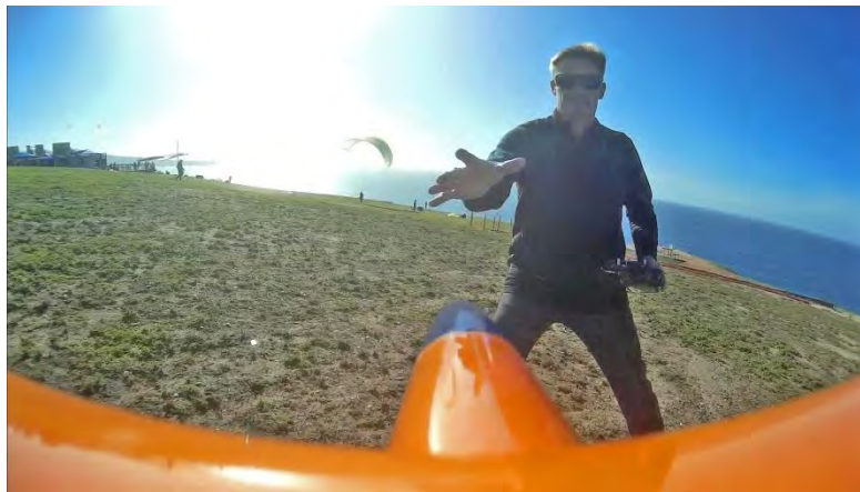
Come to papal!