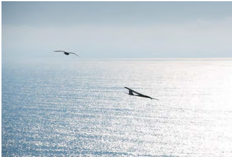
Kat's Spirit Elite with seagull in pursuit at Torrey (Ian Cummings)