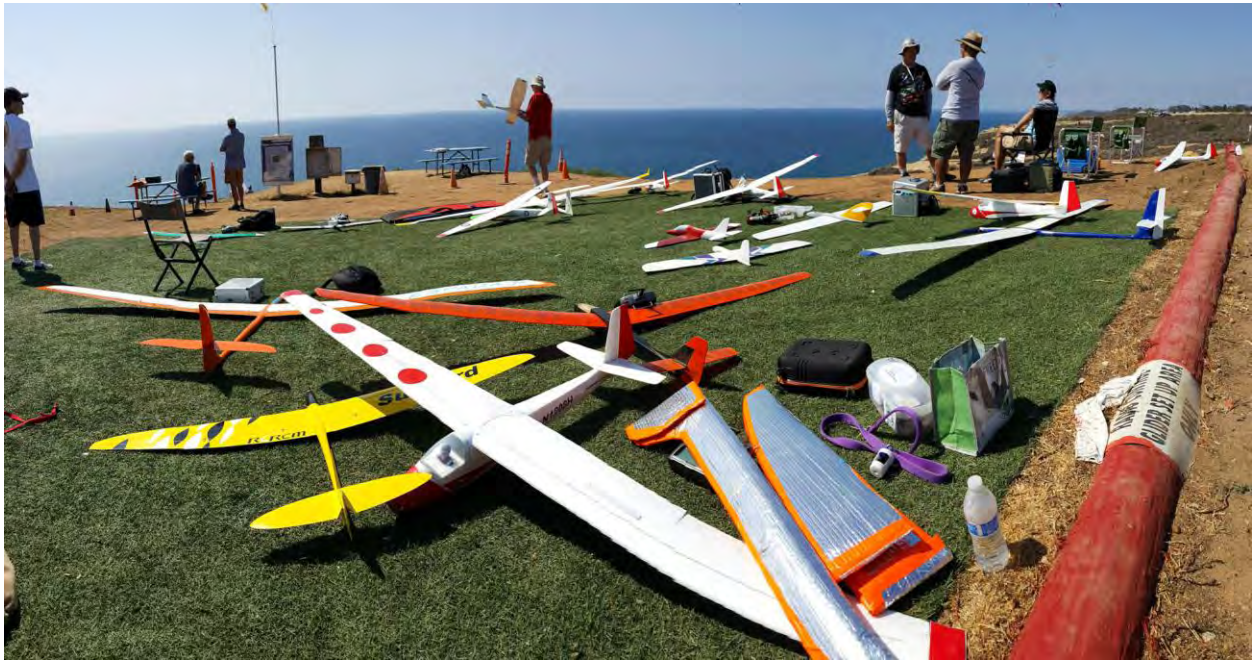
Scale Fun Fly