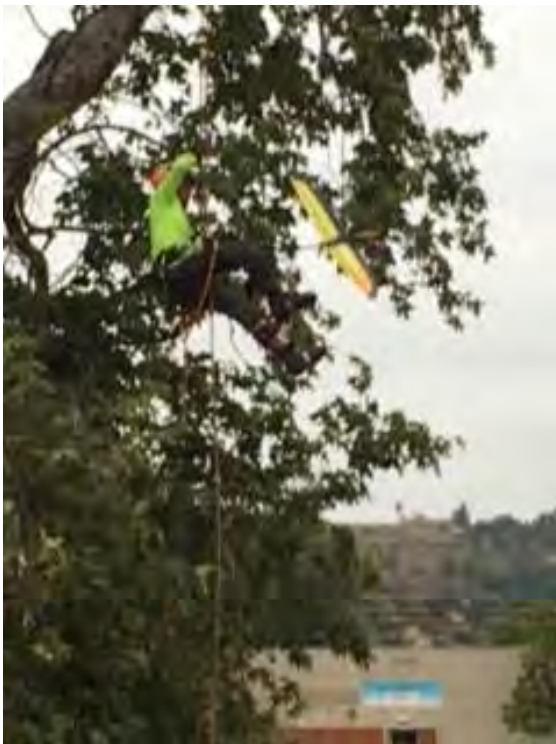
The joy of DLG (Cliff Hunter)