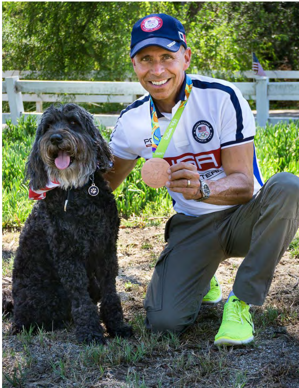
Steffen with his bronze medal from the Rio Olympics and an adoring fan.

Steffen recently returned home from the Summer Olympics in Rio with his horse "Legolas" and a bronze medal around his neck. This was his fourth time competing in the summer Olympics and his second earned Olympic bronze medal. Steffen also competes in numerous other international equestrian events and has received a good number of medals, including gold at the Pan Am Games. In addition to competing, Steffen also trains other equestrians at his stable complex in Carmel Valley.