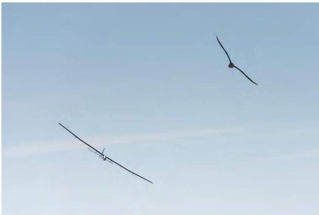
Kat's Spirit Elite with seagull at Torrey (Ian Cummings)