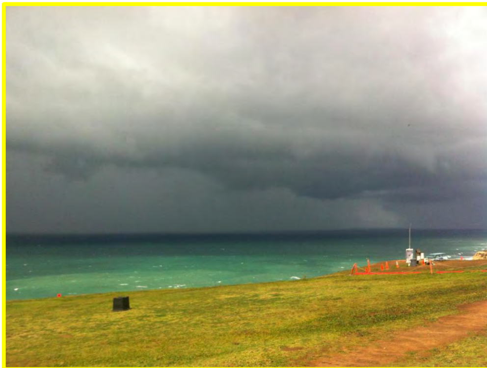
April Winner – Torrey before El Niño Squall