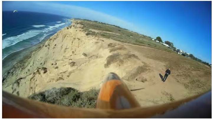
Camera catches Phil flying the Xperience