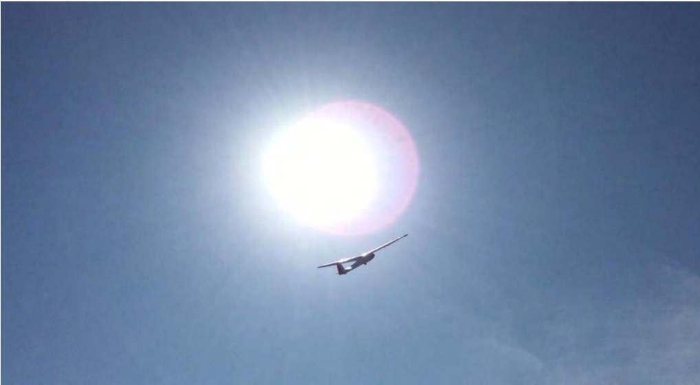
Screenshot – Ka-8 DS'ing at Bill's Hill