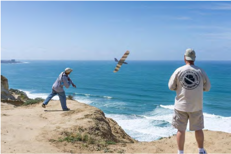
Launching foamies at the Torrey Classic Slope Race (Ian Cummings)