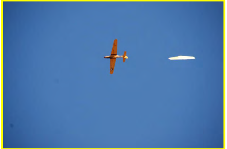
July Winner – Nice sequence showing Airacobra mid-air at the 2016 FakeFest