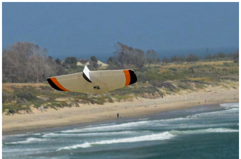
WeaselFest (Greg Houck)