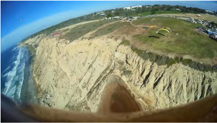
Plane mounted camera view from Phil Davy's Xperience Pro Carbon 3.3 at Torrey