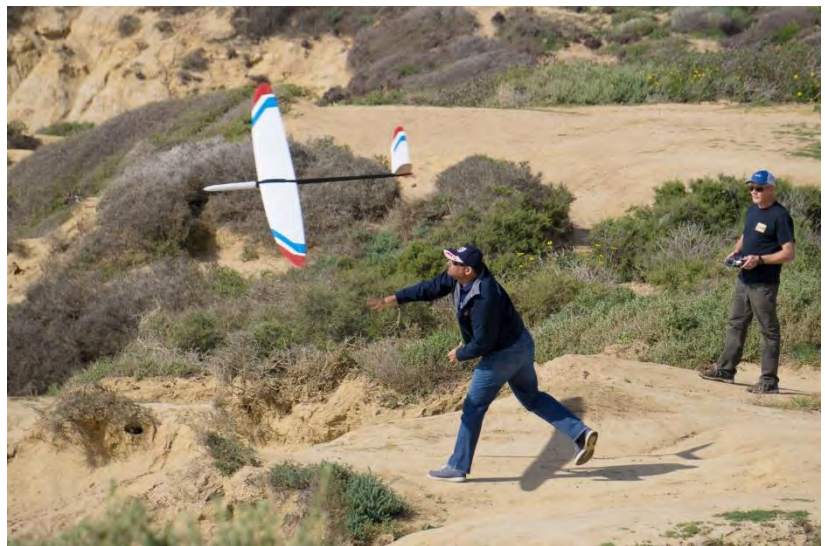
Launching moldies at the Torrey Classic Slope Race (Ian Cummings)