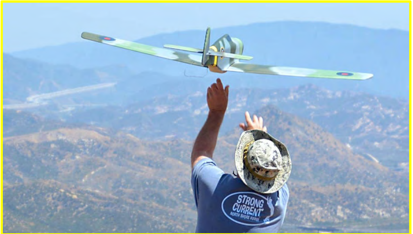
(August Winner) Launching over Cajon at the 2016 FakeFest