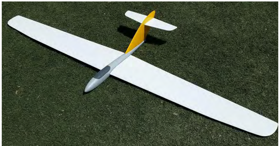
The Hybrid – F/G fuse, covered EPP wings and balsa tail feathers.