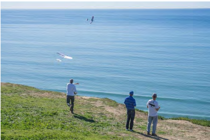
February 6, 2016 Torrey Fun Fly (Ian Cummings)