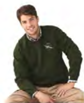
Product ID: A312-027-2942 Digitally Printed Gildan Ringpun Crew Sweatshirt