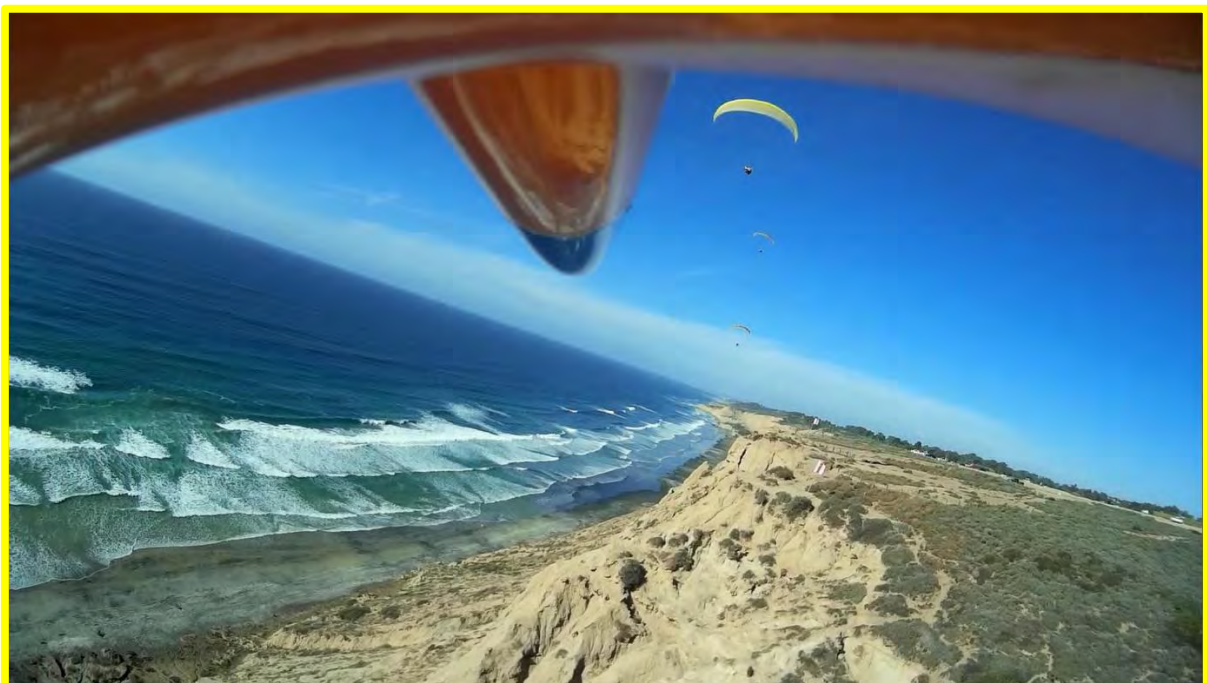
February Winner – Phil Davy's Xperience Pro Carbon 3.3 camera view flying inverted over Torrey