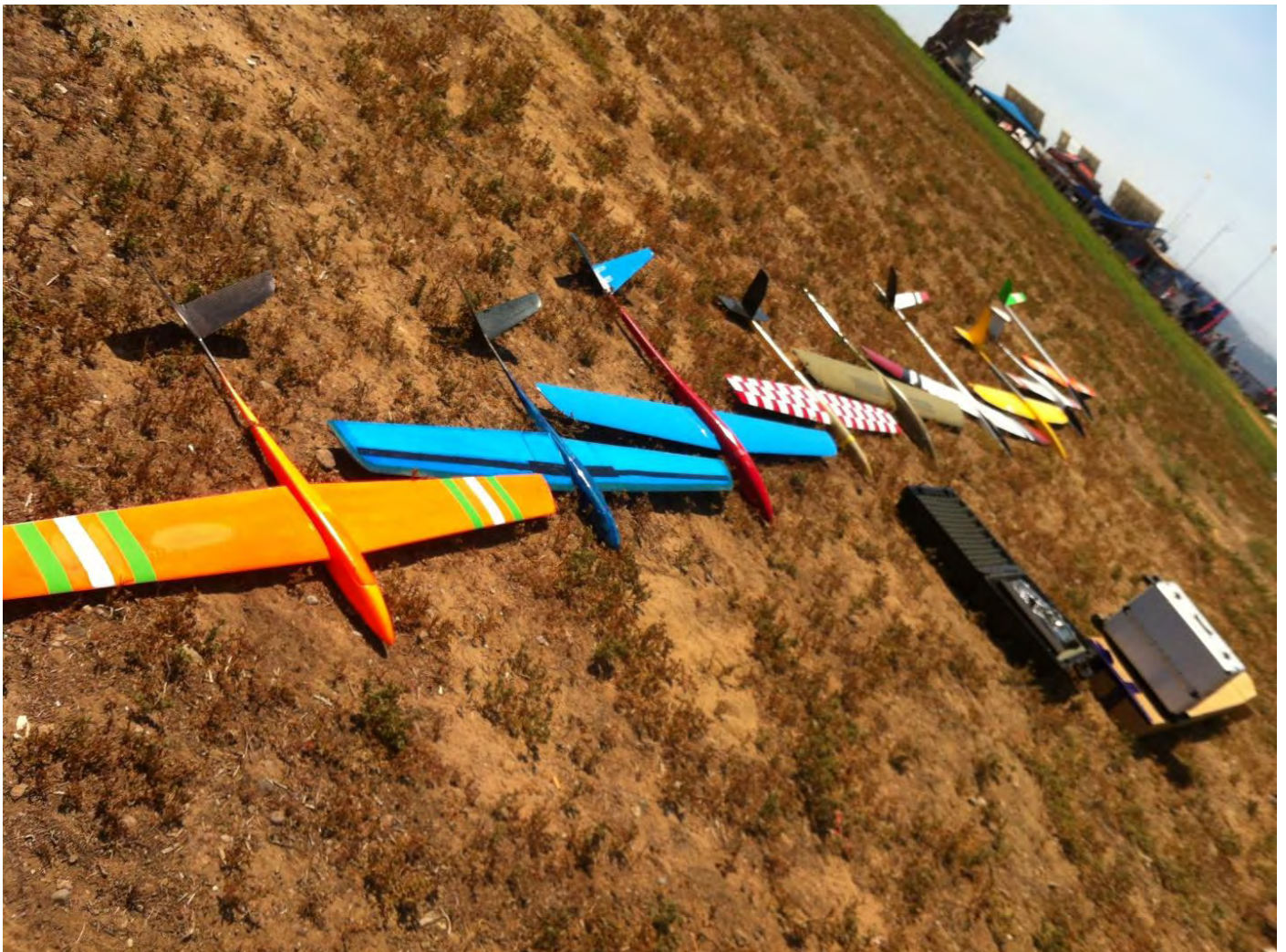
Just a portion of Oran's PNF/TWF fleet.

Oran Bloodsworth, unquestionably the West Coast King of PNF/TNF, brought a fleet. Conditions were a bit south at a flyable 12+ mph.