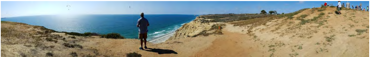
Maiden flight of the Hybrid. Brian Laird on the sticks. According to Brian, she flies inverted effortlessly!