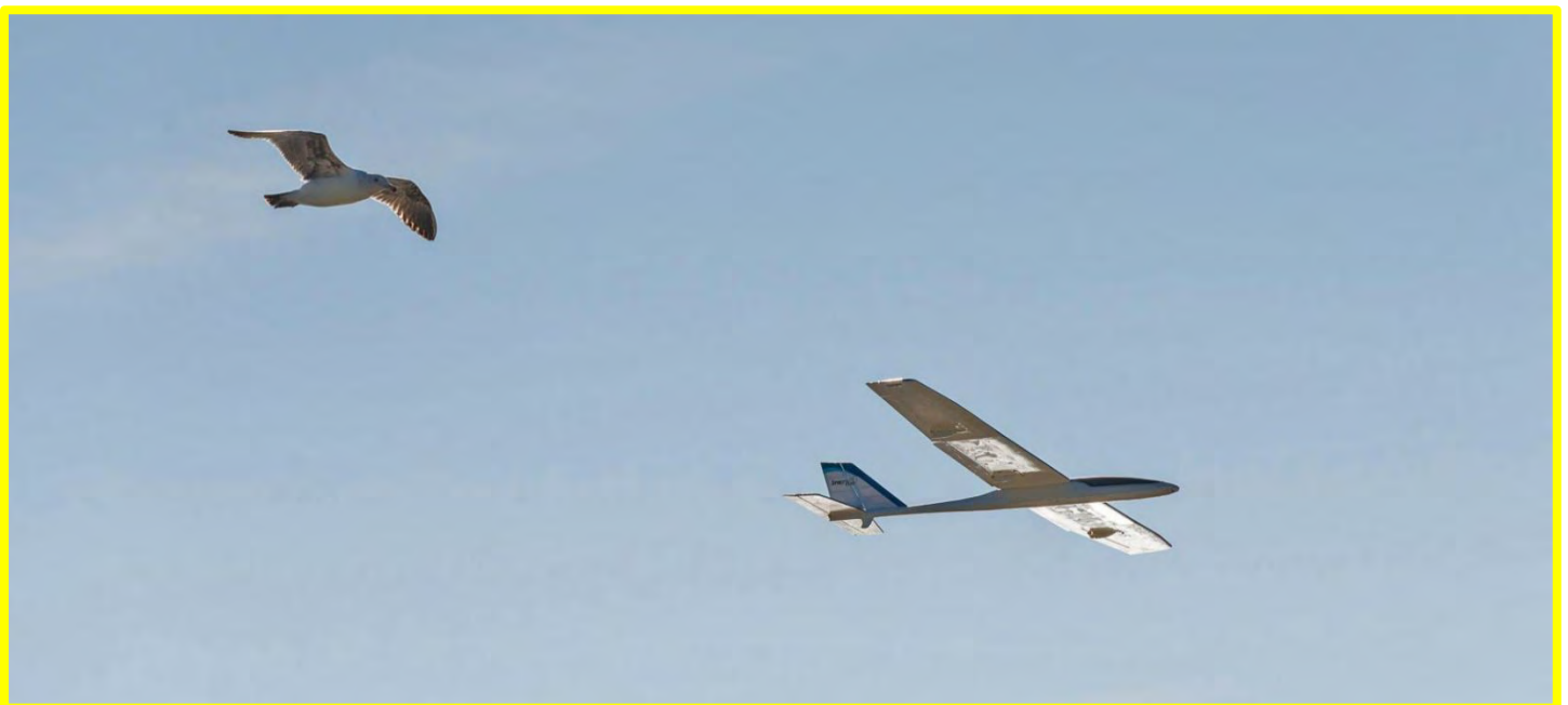
March Winner – Sunlight under a Spirit Elite and a Torrey Pines Gull