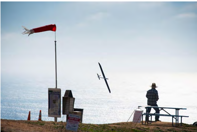
Tight turn at the Torrey Classic Slope Race (Ian Cummings)