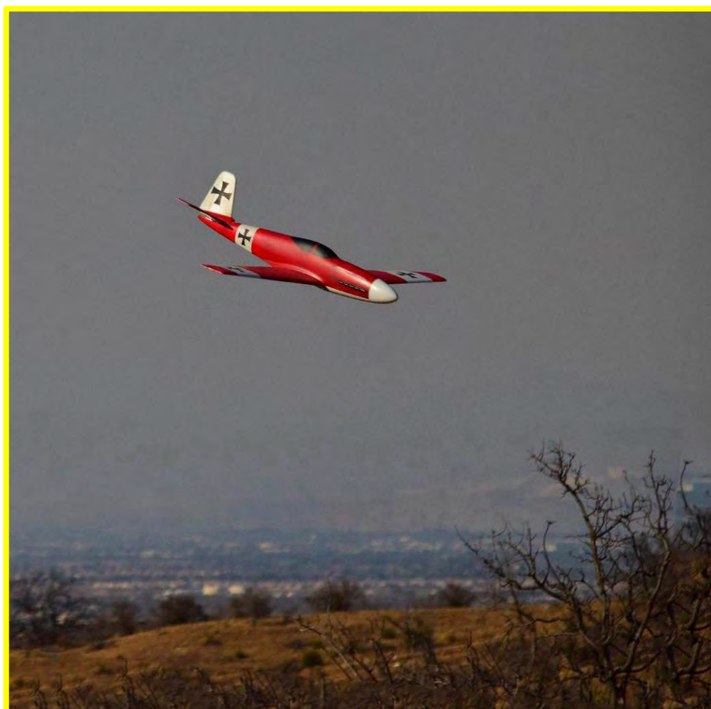
(September Winner) Greg Houck's Heinkel at FakeFest 2016 (Dan Cummins)