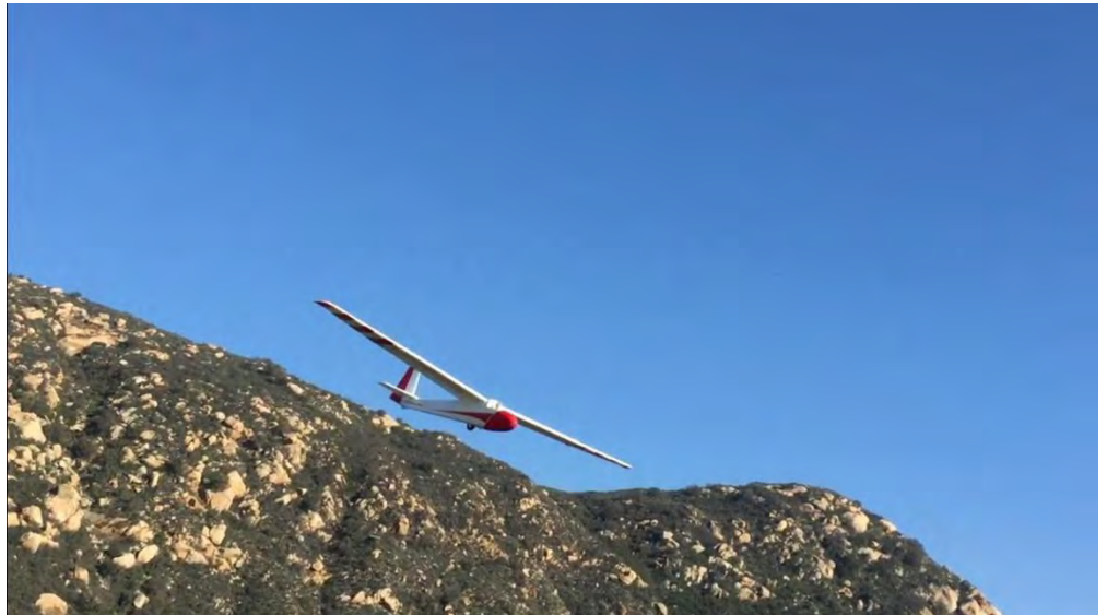
Screenshot – Ka-8 DS'ing at Bill's Hill (Phil Davy)