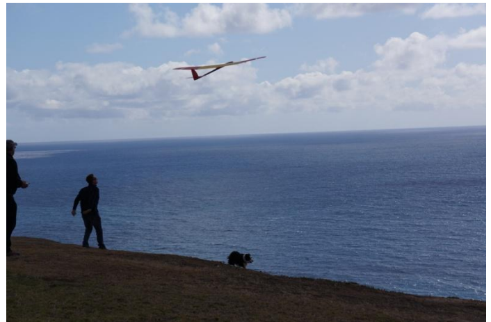
Watch that up elevator!