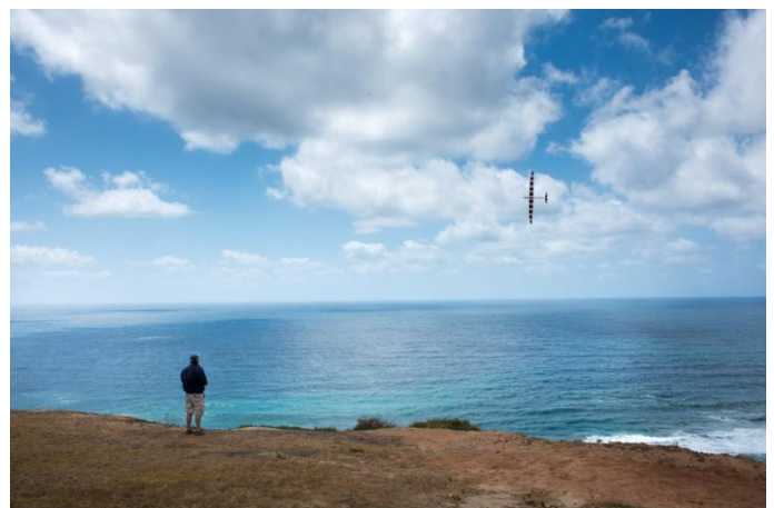
Ian Cummings – Marty Dine Flying the Bluff at Torrey - June Contest