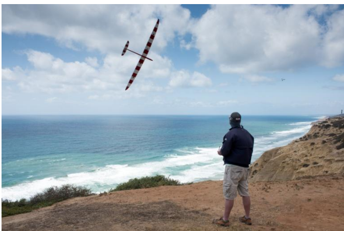
Ian Cummings – Marty Dine Flying the Bluff at Torrey - June Contest