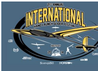
International Hand Launch Glider Festival