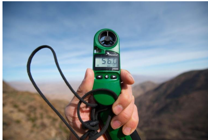
It was a little windy at Mount Laguna Nov. 23, 2014