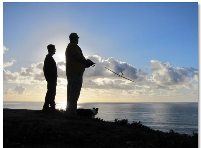
Sunset Silhouettes at Torrey (Ian Cummings)