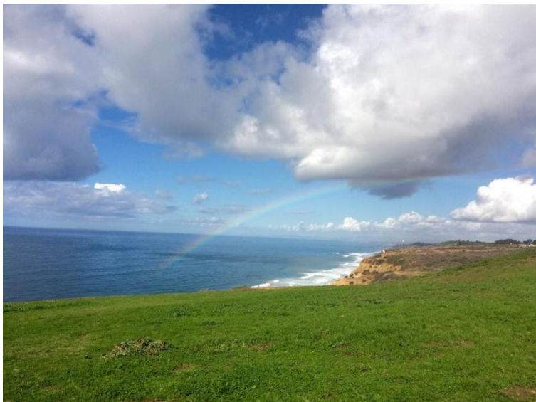
Rainbow over Torrey