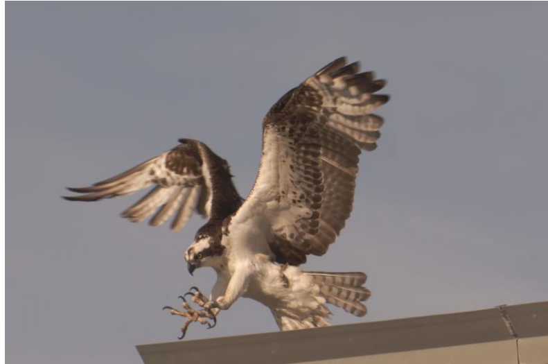
Osprey at Liberty Station