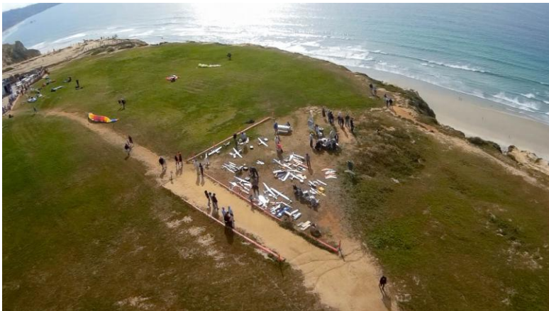
GoPro view of the RC pit area at Torrey taken during the February Fun-Fly