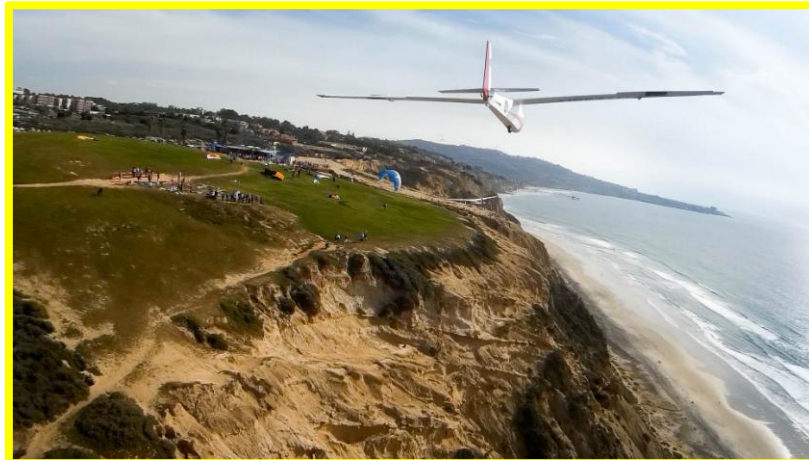
(March Winner) GoPro view trailing a Ka8 taken during the February Fun-Fly (Ian Cummings)