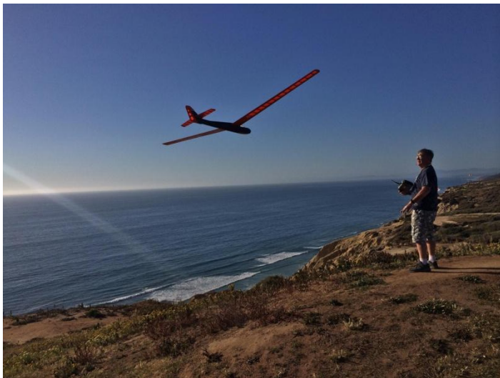
Craig flying the Windfree at Torrey (Will – Windsong on RCGroups)