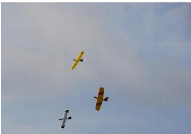
M60's MOM

The regular $10 day fee is required for all pilots.