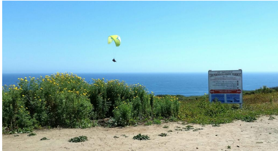
Lazy day at the Bluff (Dan Cummins)