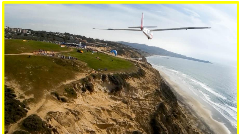
(March Winner) GoPro view trailing a Ka8 taken during the February Fun-Fly (Ian Cummings)