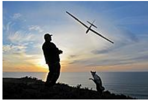
Ka-8 Goofing off