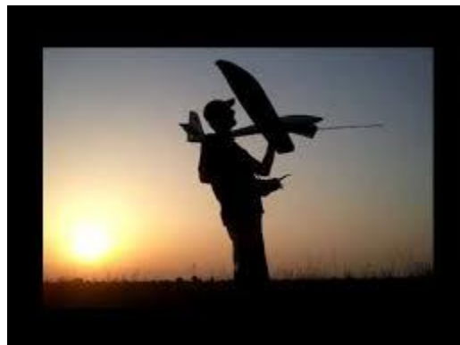
EZ Glider HighStart