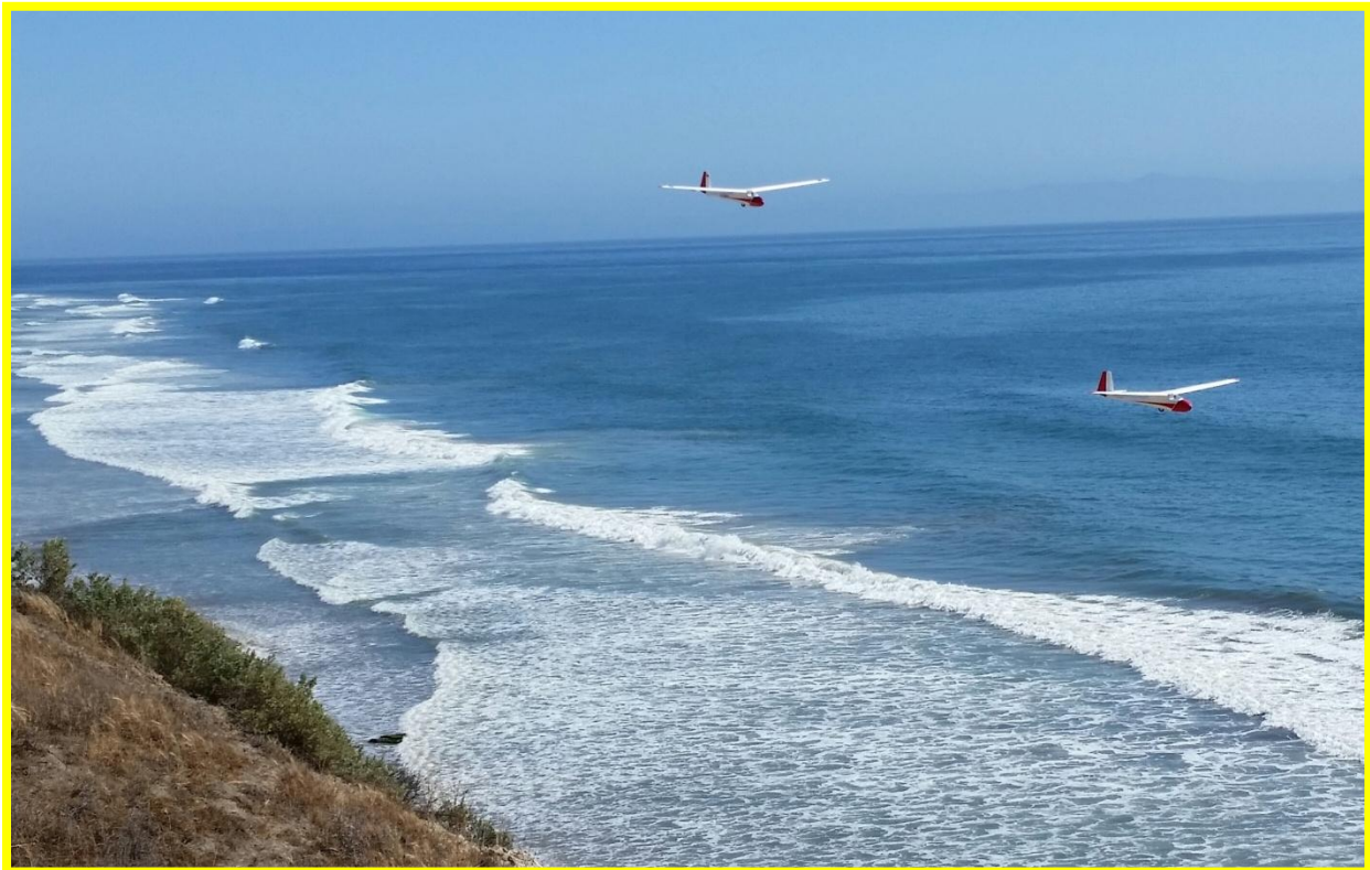
May Co-Winner – Ka-8's over Ellwood at this year's WeaselFest in Santa Barbara