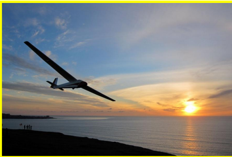
January Winner – KA-8 at Torrey Sunset