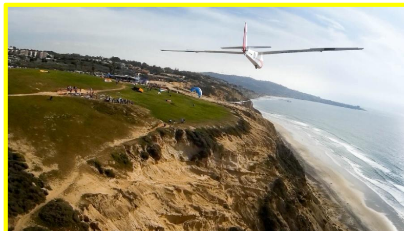
March Winner GoPro view trailing a Ka8 taken during the February Fun-Fly