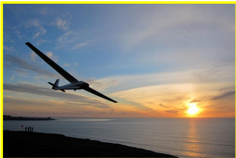
January Winner – KA-8 at Torrey Sunset