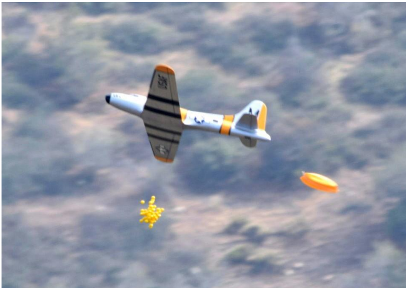
Matin Taraz's B-17 dropping lifeboat and paintballs at PSS Fest (Cajon Pass) 2015