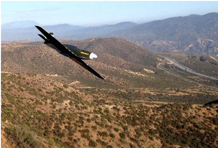
Dan Cummins' lightweight P-51 at Cajon