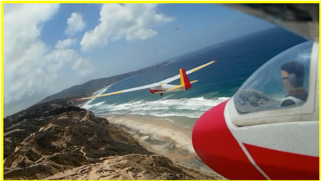
June Winner – Ka-8's flying over Torrey at the Foamy Fun Fly