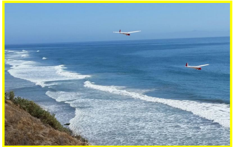
May Co-Winner – Ka-8's over Ellwood at this year's WeaselFest in Santa Barbara