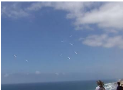
Ka-8 Foam Overcast Check the video at: https://www.youtube.com/watch?t=159&v=d7yyCnsdQMk