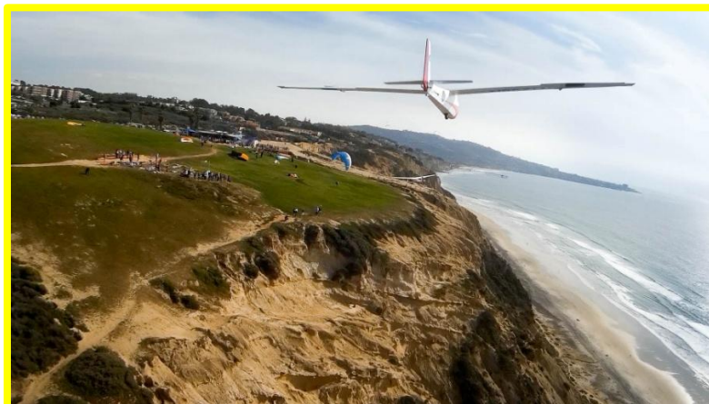
March Winner GoPro view trailing a Ka8 taken during the February Fun-Fly