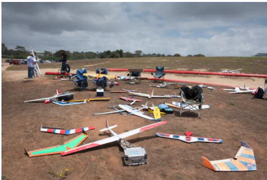
RC pit area and lots of foamy variety (Ian Cummings)