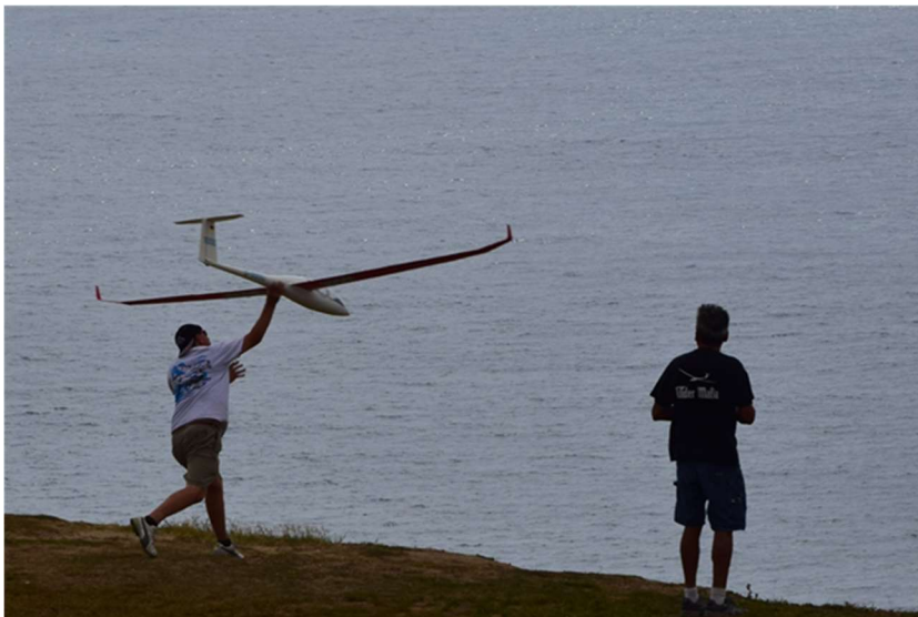
Tom's DG-1000