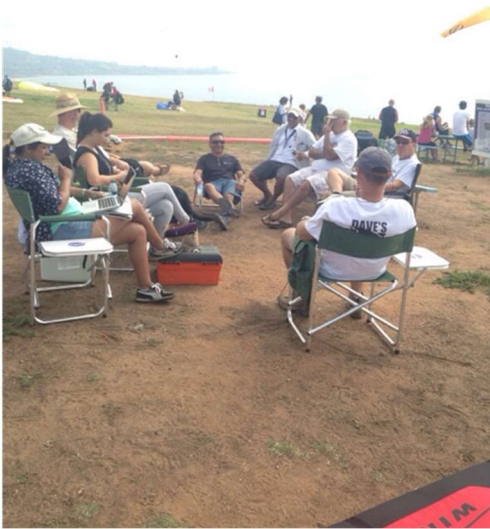
The usual gathering at the pit area.