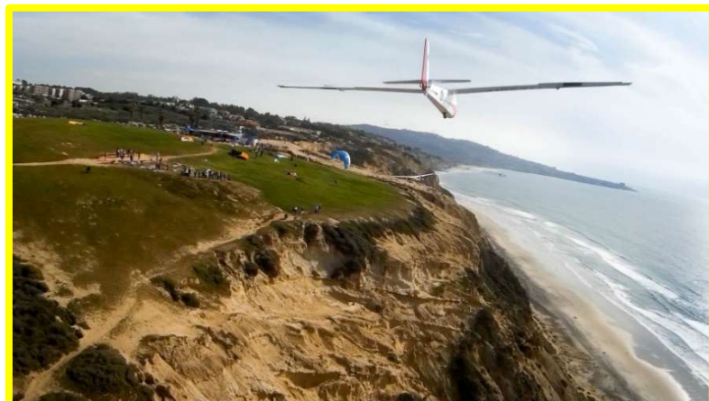
March Winner GoPro view trailing a Ka8 taken during the February Fun-Fly