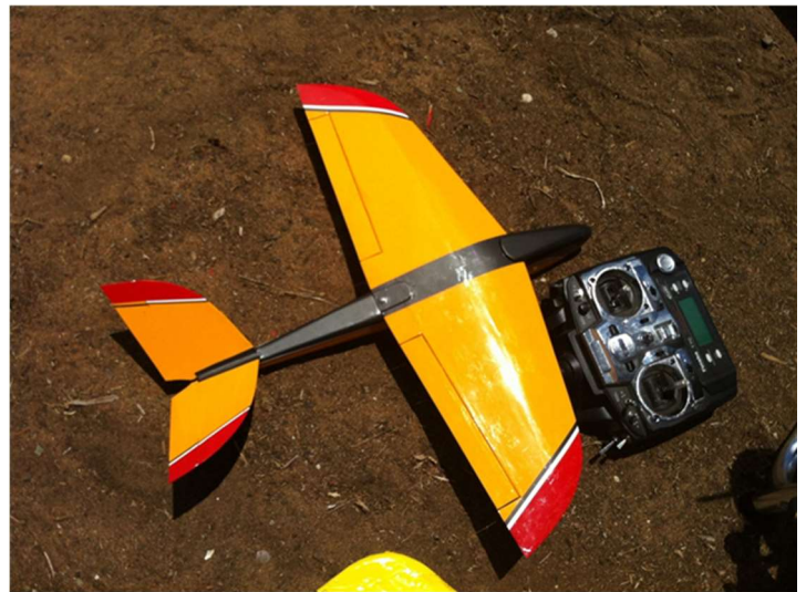
Scott's Stubby Nose Limit