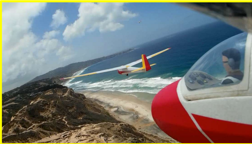
June Winner – Ka-8's flying over Torrey at the Foamy Fun Fly