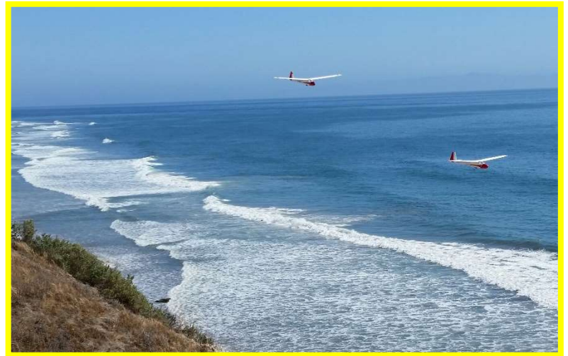
May Co-Winner – Ka-8's over Ellwood at this year's WeaselFest in Santa Barbara