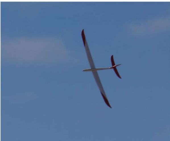
Offspring of a PNF and TWF.