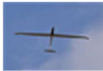
Brian's (from Riverside) plane inverted