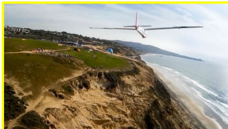
March Winner GoPro view trailing a Ka8 taken during the February Fun-Fly