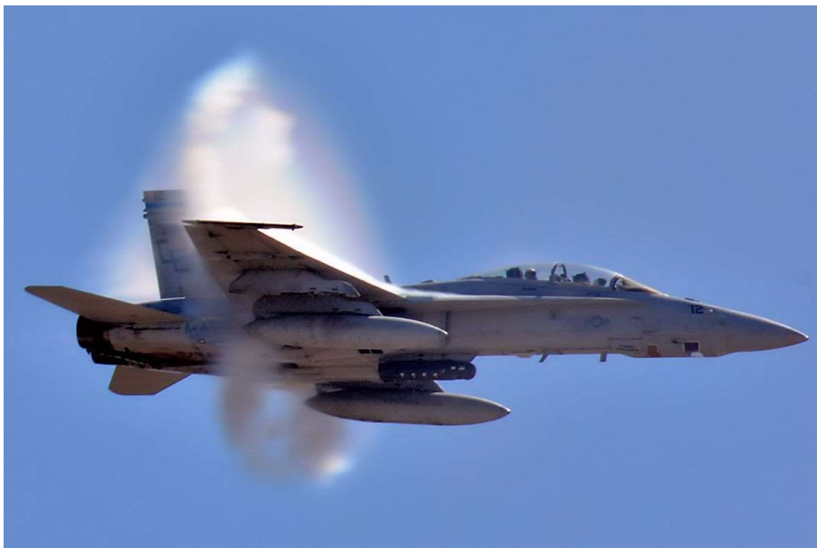
FA-18 at the Miramar Air Show (Pete Rissman)