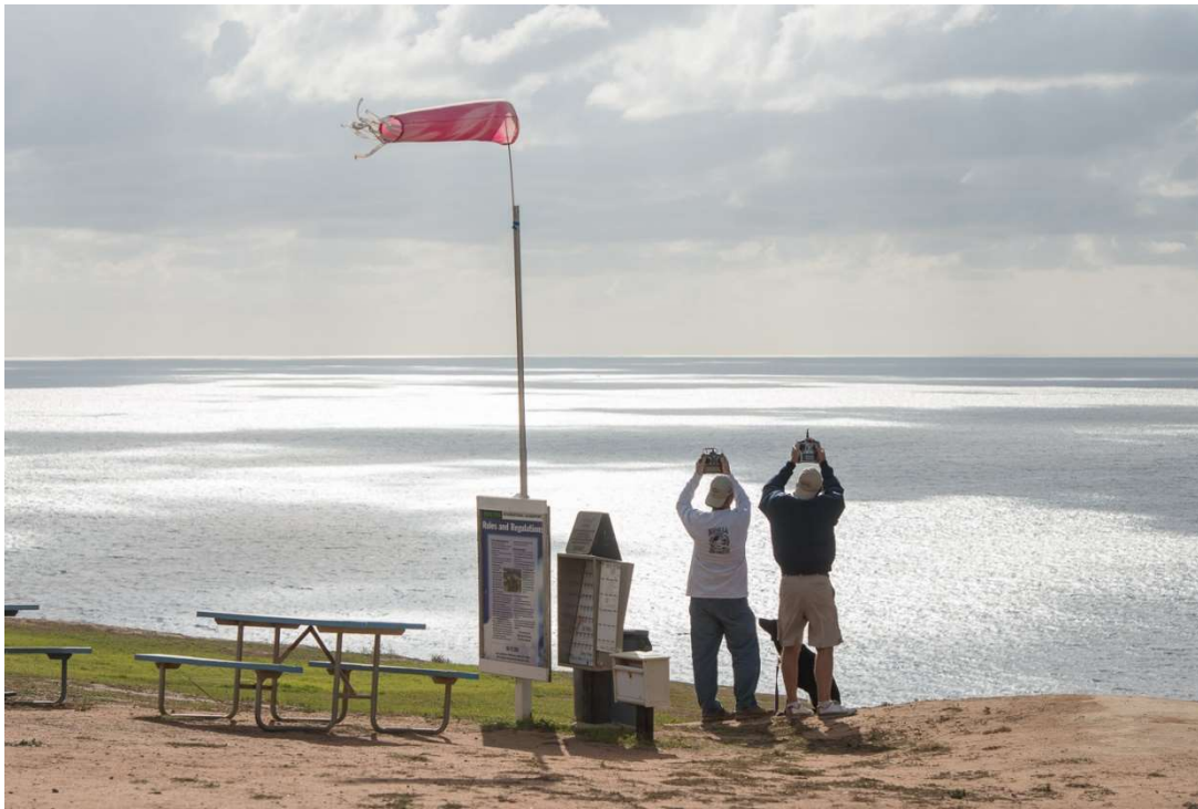
Dan Cummins, Greg Houck and an epic day at Torrey (Ian Cummings)