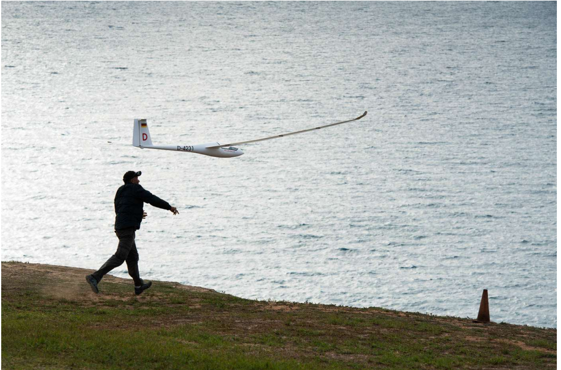
Steffen Peters launching 4 meter Nimbus