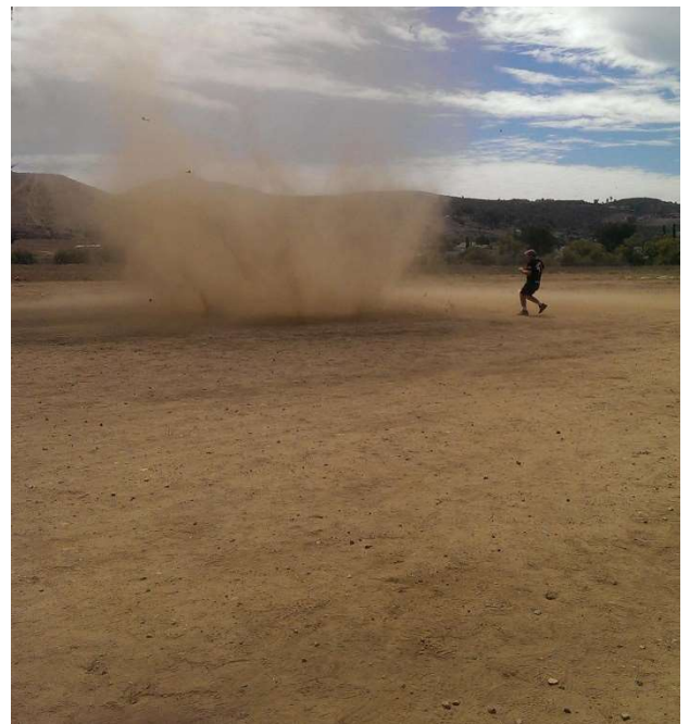
Dust devil at the Poway Field