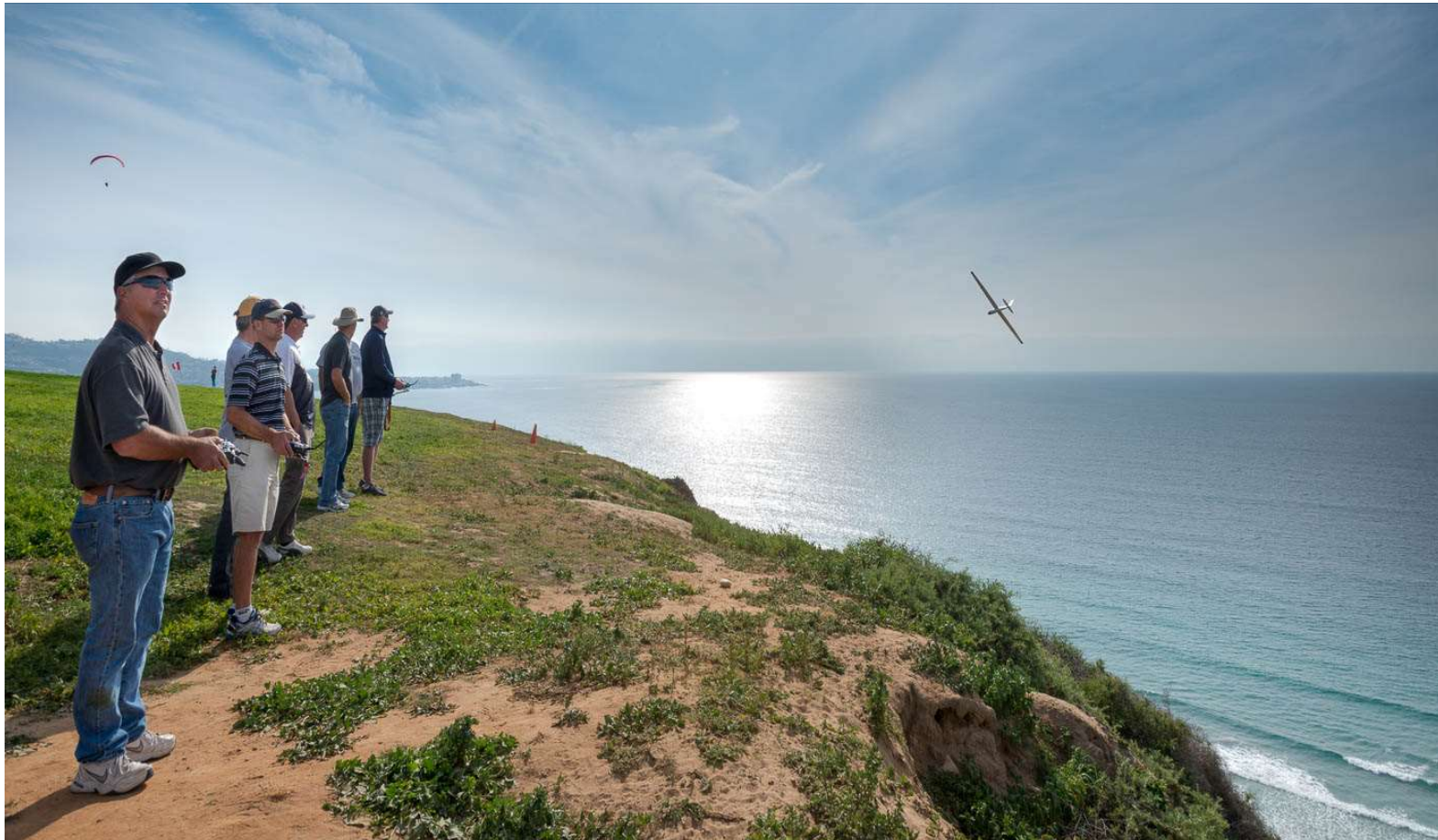
Flight line at the Torrey Fun Fly