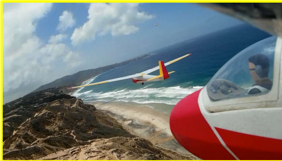
June Winner – Ka-8's flying over Torrey at the Foamy Fun Fly