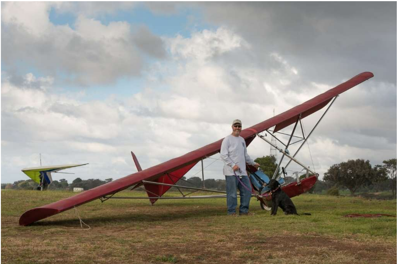
Me, my faithful companion and a very cool Red Goat