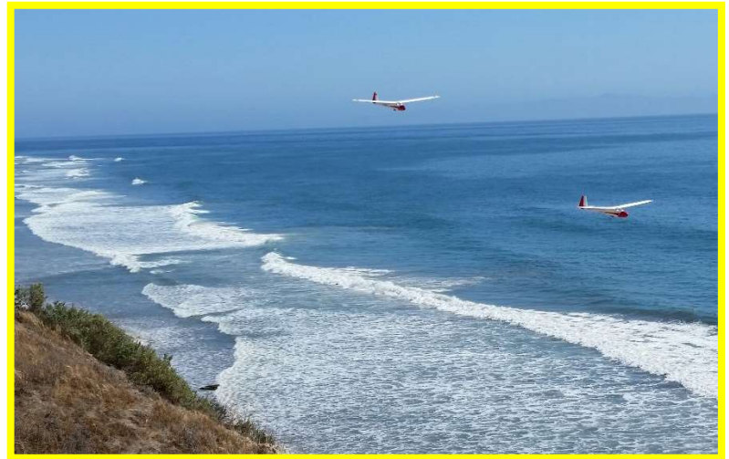
May Co-Winner – Ka-8's over Ellwood at this year's WeaselFest in Santa Barbara