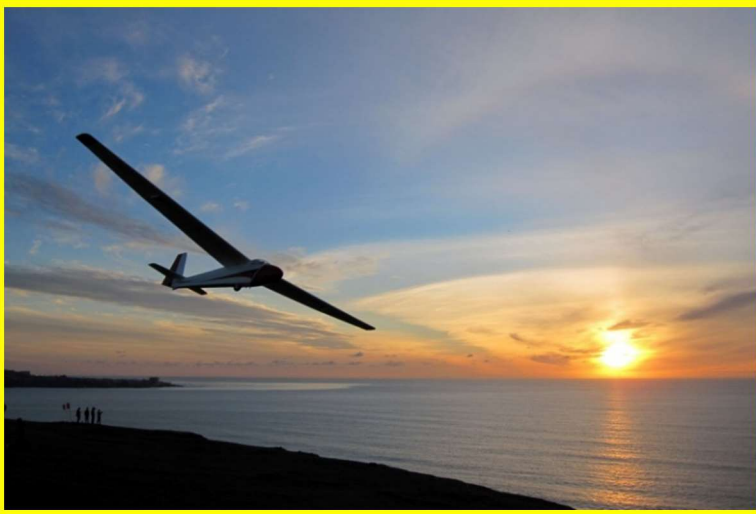
January Winner – KA-8 at Torrey Sunset