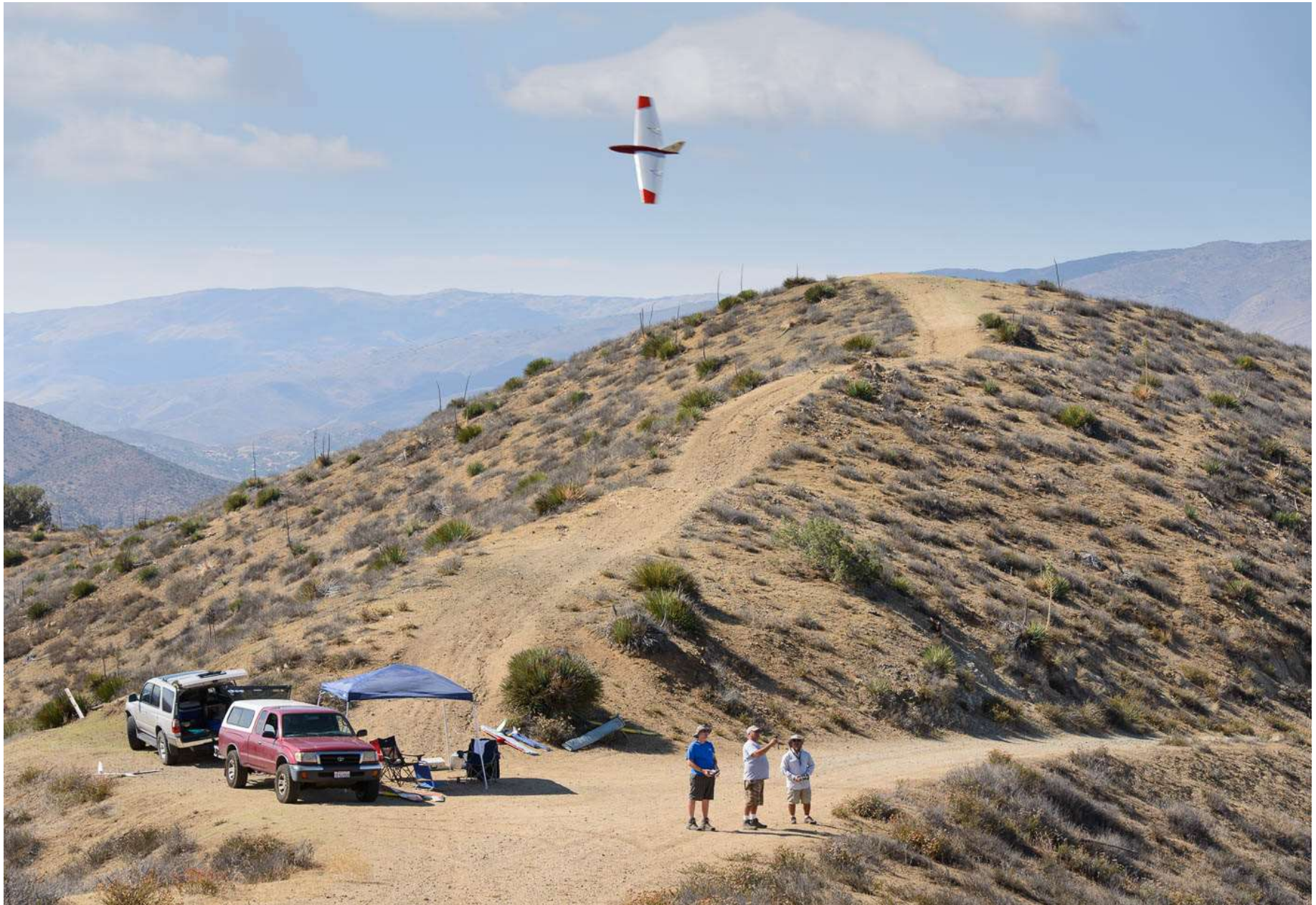
Bills Hill Gang at Parker Mountain