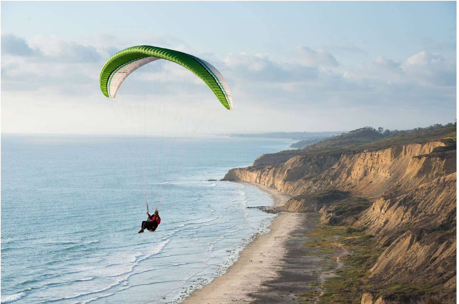
Paraglider over Torrey Pines