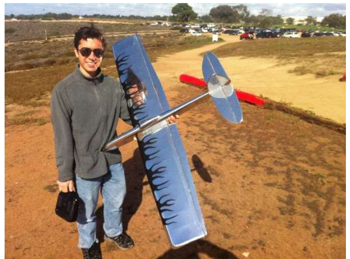
UCSD's Dan M's silver Spitfire after a 30 minute maiden flight