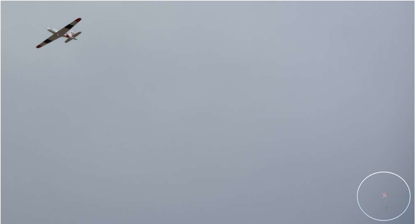
Ian Cummings captured Greg Houck's PSS B-17 at Torrey...and the smokejumper dropped by the B-17!