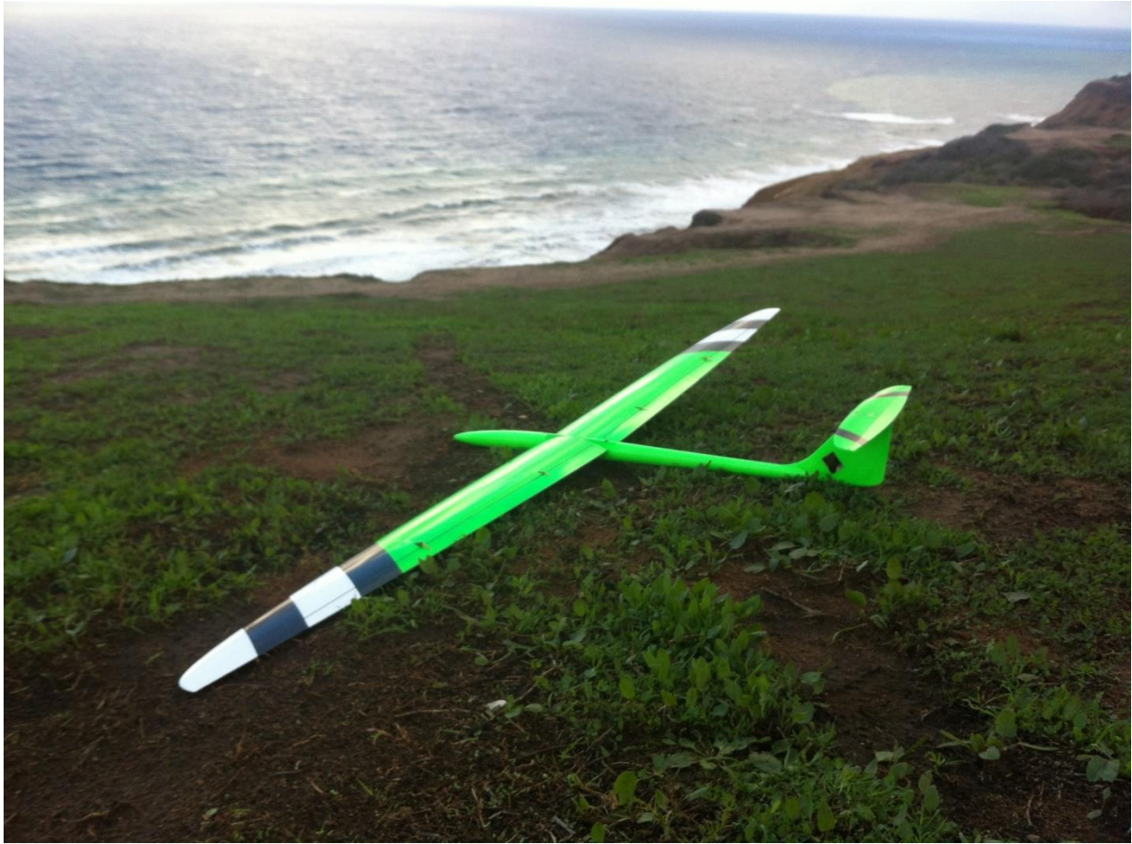
Godzilla (K2M Kinetic, 2-meter)– Christmas Eve