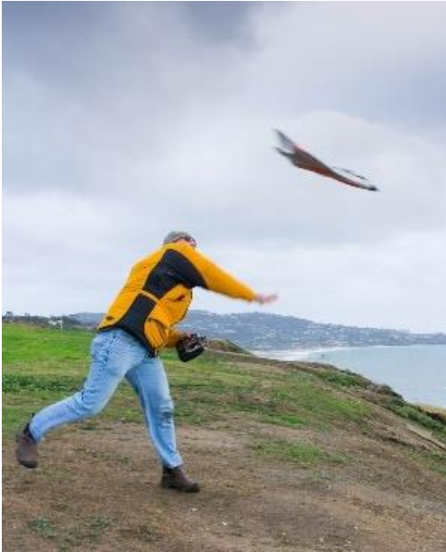
December 16 th .