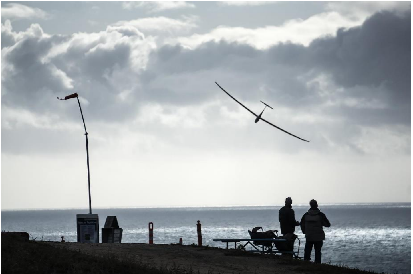
A blustery day in late November

A yearly winner will be selected from among the monthly winners and will receive a prize (their photo will be used as the website and newsletter masthead AND will appear on the following year's club membership card). Needless to say, horizontal format photos are preferred . Email your photos (.JPG format preferred) to Dale Gottdank at dgottdank@gmail.com . Please provide your name, location of photo and photo description.