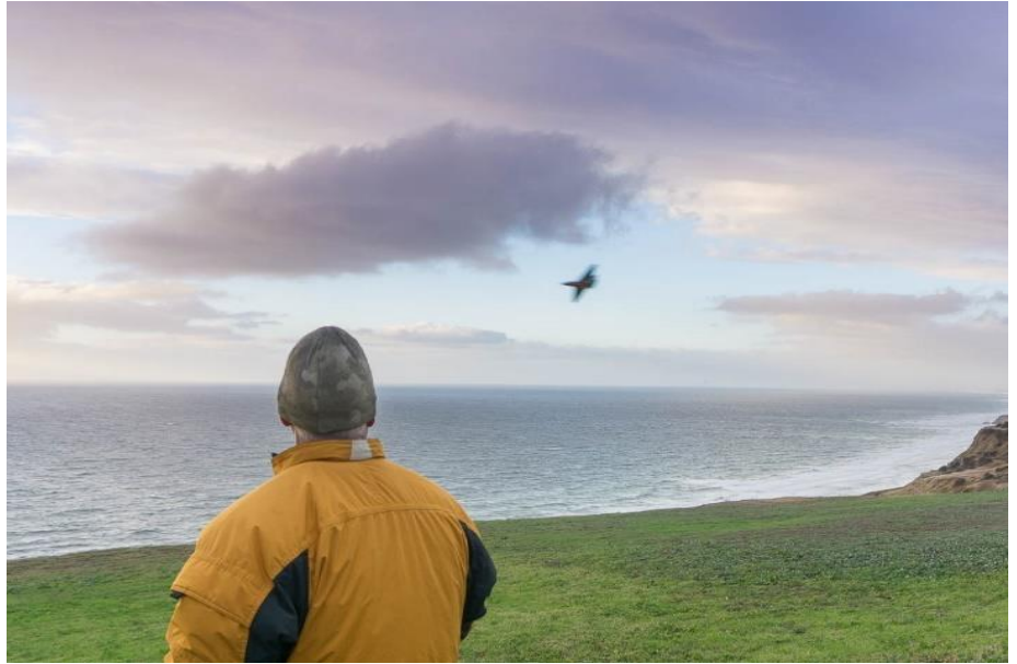
December 16 th