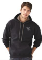
Product ID: A382-537-7660 Digitally Printed Gildan Hooded Sweatshirt