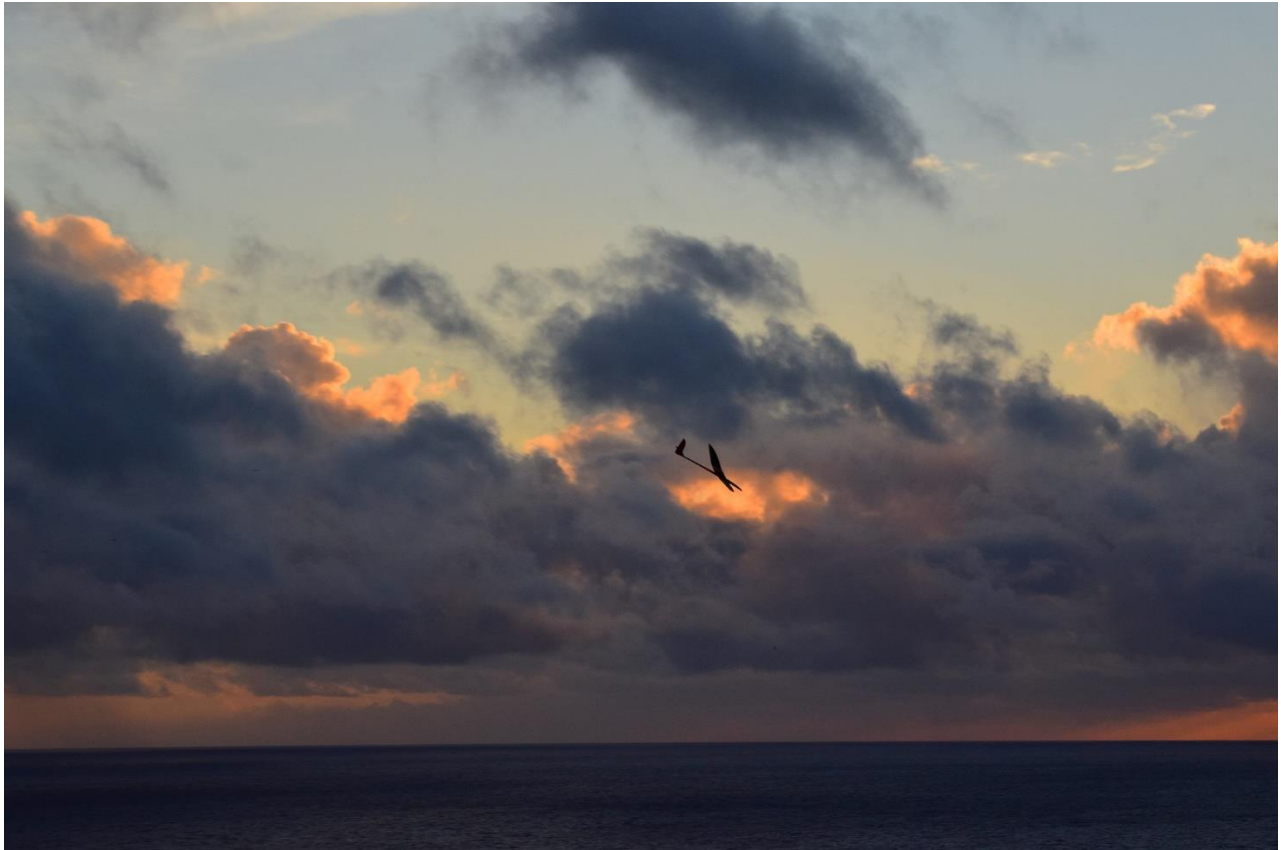
NAN Shadow over Torrey (Greg Houck)