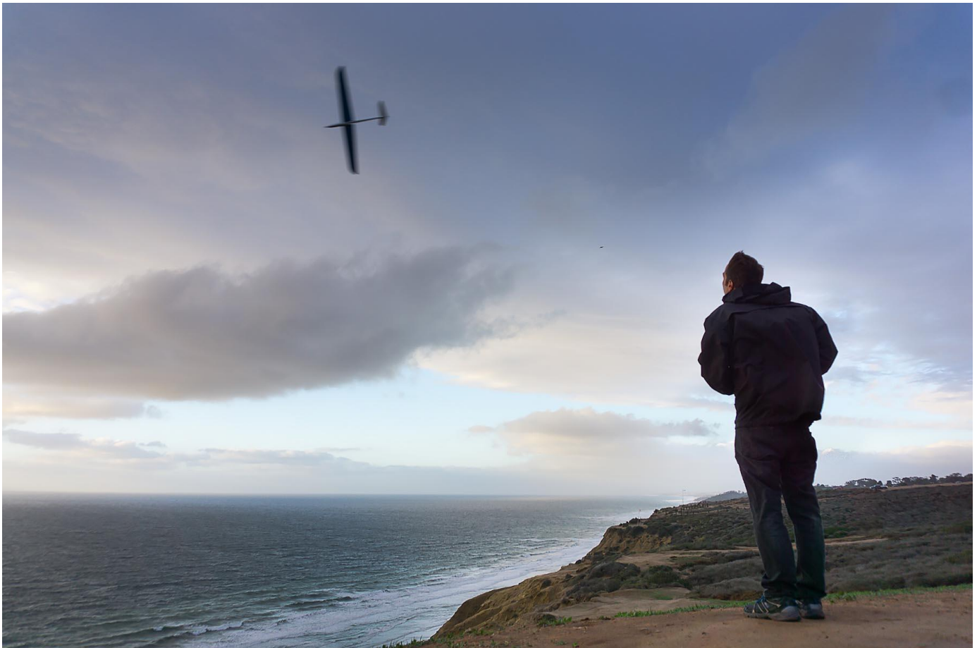
December 16 th .