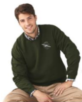
Product ID: A312-237-3942 Digitally Printed Gildan Ringpun Crew Sweatshirt