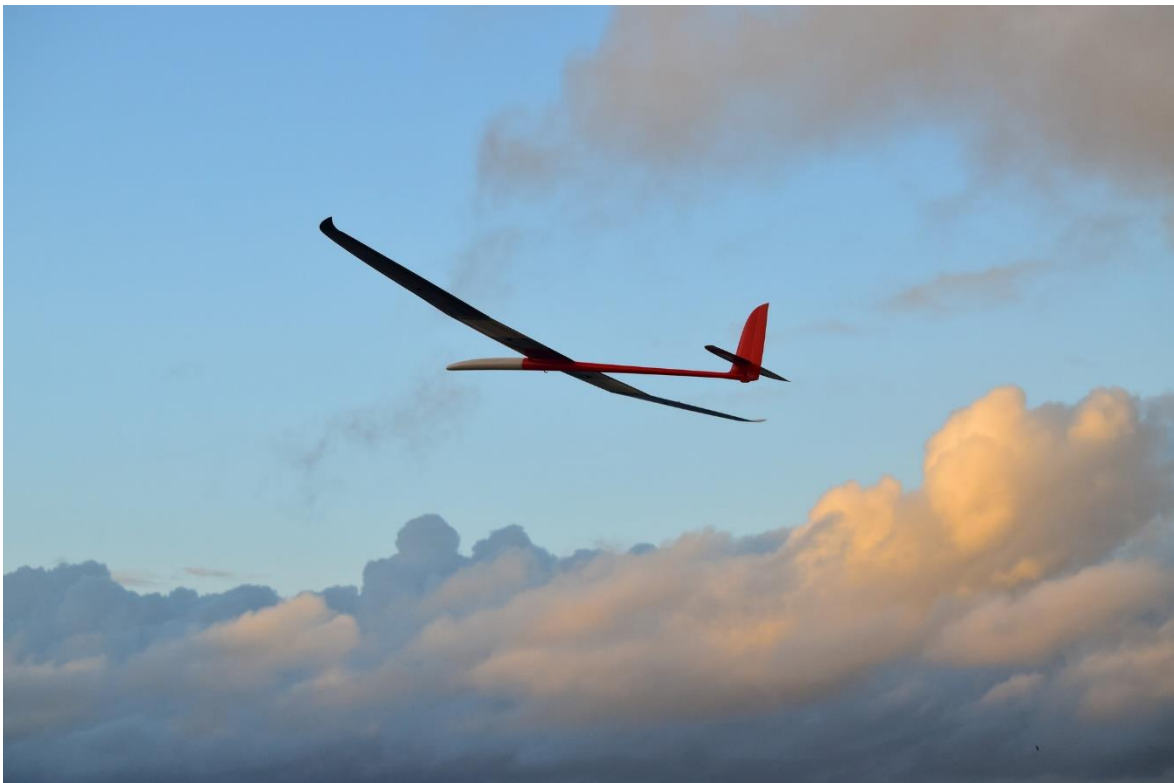
NAN Shadow over Torrey clouds (Greg Houck)