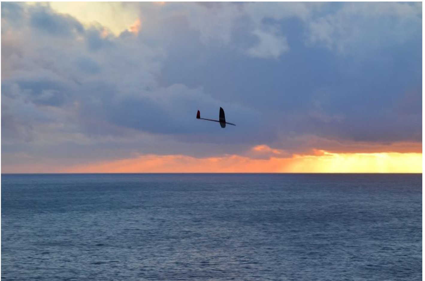
NAN Shadow at Torrey