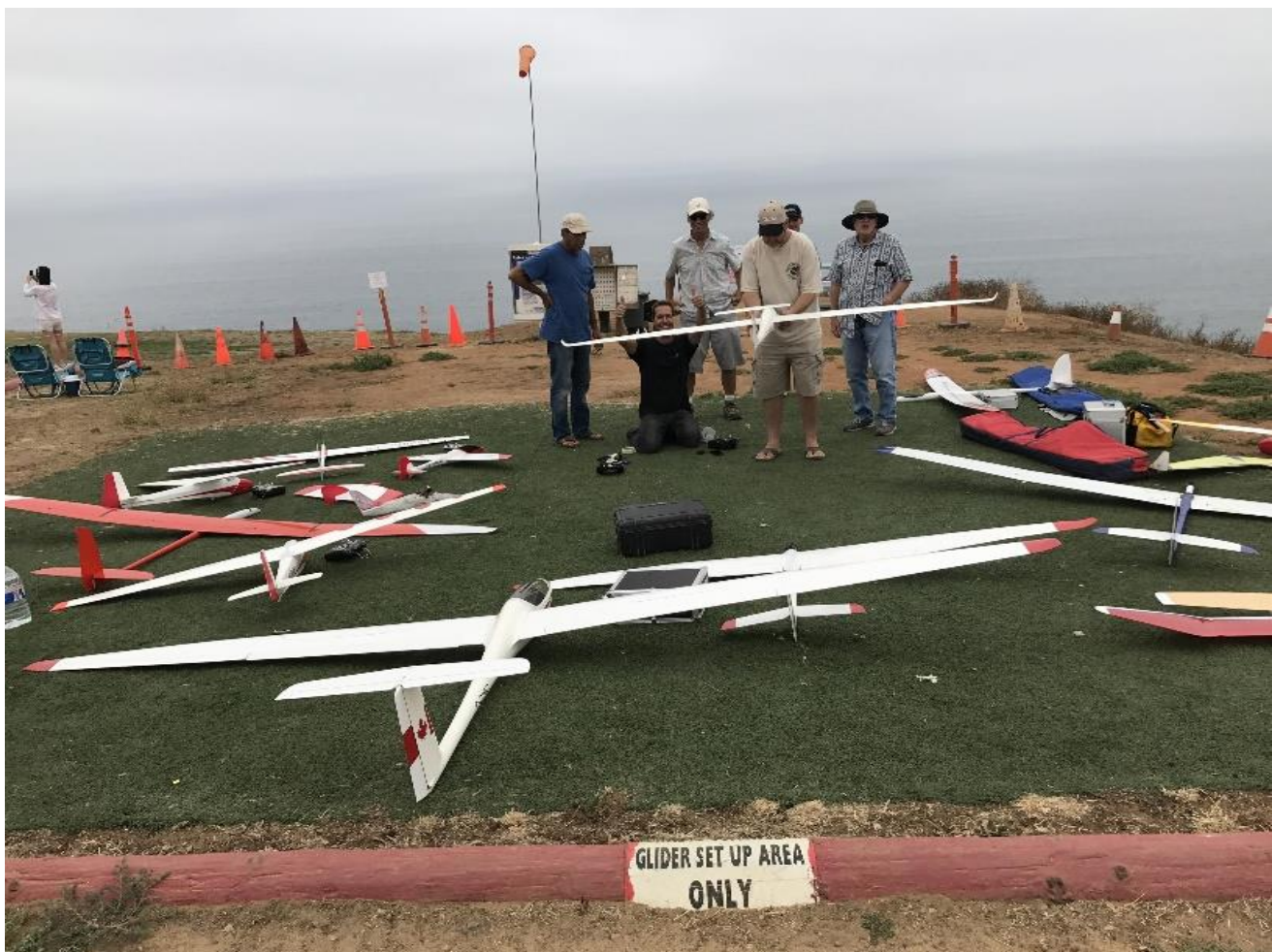
Scale Glider Fun Fly at the Gliderport