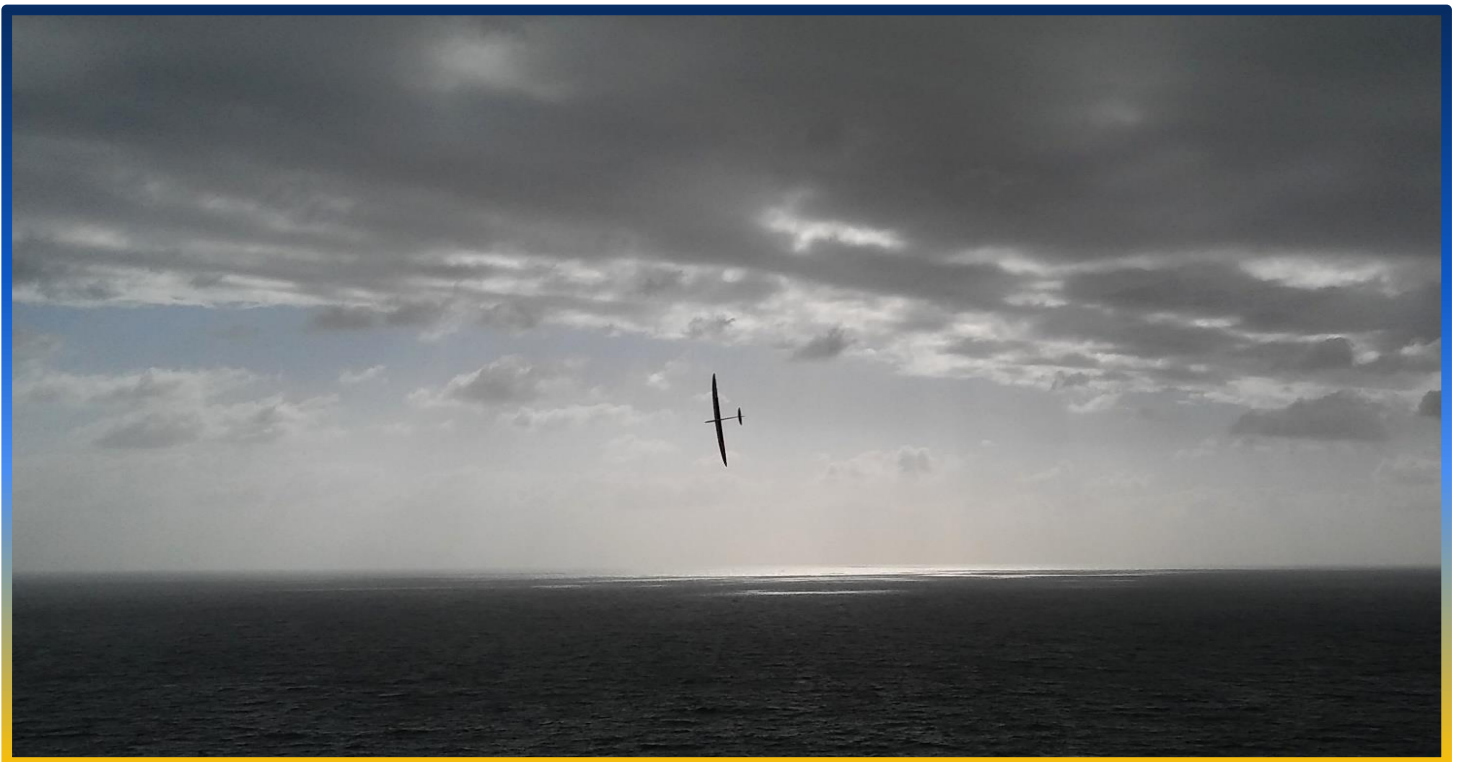
Summer Winner – Nyx over Torrey