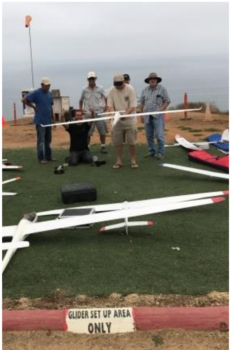
How many slopers does it take to CG a Discus?