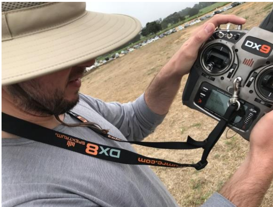
Justin's 26 min Slope Flight

This fall, a Slope Combat contest is planned. Dates and location will be posted on RCGroups, TPG Facebook and other social media.