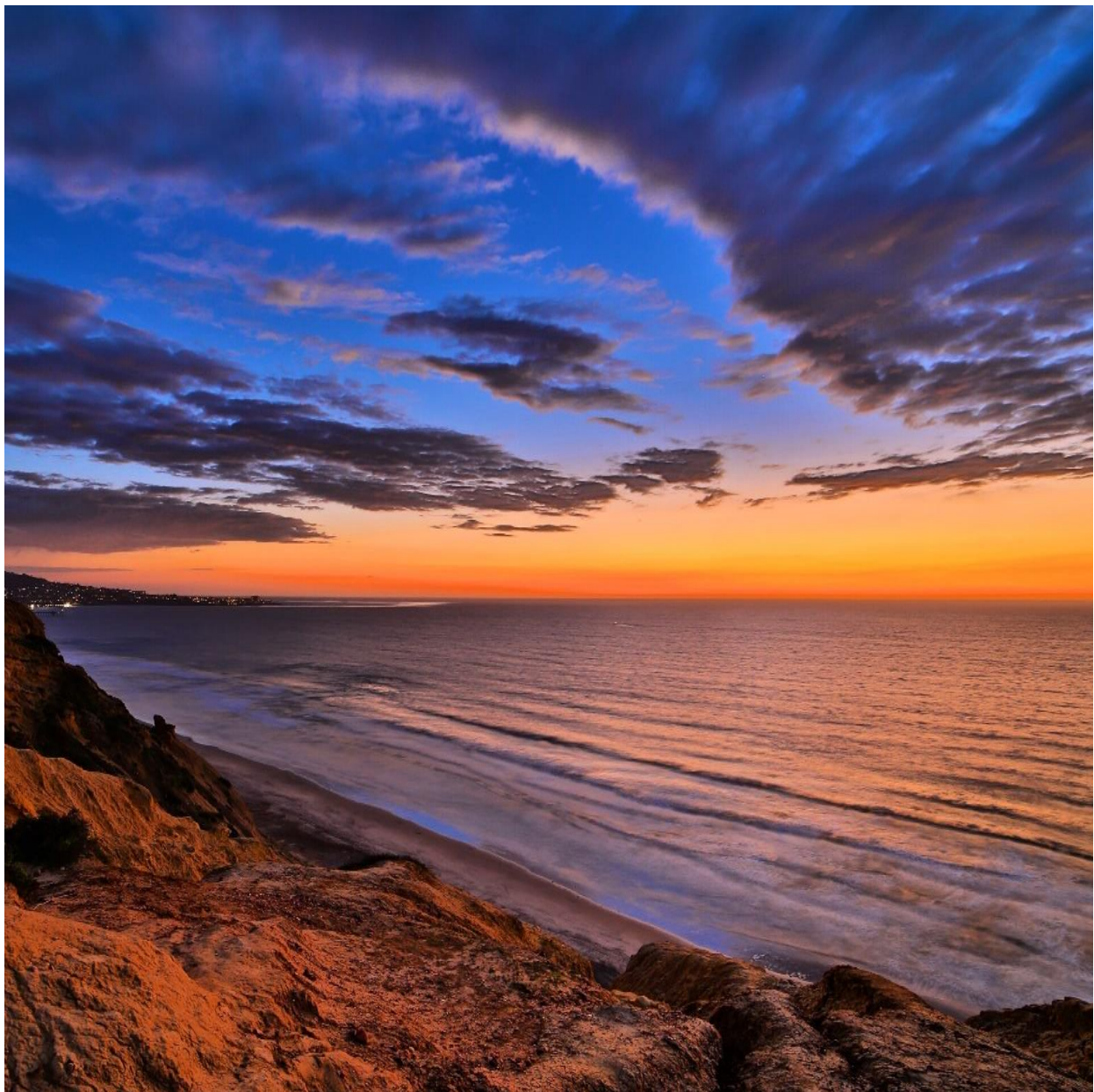
Torrev Sunset