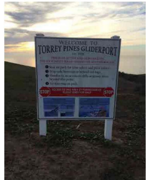
The warning sign for spectators as you approach the Torrey Pines Gliderport and RC launch area.

For anyone who is not a current subscriber, you can be automatically notified when the next issue of RCSD is posted by becoming a member of the RCSoaringDigestYahoo! group .