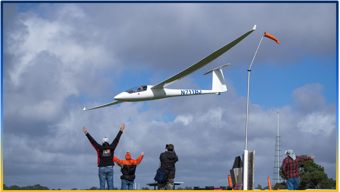
February Winner – Full-scale Stemme S-10 flyby at Torrey