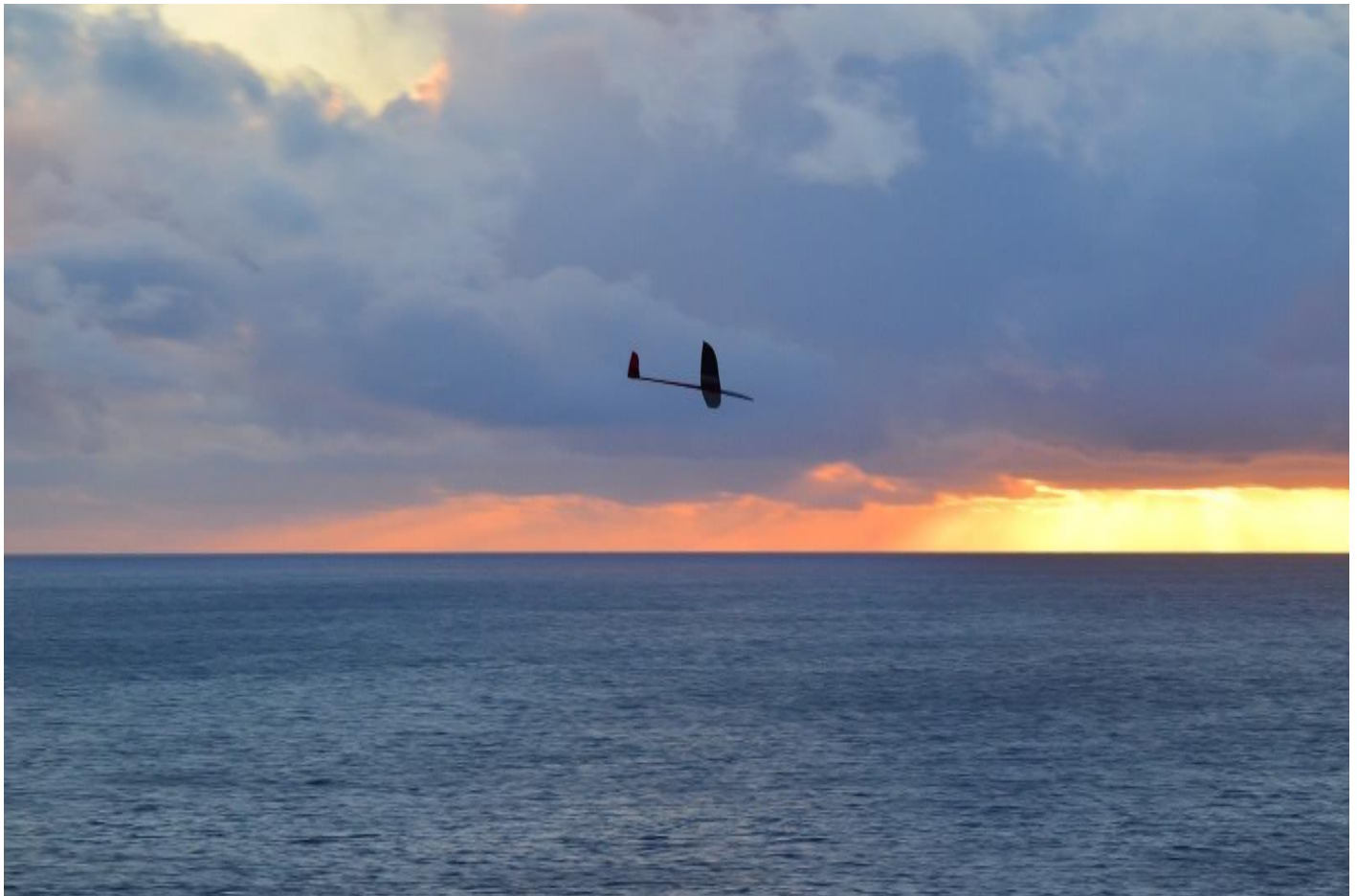
NAN Shadow at Torrey