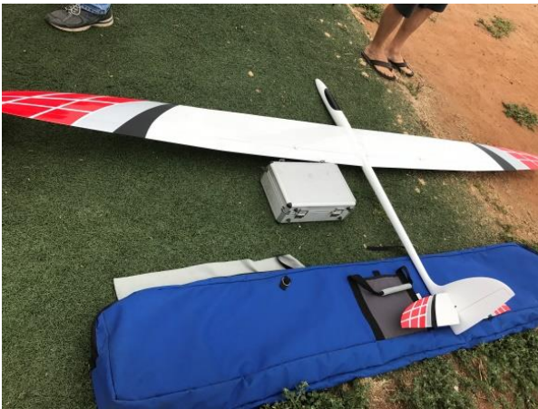
Gregg Bolton's "scale" Nyx

August 26 th was the Scale Fun Fly attended by over a dozen pilots bringing 3 dozen planes. Conditions were overcast with light west winds with lift from 11 till past 5 pm.