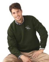
Product ID: A312-237-3942 Digitally Printed Gildan Ringspun Crew Sweatshirt