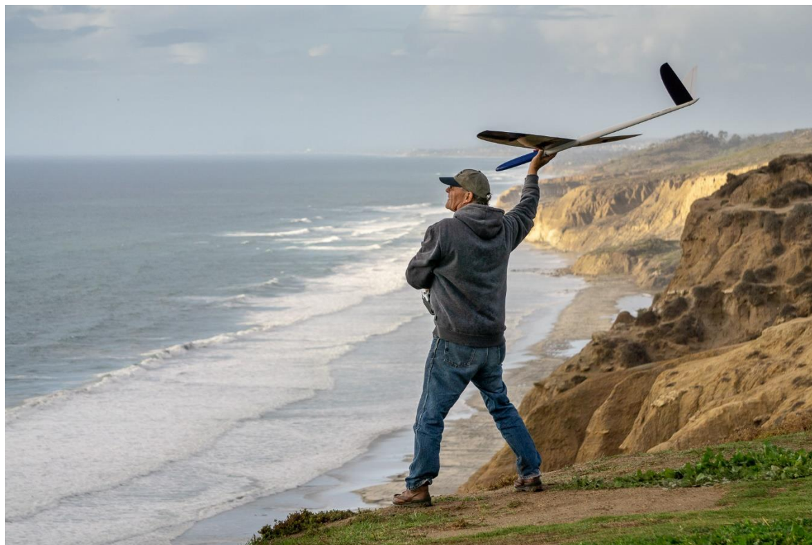
Marty Zimmerman launching into strong Torrey wind