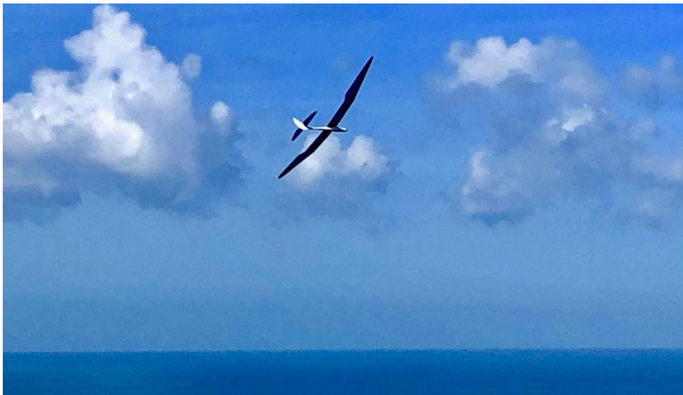
My Bird of Time, finally complete and in the sky over Torrey.

My first real job in 1980 was working in Phoenix's largest hobby shop, where I got introduced to all kinds of new toys! I brought home, one day, a nitro powered outrigger hydroplane kit that my dad and I got to build and race. We ended up with six different boat classes and raced them all in Phoenix, Tucson, and here in San Diego. I also built a Gentle Lady 2M sailplane, flew it on a couple of hand tosses, but there was no club there to get some advice, so I sold it. After four years in the Hobby shop, and not able to get discounted parts and fuel, we went back to sailboats for the next couple of decades. During this time I got involved in racing electric and nitro, on-road and off-road cars. The competition is absolutely fierce with both nitro boats and cars! In 2004, I bought a 2M Spirit kit and a Hi-start. Still no sailplane club in Phoenix, but the web taught me to teach myself on how to catch thermals from a high school football field. I had gotten hooked big time as it was a blast to see something you've built from a box of wood, and get specked in the sky. I built another Spirit from scratch, and