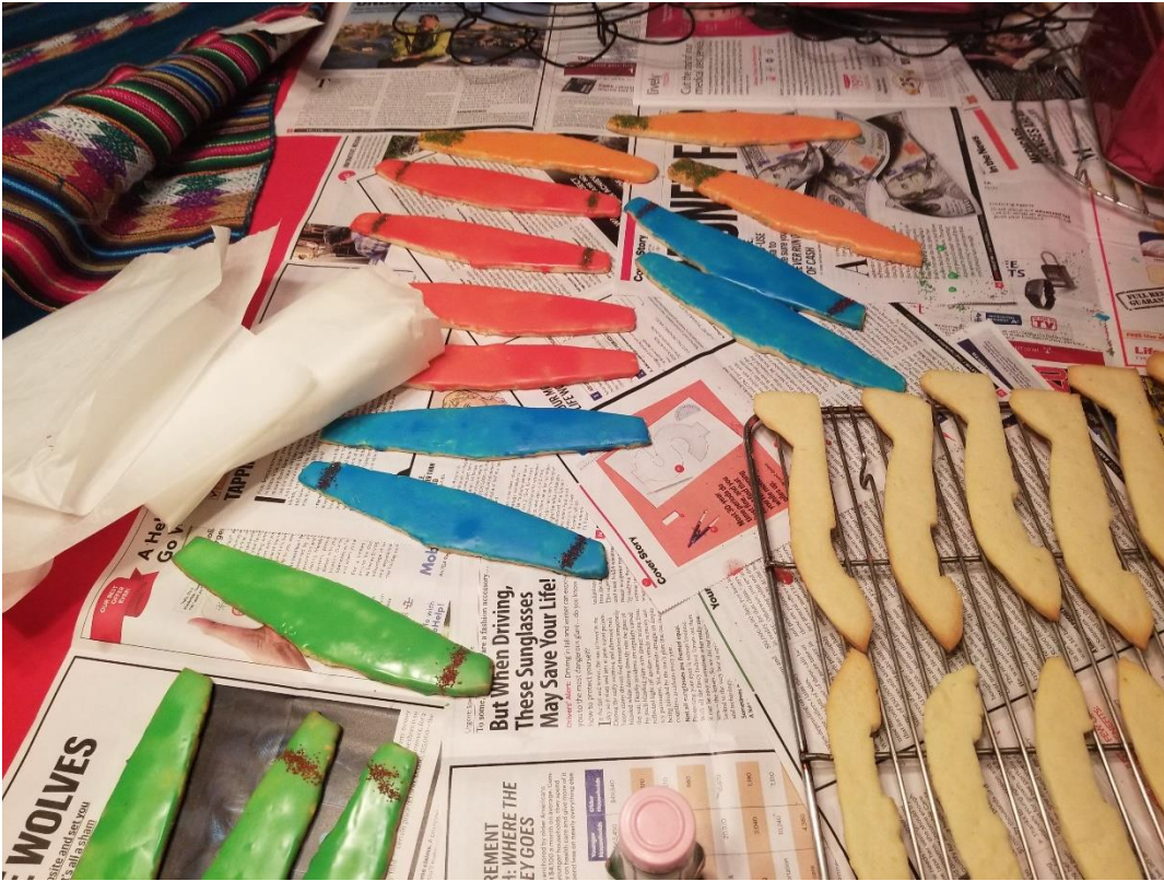
Roxy's aircraft assembly line.