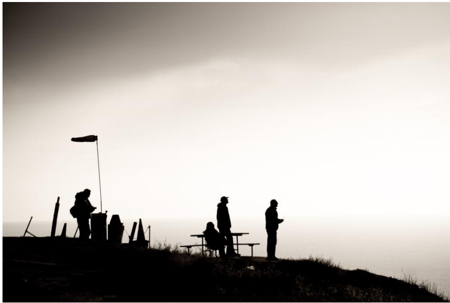
Windy autumn day at Torrey