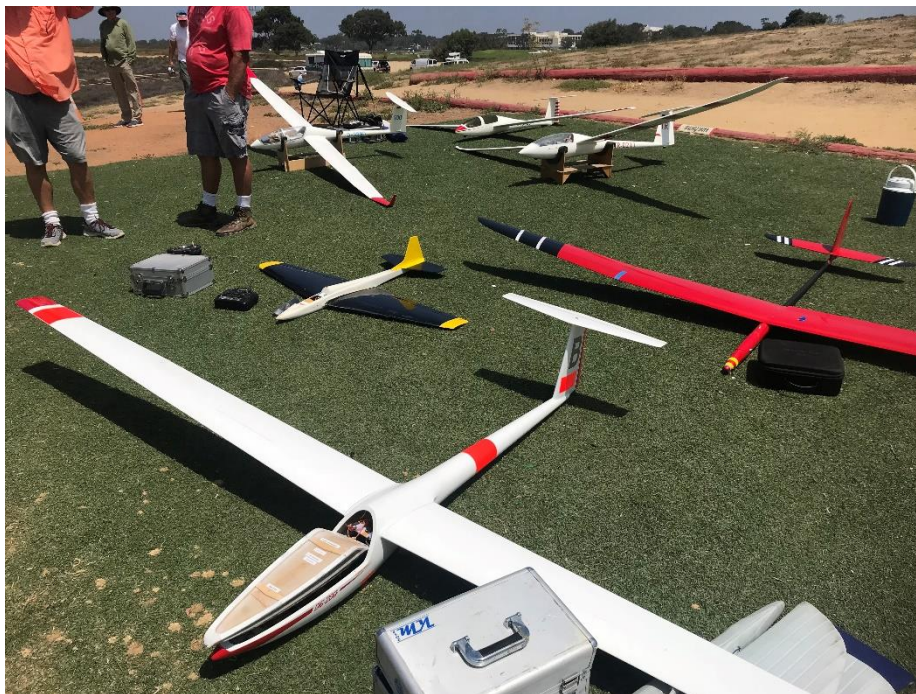
September 2018 Fun Fly