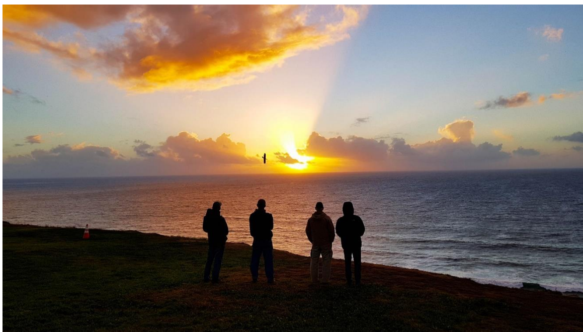
Sunset soaring at Torrey