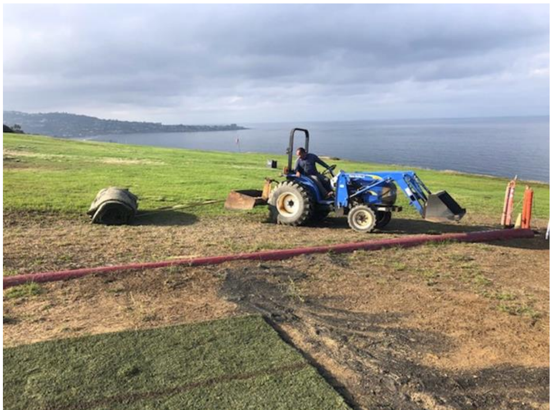
So much easier doing it this way