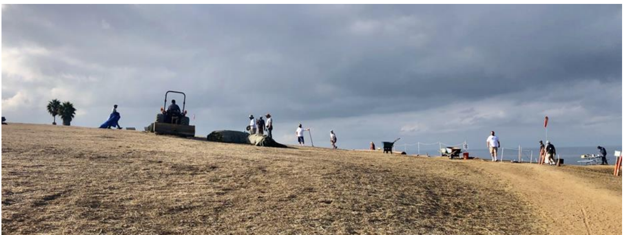
A cool day to work with a view2 – lots of fresh air

Here are some pics of the last install day, October 10 th .