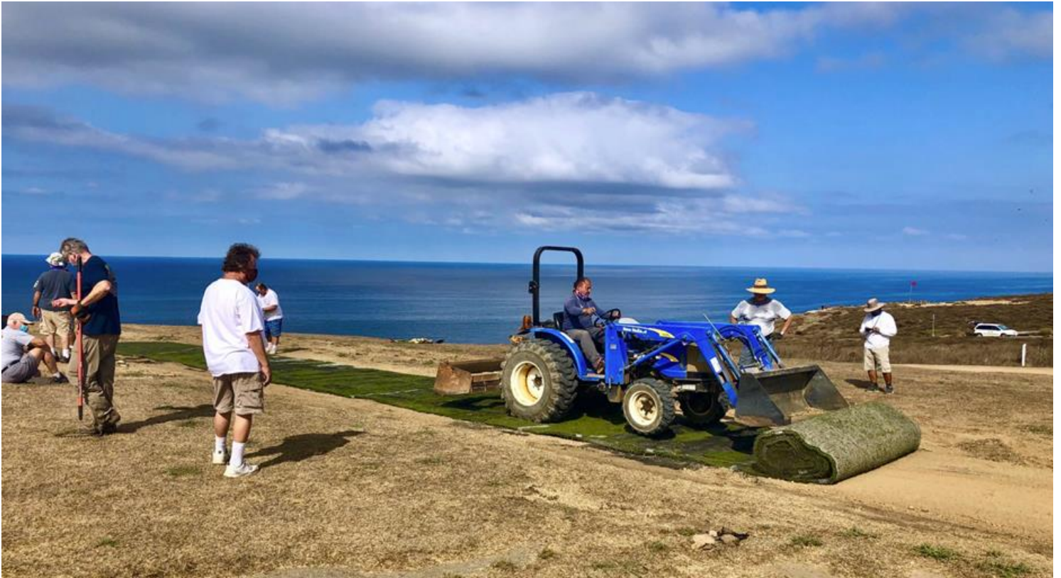
Unrolling with the infill still in the AstroTurf. Four more rolls are going here to double the width.