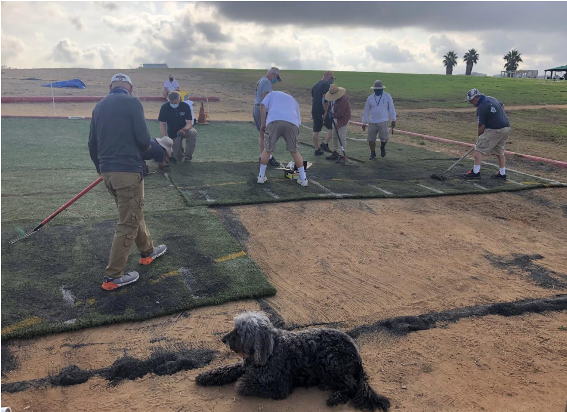
Many hands make light work.