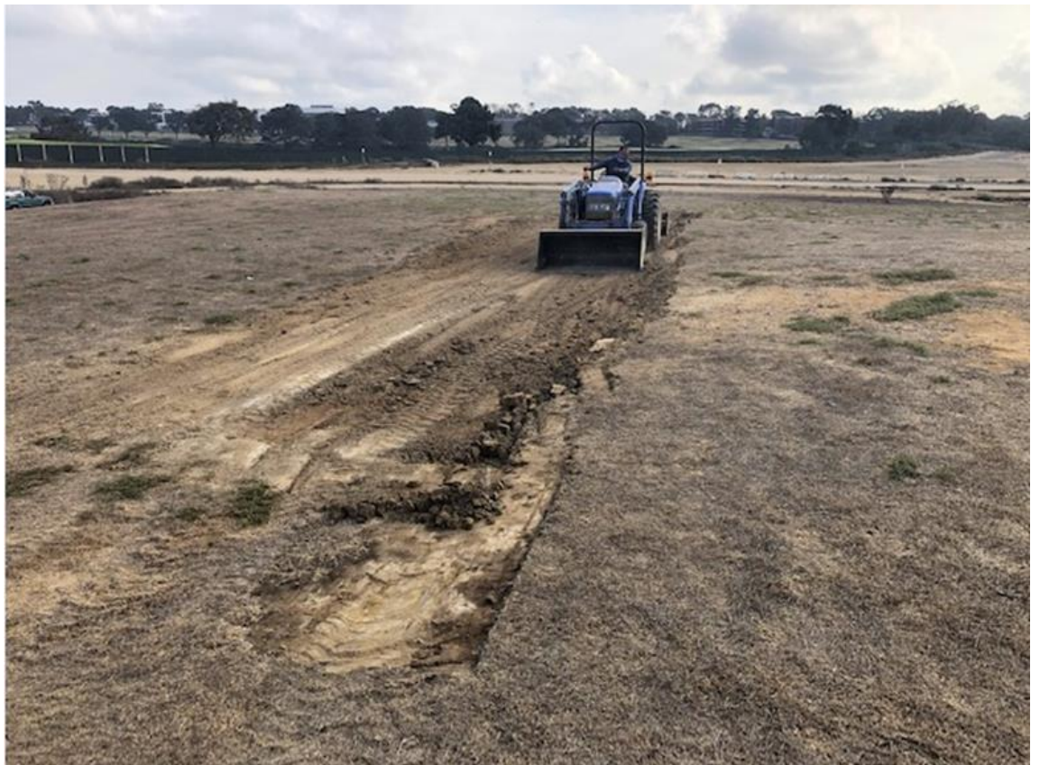
Leveling the landing strip. No more snake or gopher holes!