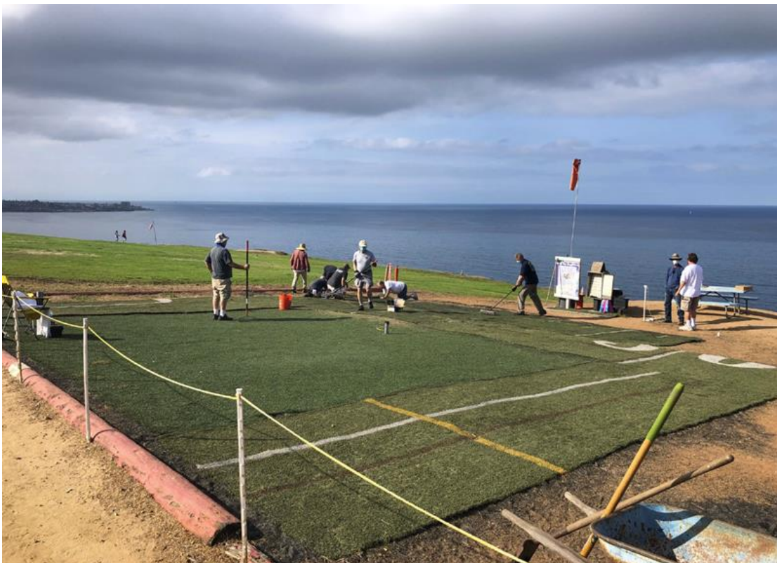
Our new mini football field. Now, we can have many more planes and more equipment without being in the dirt.