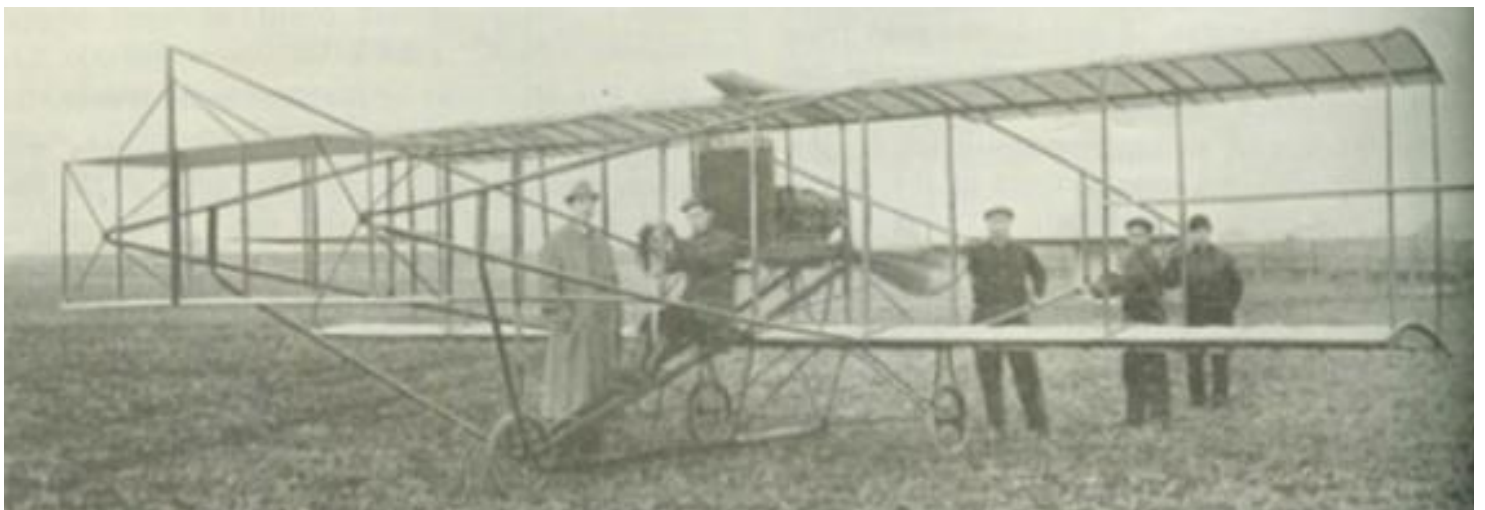
Feng Ru (pilot) in Oakland – circa 1907