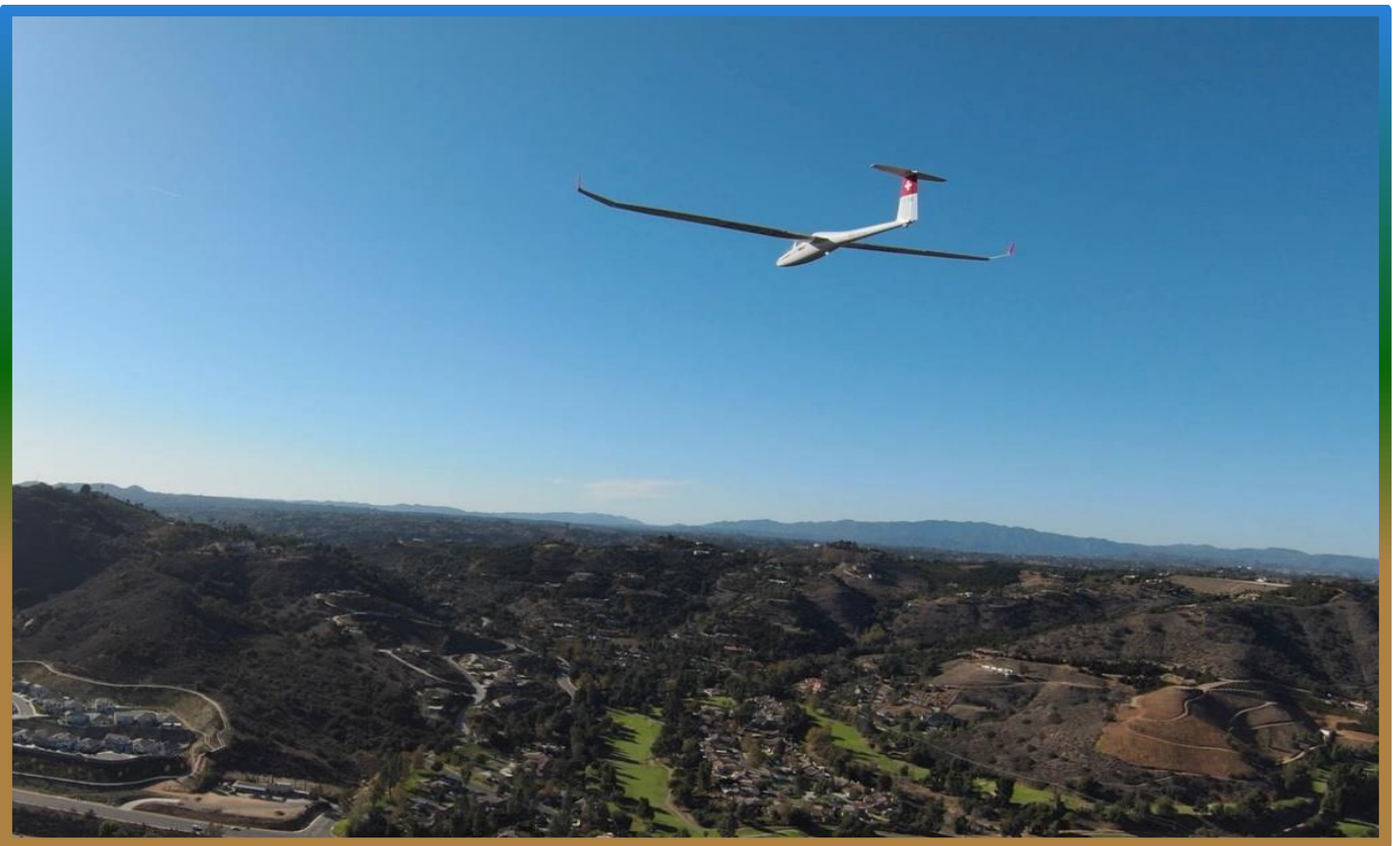
January Winner – Thomas Moller's Paritech DG-1000 at Palomar RC field

Email your photos ( JPG format and original high-resolution version, please ) to Dale Gottdank at submit@torreypinesgulls.org . Please provide your name, location of photo and photo description. Note: Photos submitted during November will be included in the 2022 Photo of the Month contest starting in January.