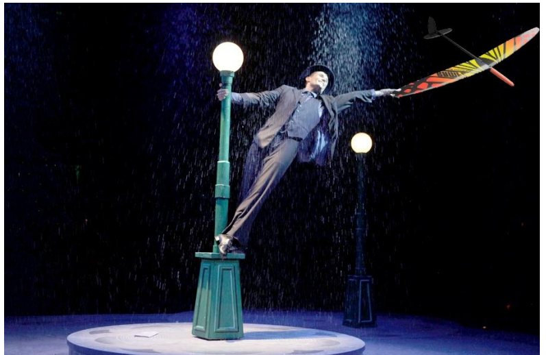
Mystery pilot launchin' and "Singin' in the Rain"