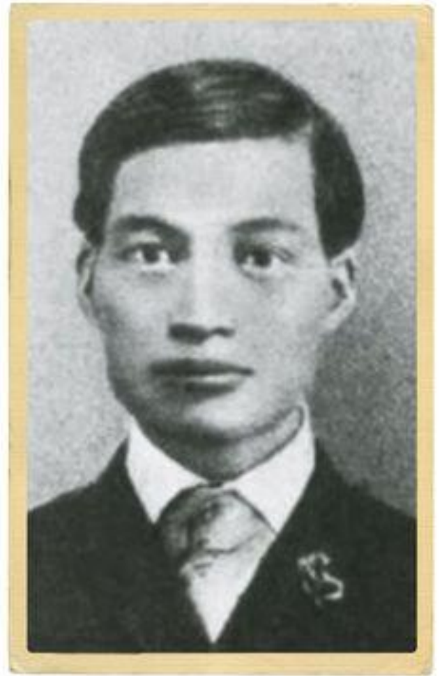
Portrait of Feng Ru

You won't want to miss this one! See you there.