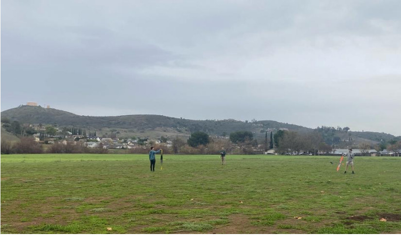
Drizzly Poway Field

The January DLG contest, scheduled for the 15 th was cancelled due to inclement weather. A few of the entrants didn't receive the cancellation notice in time, but these hardy souls decided to tough it out and get in some flying time anyway.