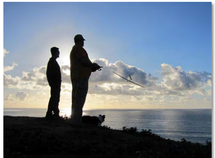
Sunset Silhouettes at Torrey (Ian Cummings)