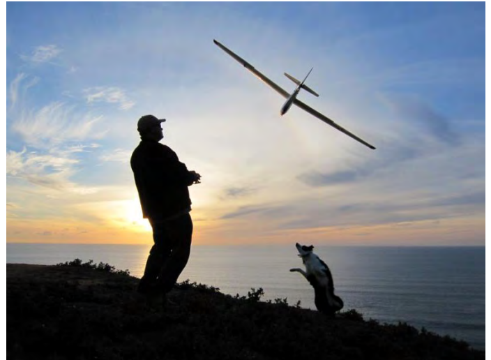
Andy Grose flyby with Shelby going airborne