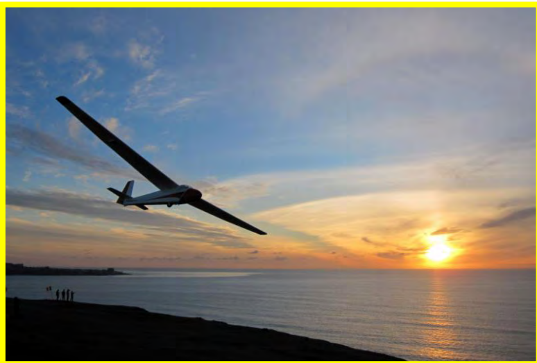
January Winner - KA-8 at Torrey Sunset