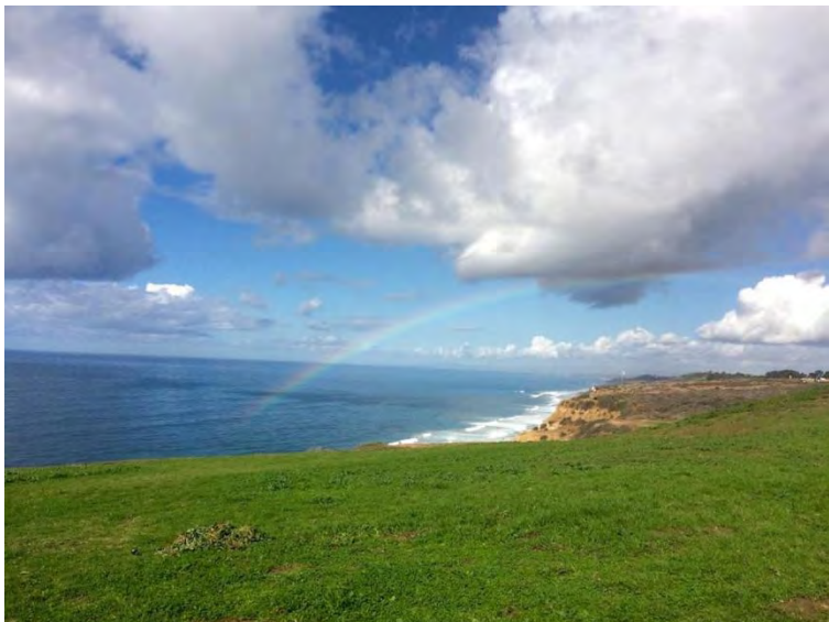
Rainbow over Torrey