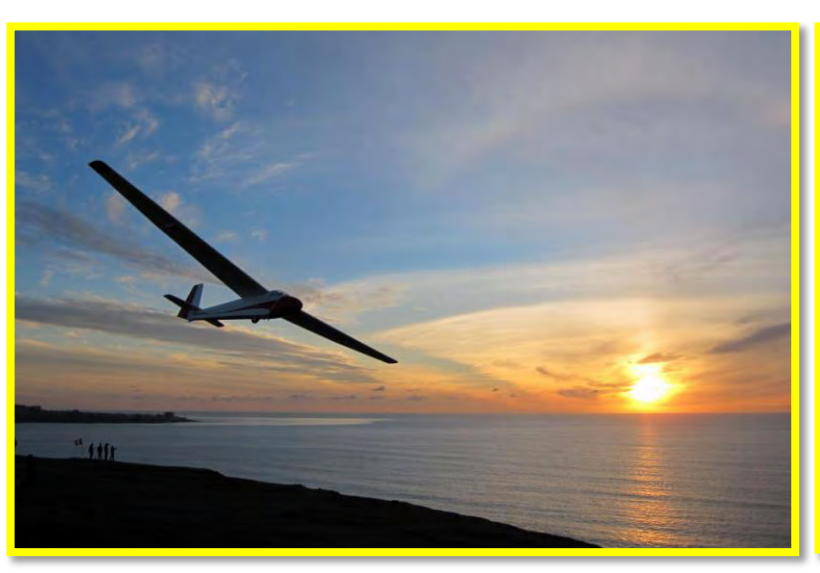
January Winner – KA-8 at Torrey Sunset