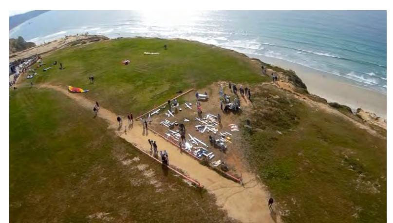
GoPro view of the RC pit area at Torrey taken during the February Fun-Fly