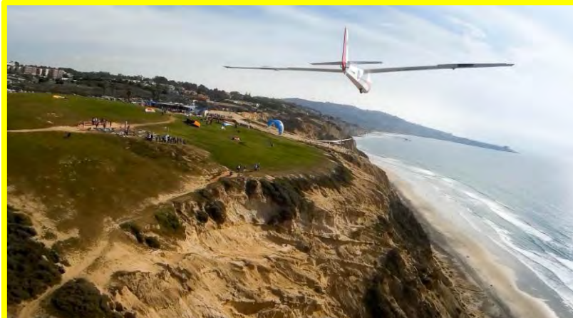
(March Winner) GoPro view trailing a Ka8 taken during the February Fun-Fly (Ian Cummings)