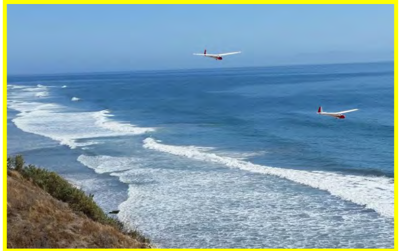
May Co-Winner – Ka-8's over Ellwood at this year's WeaselFest in Santa Barbara