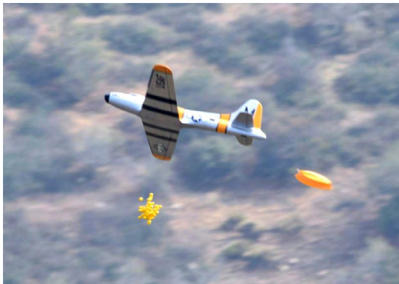
Matin Taraz's B-17 dropping lifeboat and paintballs at PSS Fest (Cajon Pass) 2015 (Greg Houck)