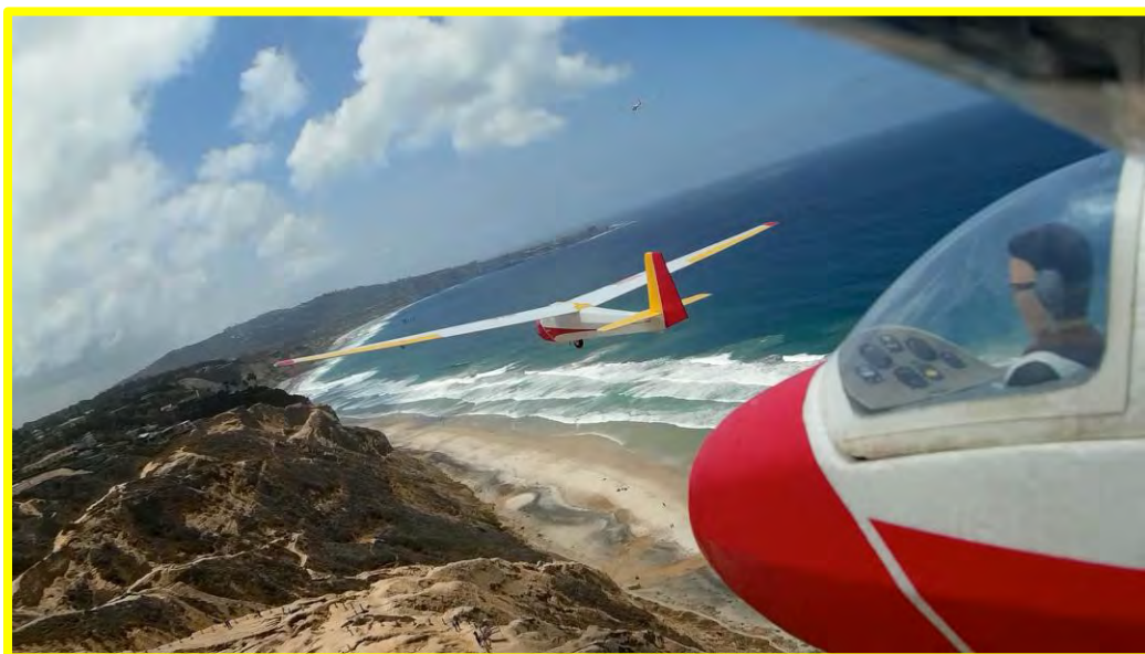
June Winner – Ka-8's flying over Torrey at the Foamy Fun Fly