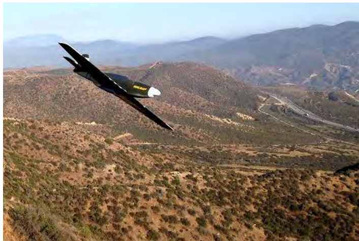
Dan Cummins' lightweight P-51 at Cajon