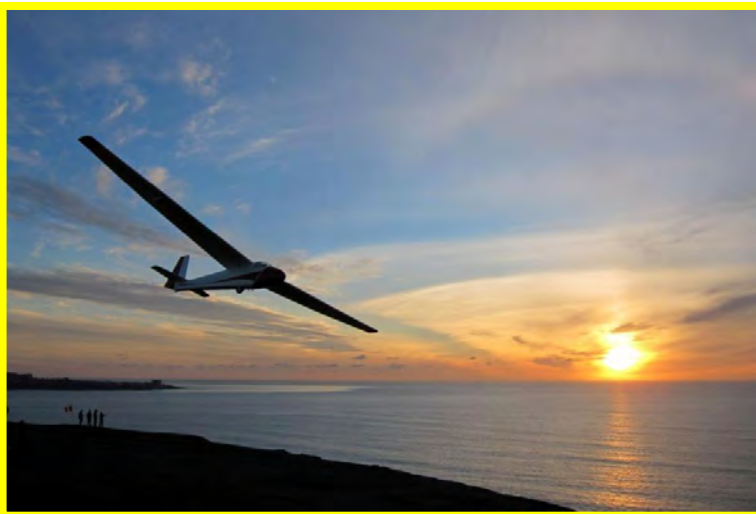
January Winner – KA-8 at Torrey Sunset