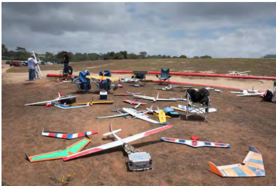
RC pit area and lots of foamy variety (Ian Cummings)