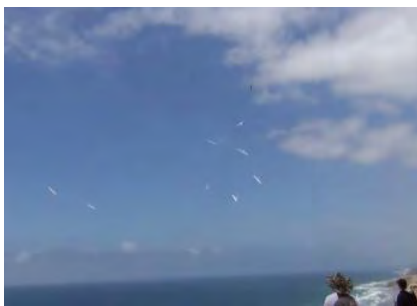
Ka-8 Foam Overcast