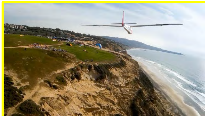
March Winner GoPro view trailing a Ka8 taken during the February Fun-Fly