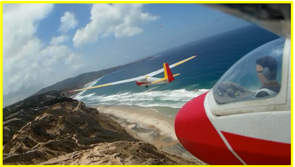
June Winner – Ka-8's flying over Torrey at the Foamy Fun Fly