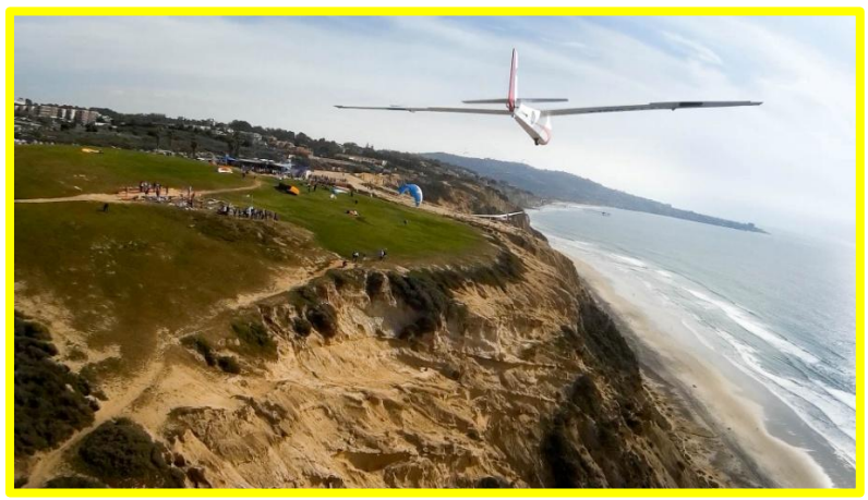
March Winner GoPro view trailing a Ka8 taken during the February Fun-Fly