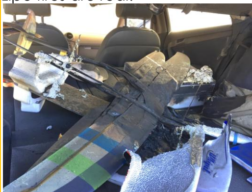
Figure 1 Photo by barry d on RCGroups.

http://www.rcgroups.com/forums/showthread.php?t=2429450&highlight=lipo