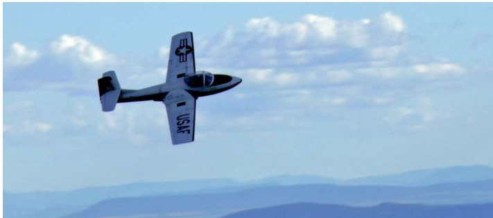
Owen Hedger's Cessna T-37 "Tweet" at the Manilla Slope Fest (Matin Taraz)