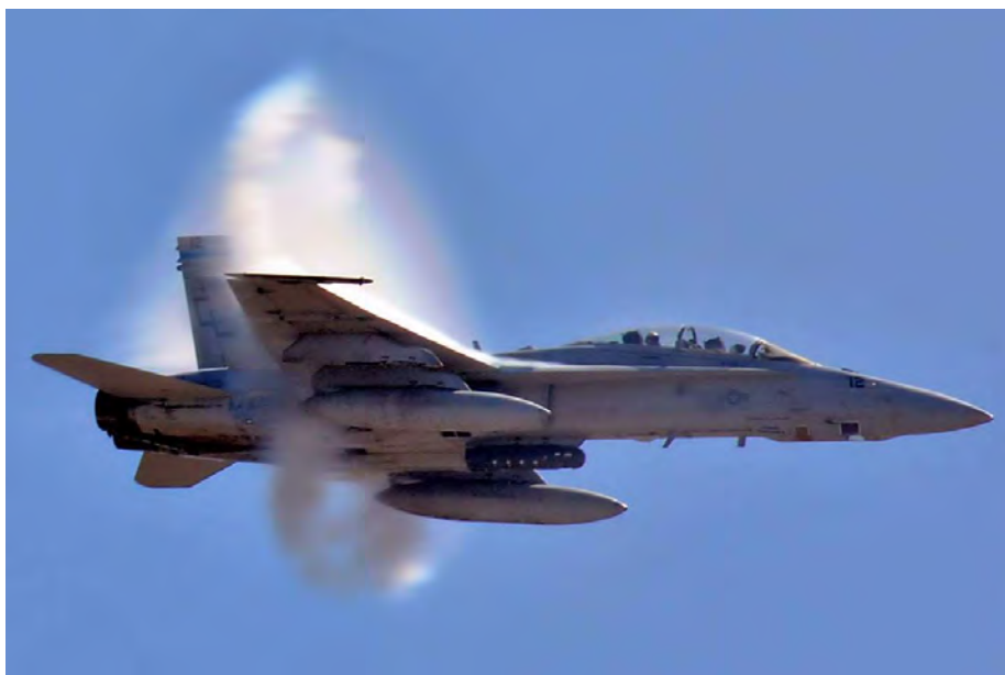
FA-18 at the Miramar Air Show (Pete Rissman)