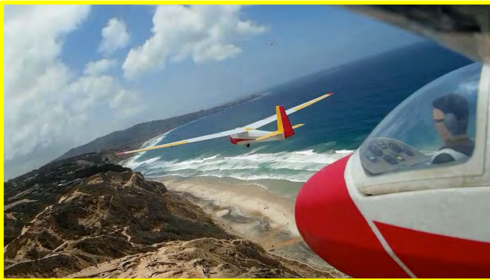
June Winner – Ka-8's flying over Torrey at the Foamy Fun Fly