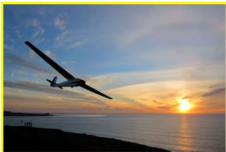
January Winner – KA-8 at Torrey Sunset