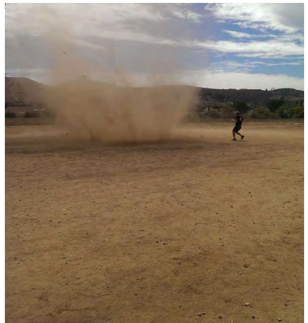
Dust devil at the Poway Field