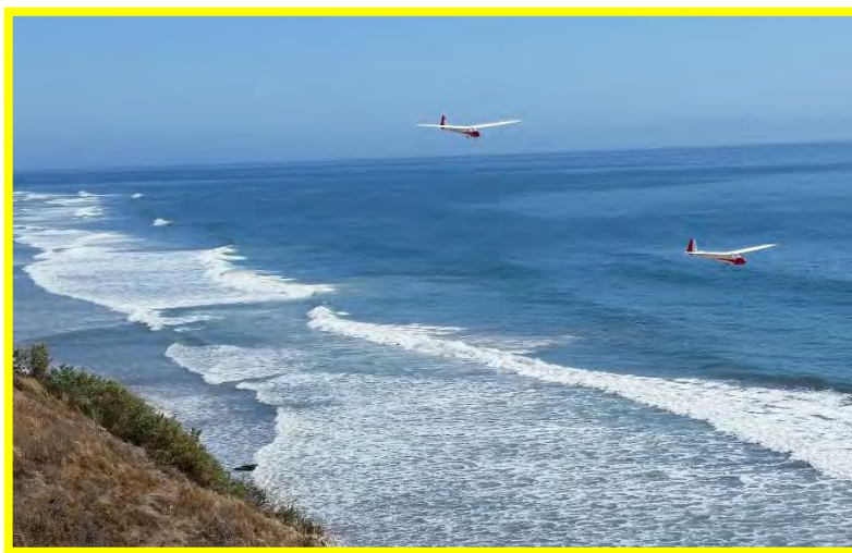
May Co-Winner – Ka-8's over Ellwood at this year's WeaselFest in Santa Barbara