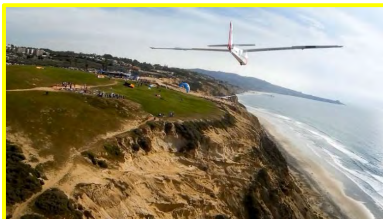
March Winner GoPro view trailing a Ka8 taken during the February Fun-Fly