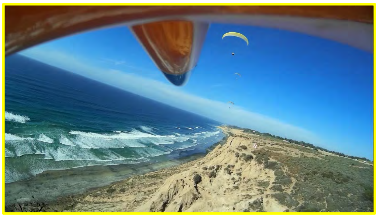
February Winner - Phil Davy's Xperience Pro Carbon 3.3 camera view flying inverted over Torrey