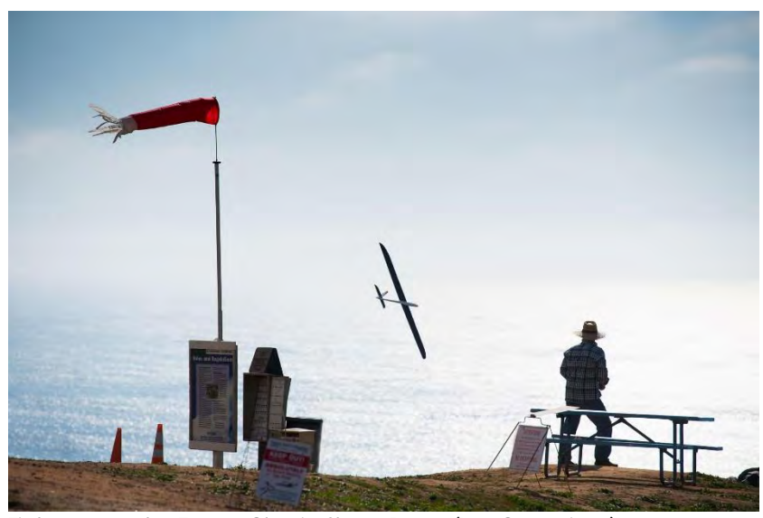
Tight turn at the Torrey Classic Slope Race (Ian Cummings)