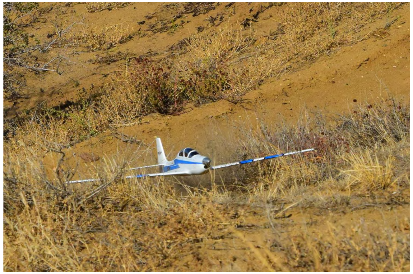
Super Tucano landing (Greg Hauck)