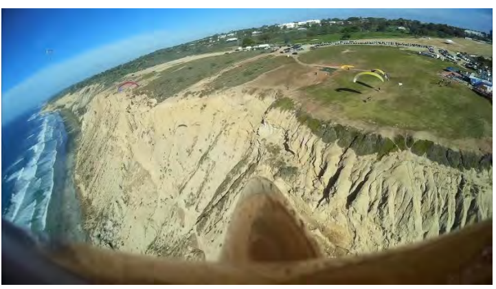
Plane mounted camera view from Phil Davy's Xperience Pro Carbon 3.3 at Torrey