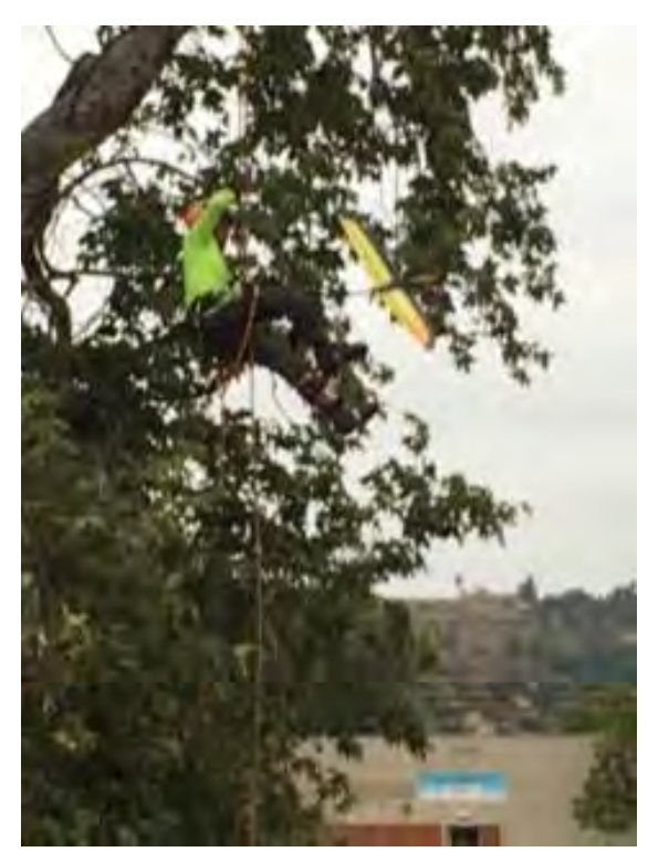
The joy of DLG (Cliff Hunter)