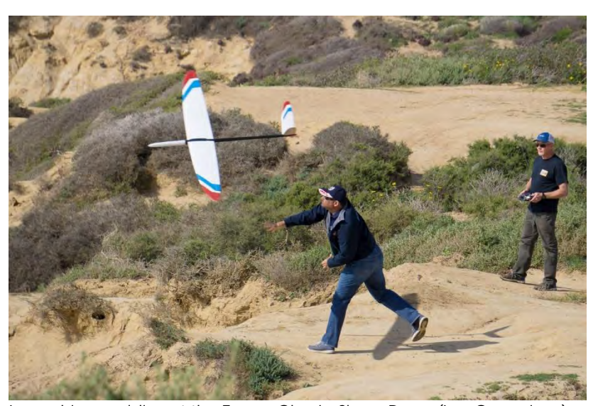
Launching moldies at the Torrey Classic Slope Race (Ian Cummings)