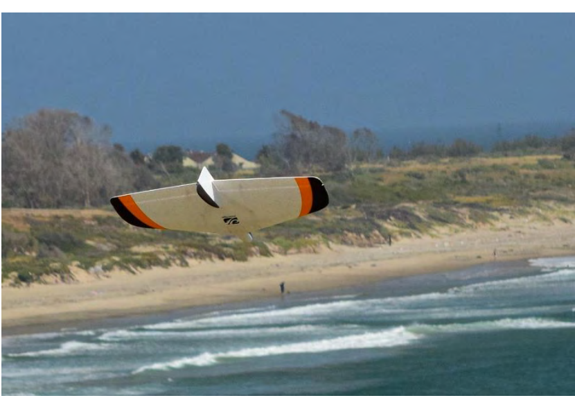
WeaselFest (Greg Houck)