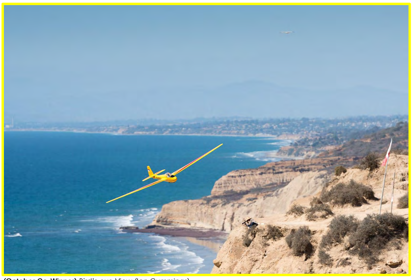
(October Co-Winner) Bird's-eye View (Ian Cummings)