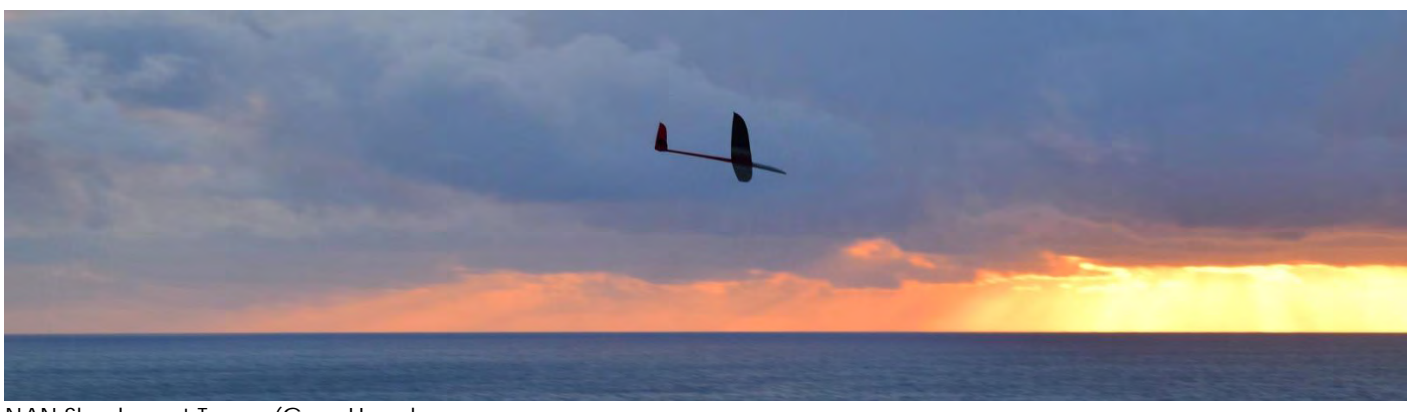
NAN Shadow at Torrey