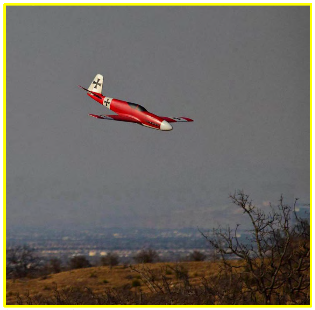
(September Winner) Greg Houck's Heinkel at FakeFest 2016 (Dan Cummins)