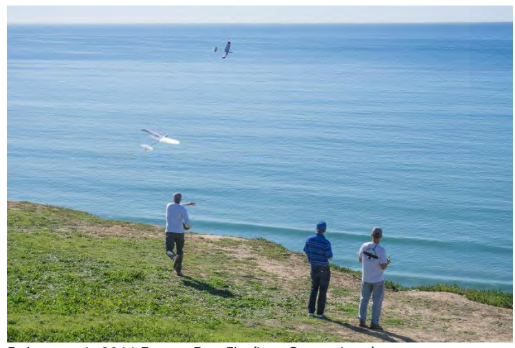
February 6, 2016 Torrey Fun Fly (lan Cummings)