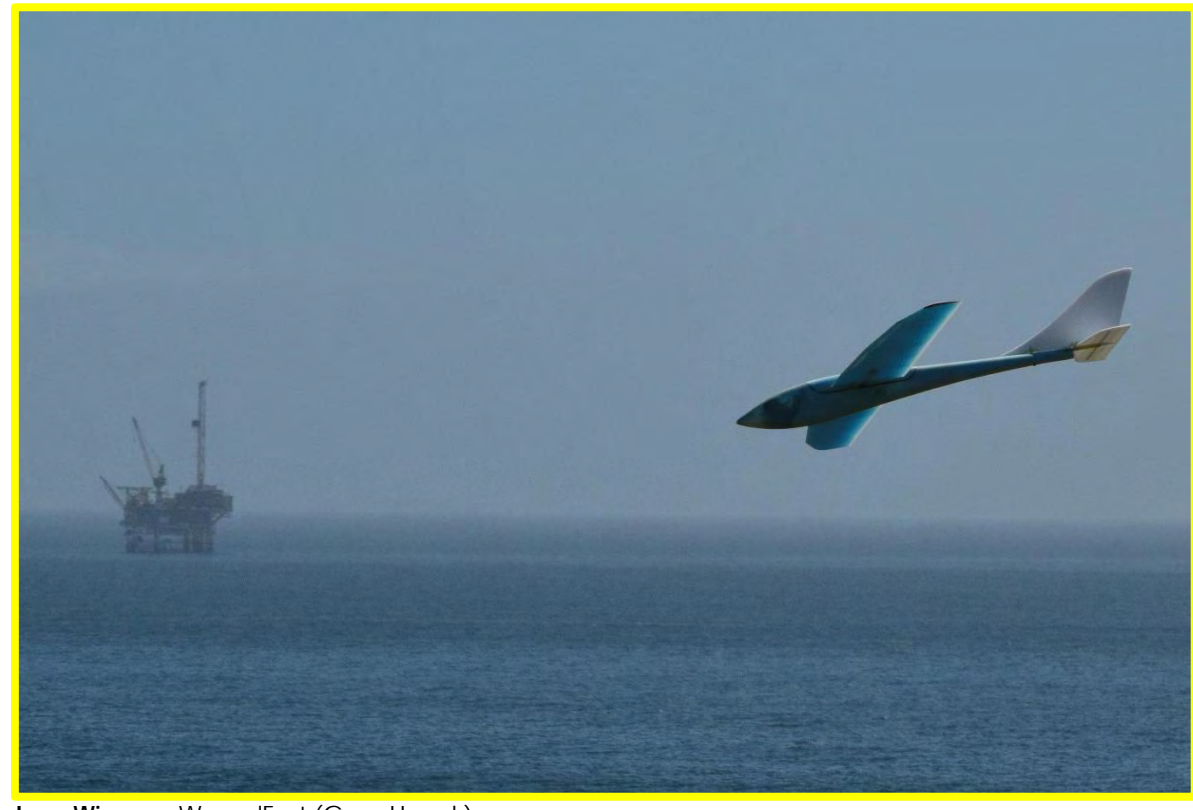
June Winner - WeaselFest (Greg Houck)