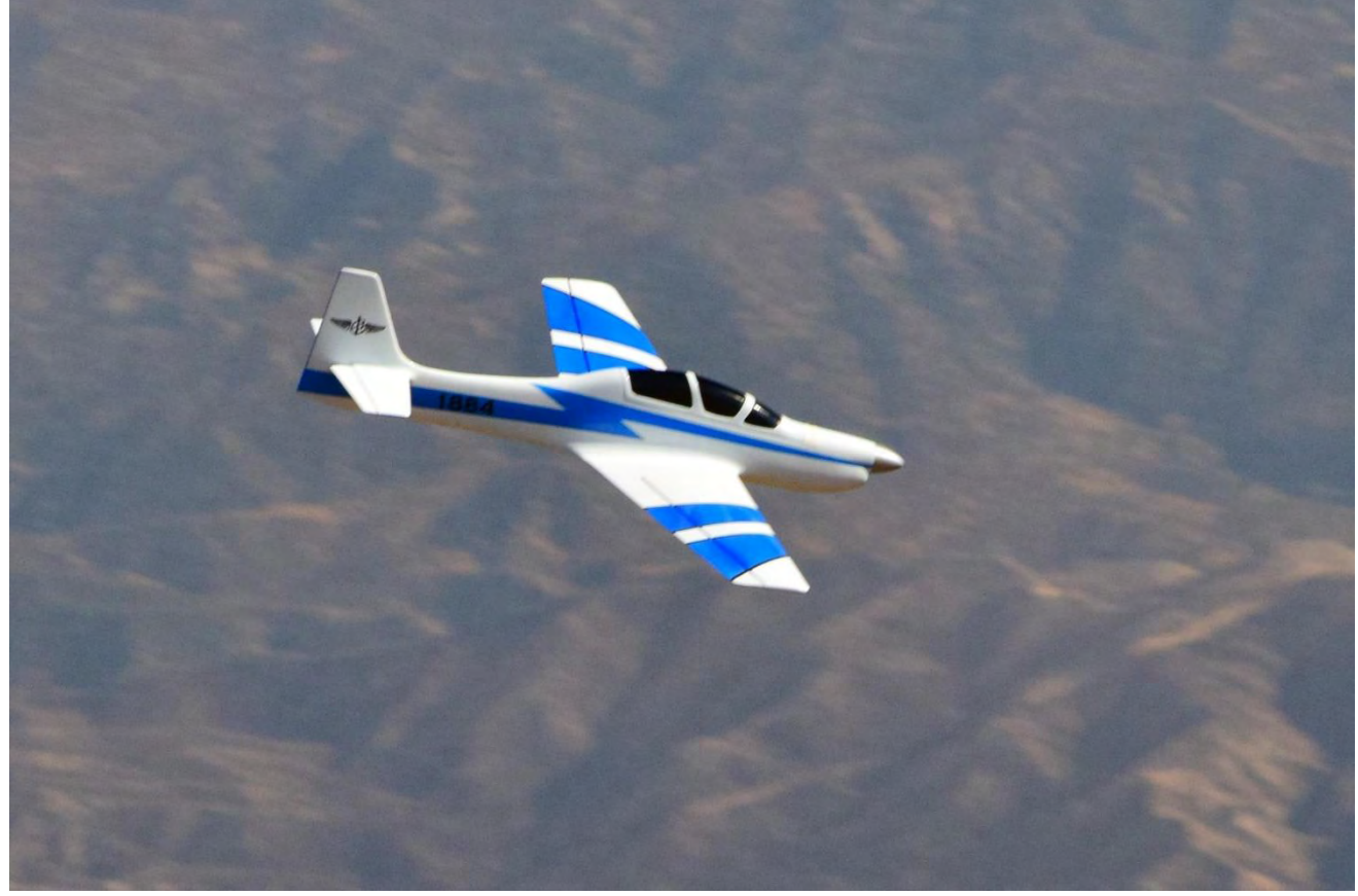
Super Tucano over Cajon