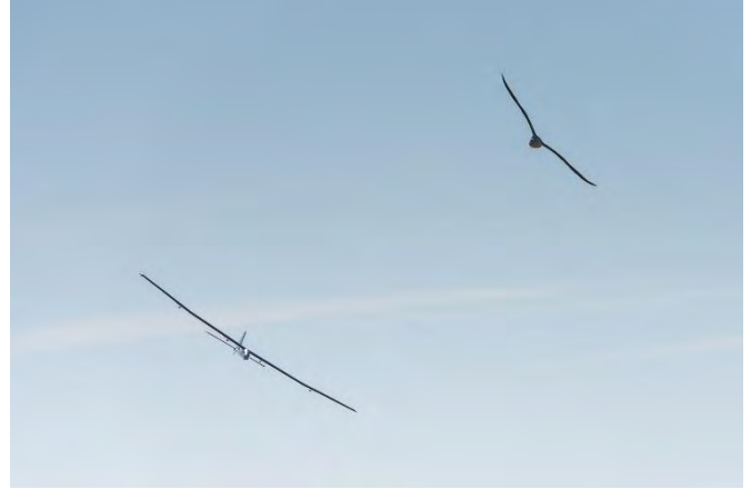
Kat's Spirit Elite with seagull at Torrey (Ian Cummings)