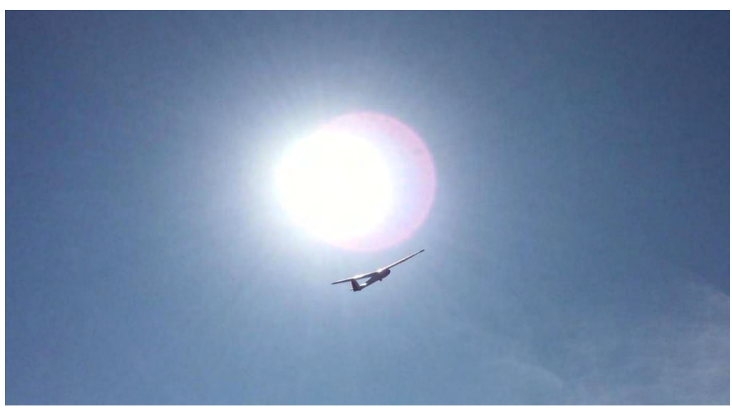
Screenshot – Ka-8 DS'ing at Bill's Hill (Phil Davy)