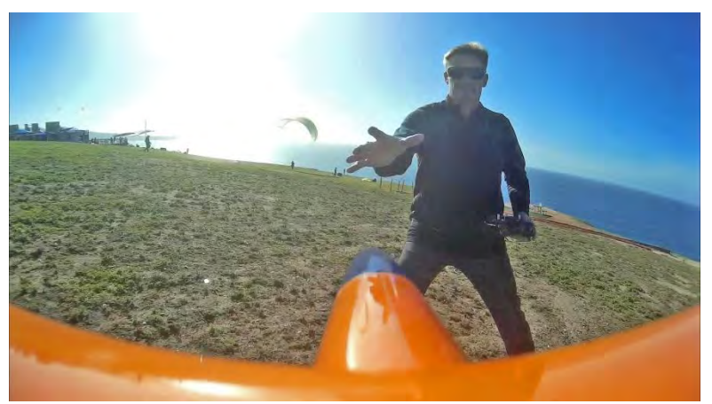
Come to papa!