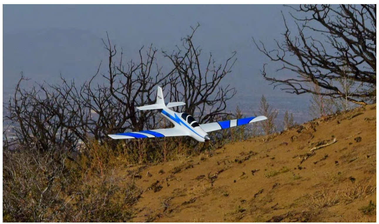
Super Tucano landing approach at Cajon (Greg Hauck)