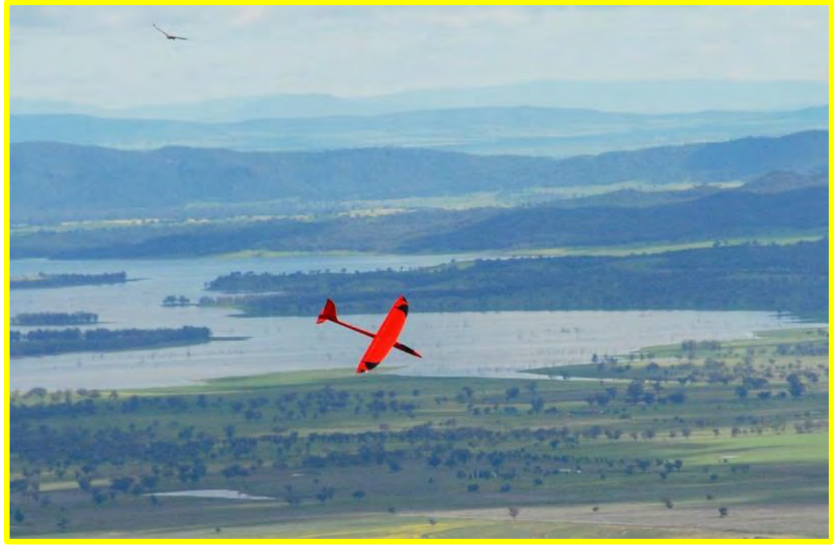
(October Co-Winner) Slopers Down Under (Matin Taraz)