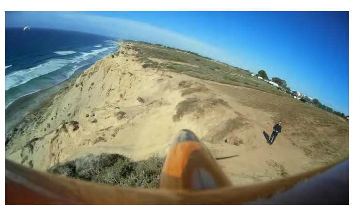
Camera catches Phil flying the Xperience