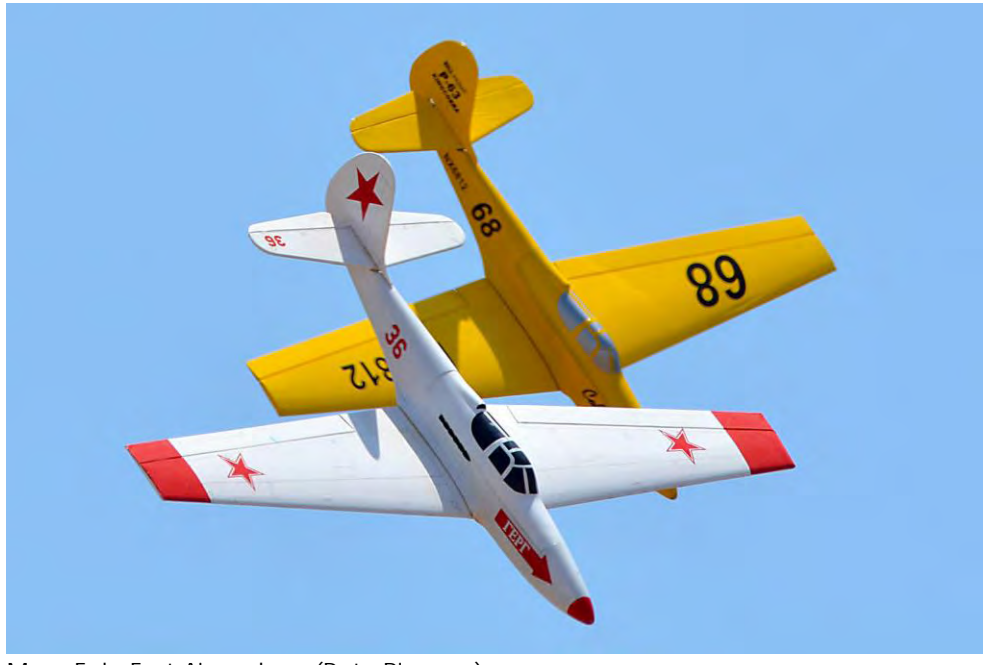
More FakeFest Airacobras (Pete Rissman)