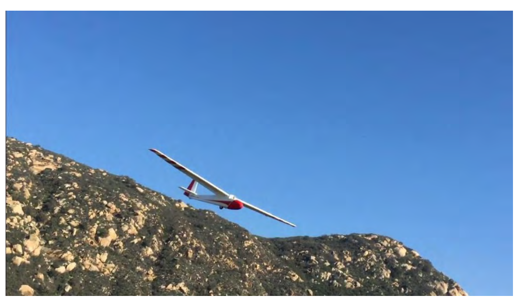
Screenshot – Ka-8 DS'ing at Bill's Hill (Phil Davy)