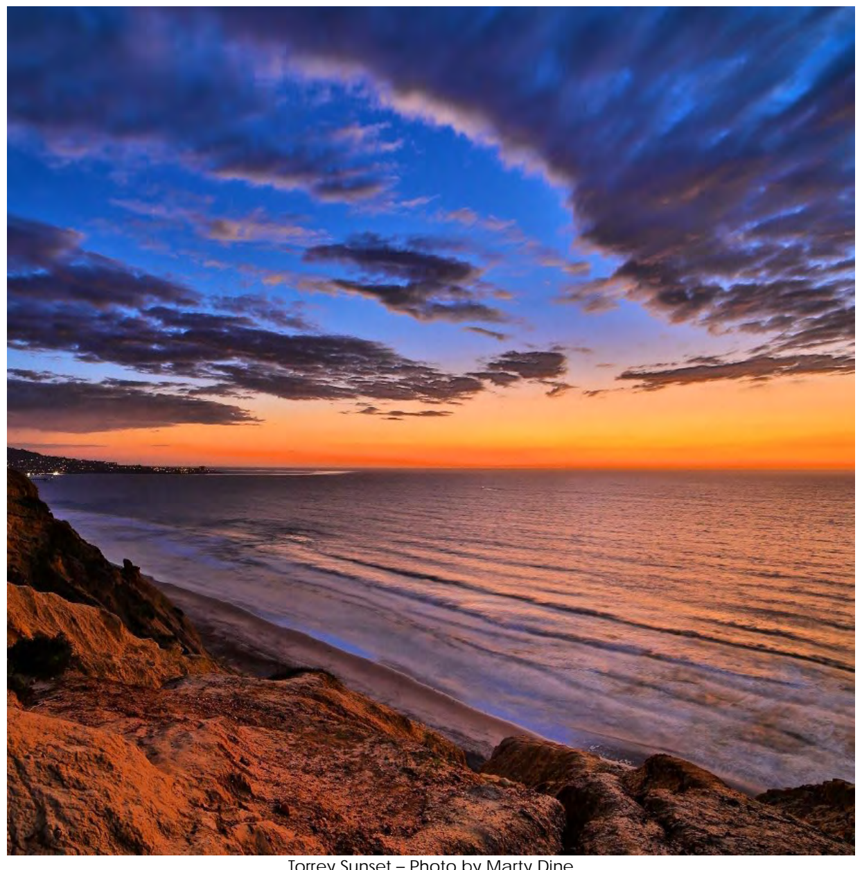
Torrey Sunset

"How did it get so late so soon?" ~Dr. Seuss