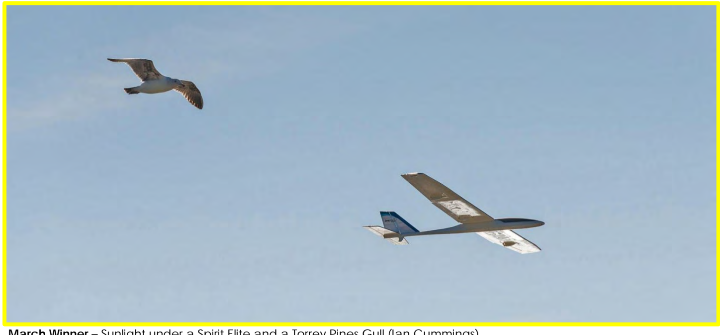
March Winner – Sunlight under a Spirit Elite and a Torrey Pines Gull