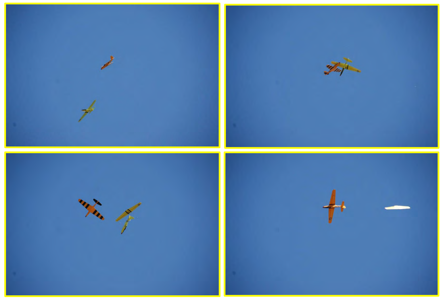
July Winner – Nice sequence showing Airacobra mid-air at the 2016 FakeFest