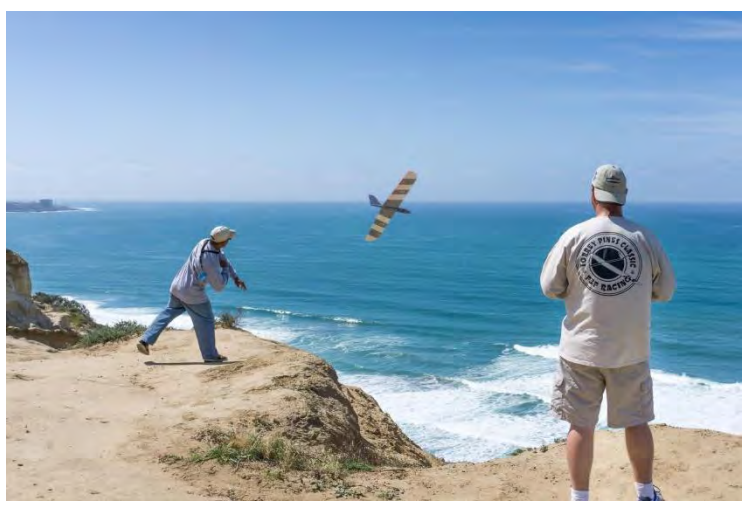
Launching foamies at the Torrey Classic Slope Race (Ian Cummings