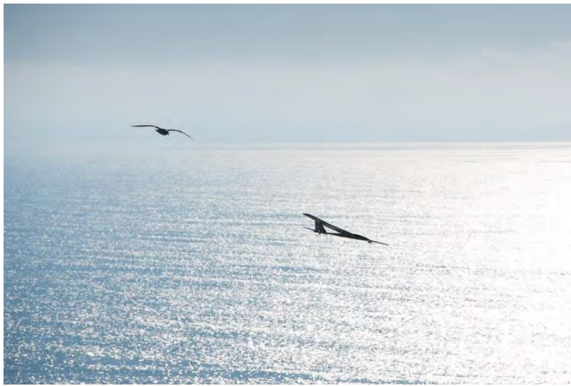
Kat's Spirit Elite with seagull in pursuit at Torrey