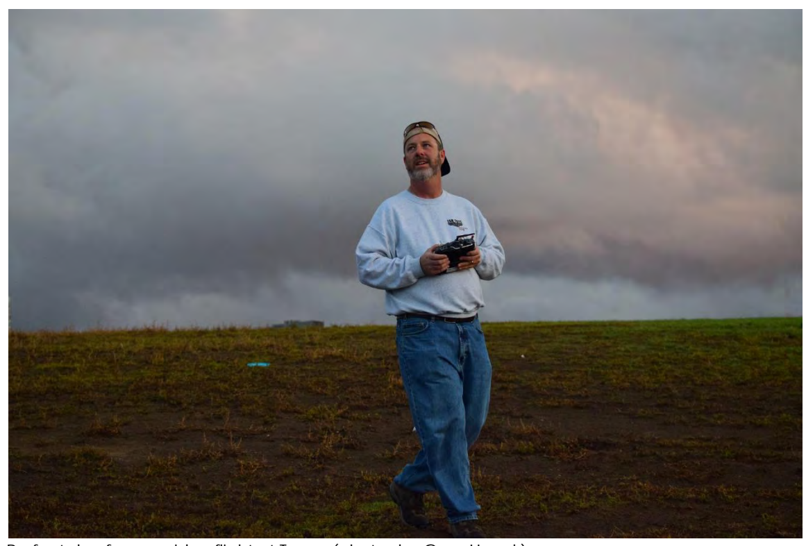
Perfect day for a maiden flight at Torrey