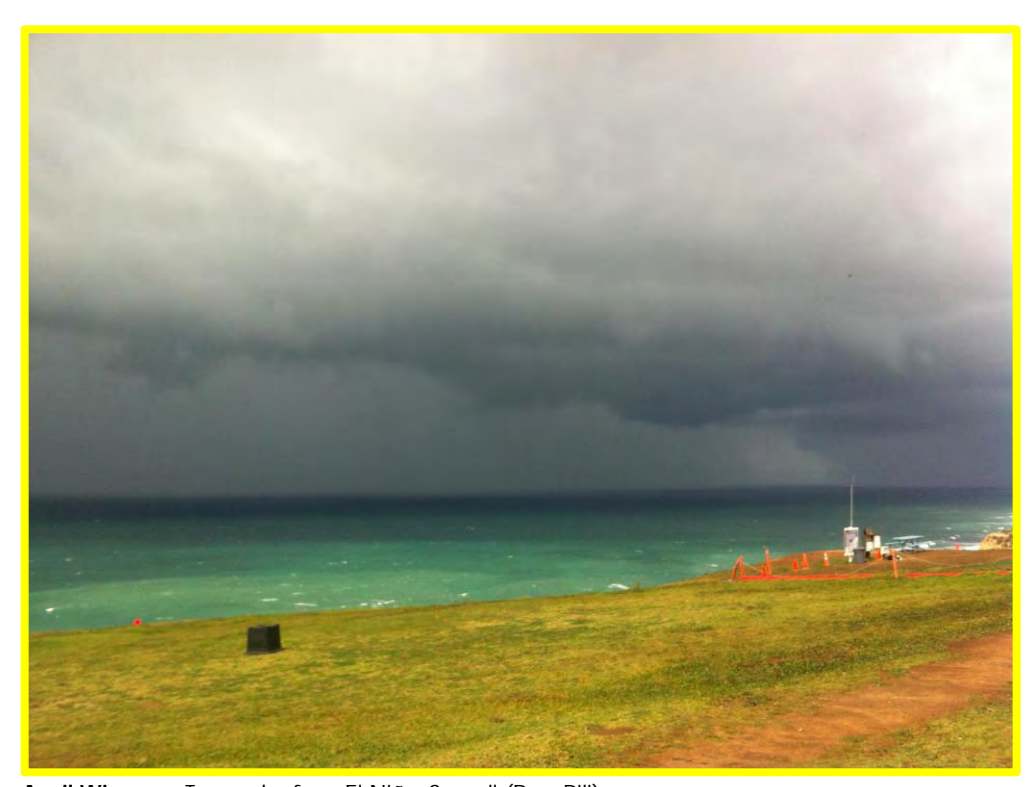
April Winner – Torrey before El Niño Squall