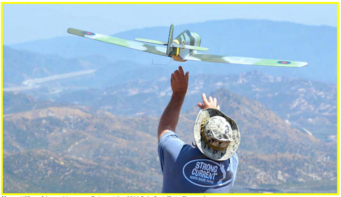
(August Winner) Launching over Cajon at the 2016 FakeFest