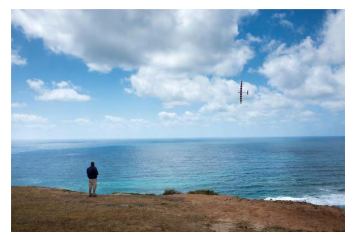
Ian Cummings – Marty Dine Flying the Bluff at Torrey - June Contest