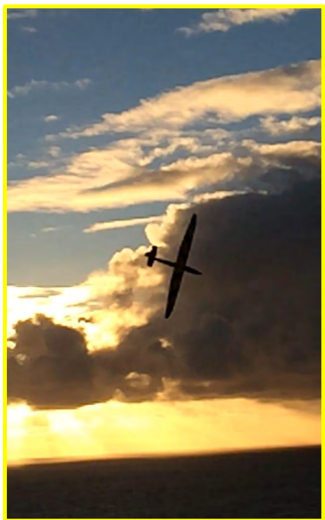
April Winner (Scott Condon) - 1/3 Scale L-213 at Torrey