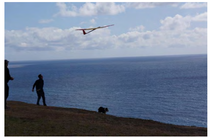
Watch that up elevator!