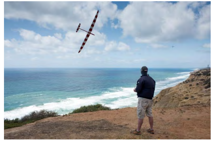
Ian Cummings – Marty Dine Flying the Bluff at Torrey -June Contest