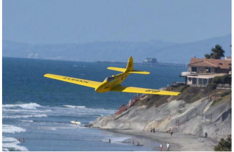
November Contest (Greg Houck) Jim Scott's Lightweight Cobra on a pass over Dave's Beach