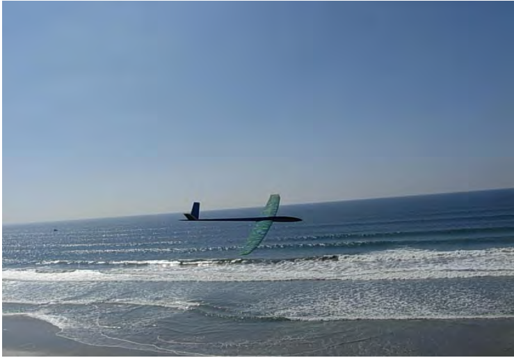
November Contest (Oran Bloodsworth) Scepter Re-Maiden over Dave's Beach