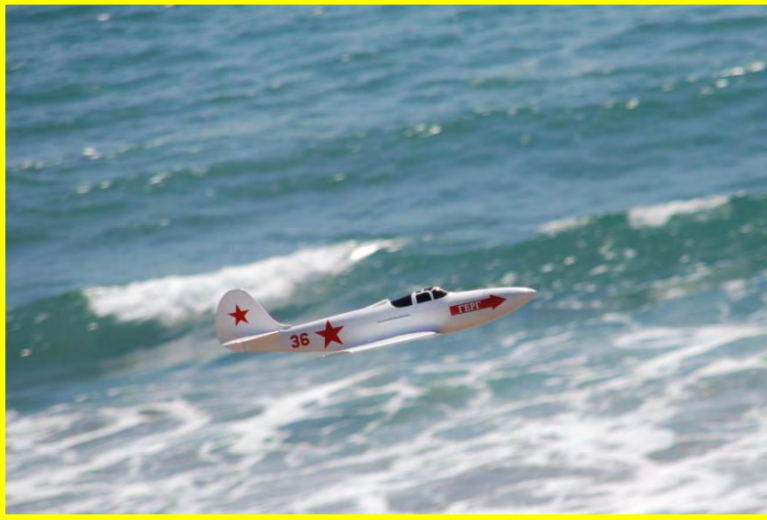
July Winner (Matin Taraz) Greg Houck's One Day Build P-39 Maiden at Dave's Beach