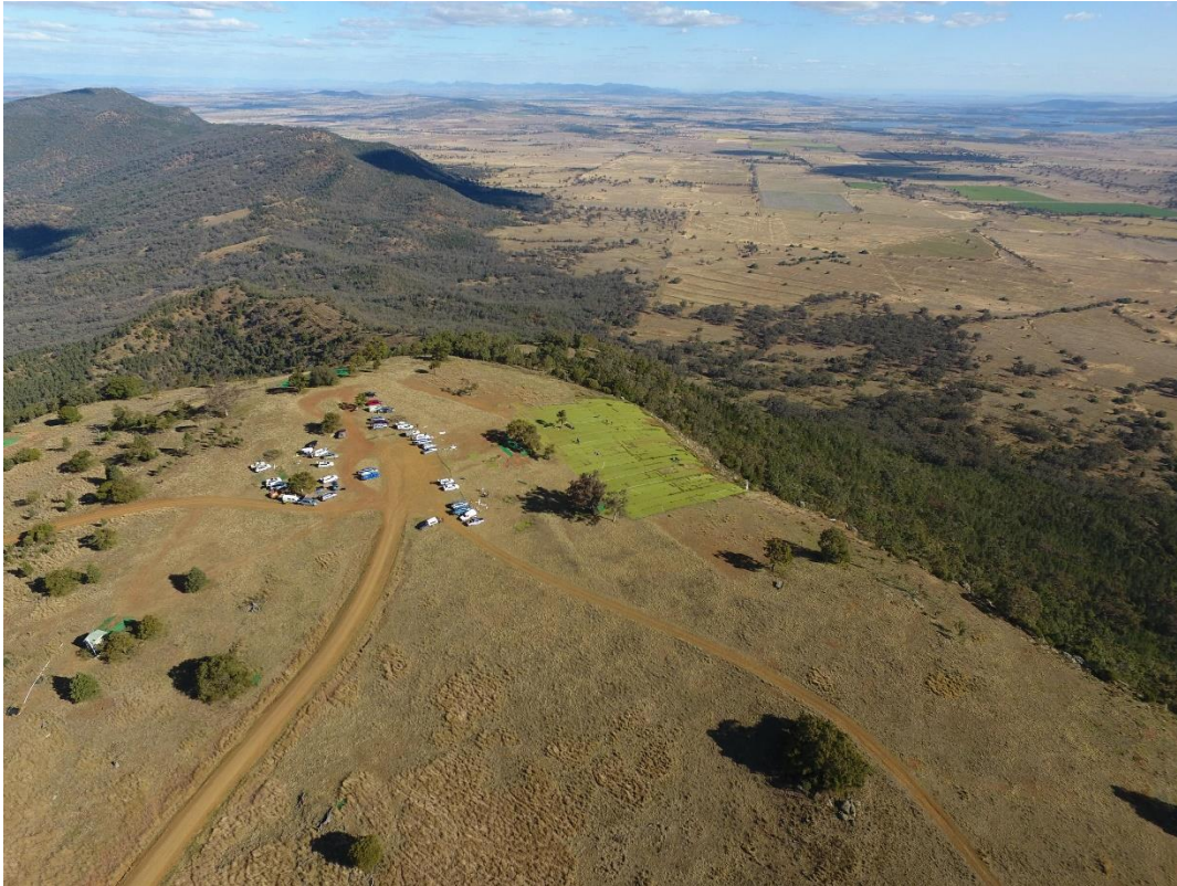
Aerial view of the Manilla flying site