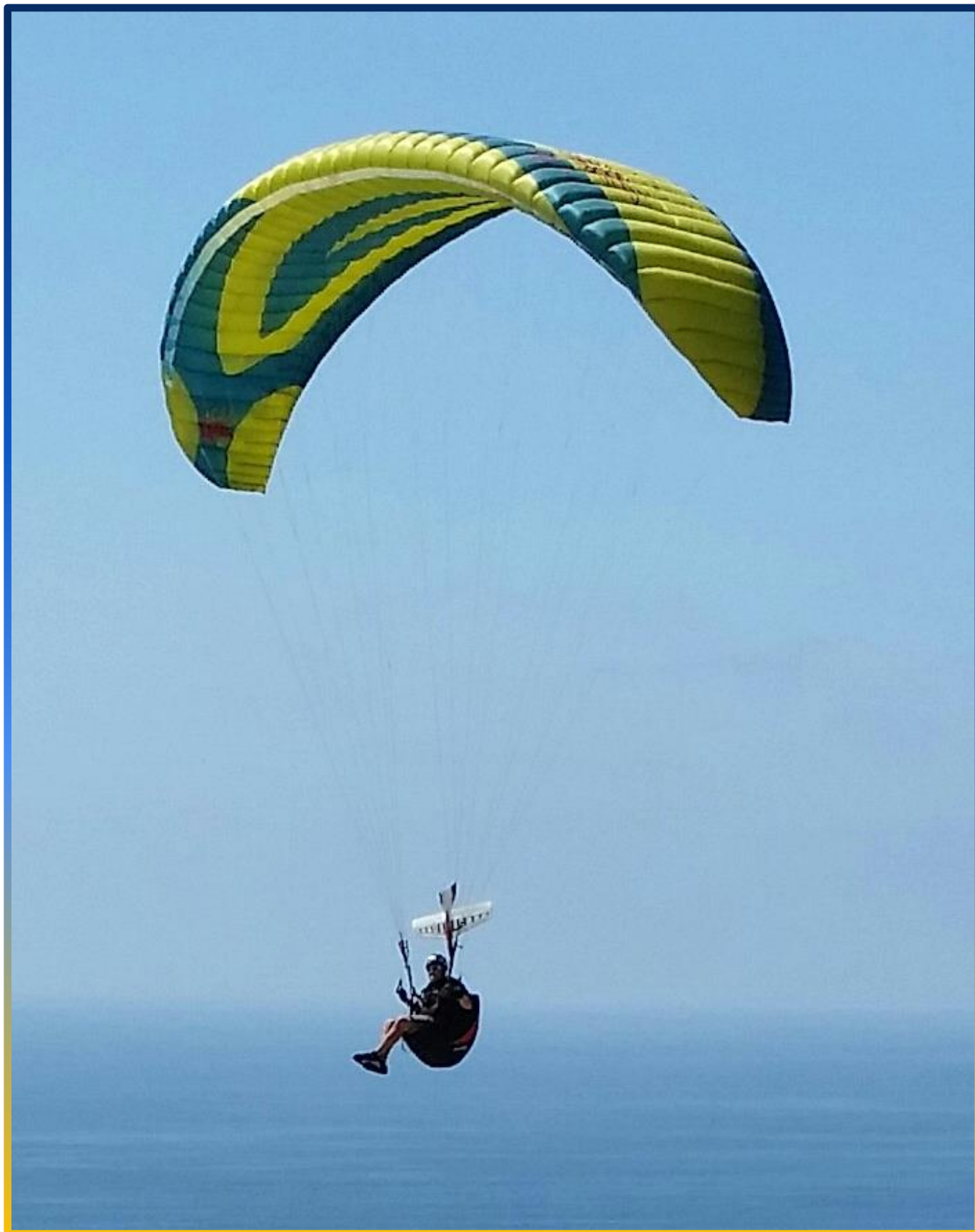
September Winner – Glider meets jelly during the PNF TWF in July