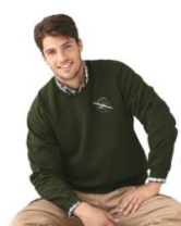
Product ID: A312-237-3942 Digitally Printed Gildan Ringpun Crew Sweatshirt