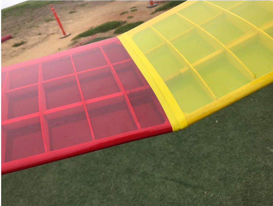
Detail showing the wing center panel-to-wing tip joint

Gary modified his plane for travel. The red wing tips are removable, as are the fin and horizontal stabilizer.