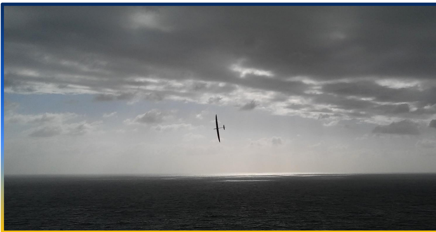
Summer Winner – Nyx over Torrey