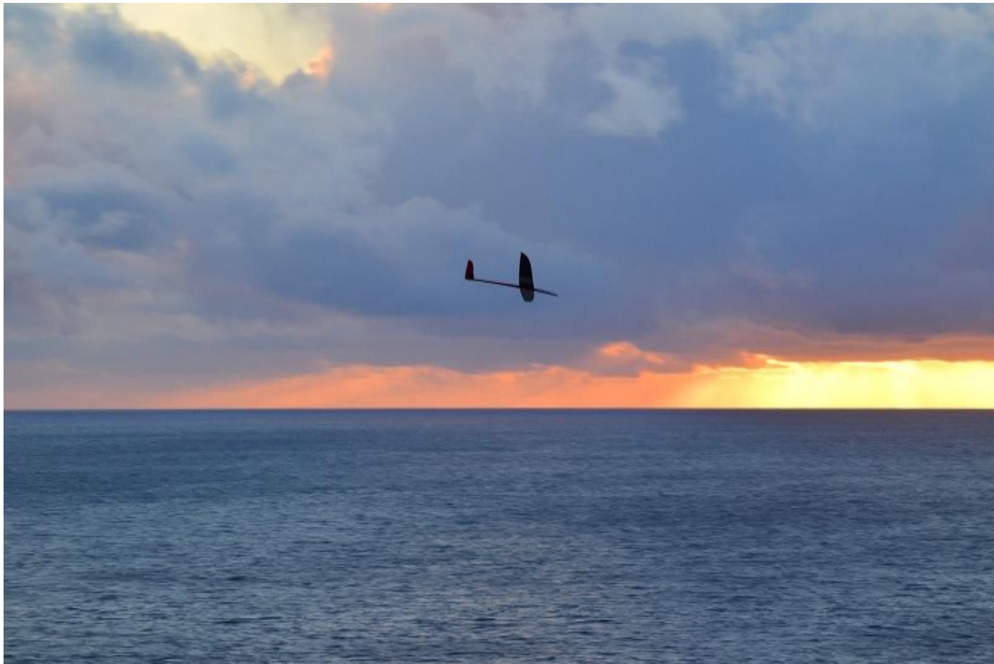
NAN Shadow at Torrey