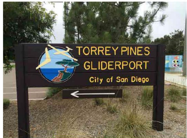
This way to the Torrey Pines Gliderport!

Very quickly, the Pike got below the cliff level and I ended up scratching. At some point, I realized the wind was too cross and knew I was going to the beach.