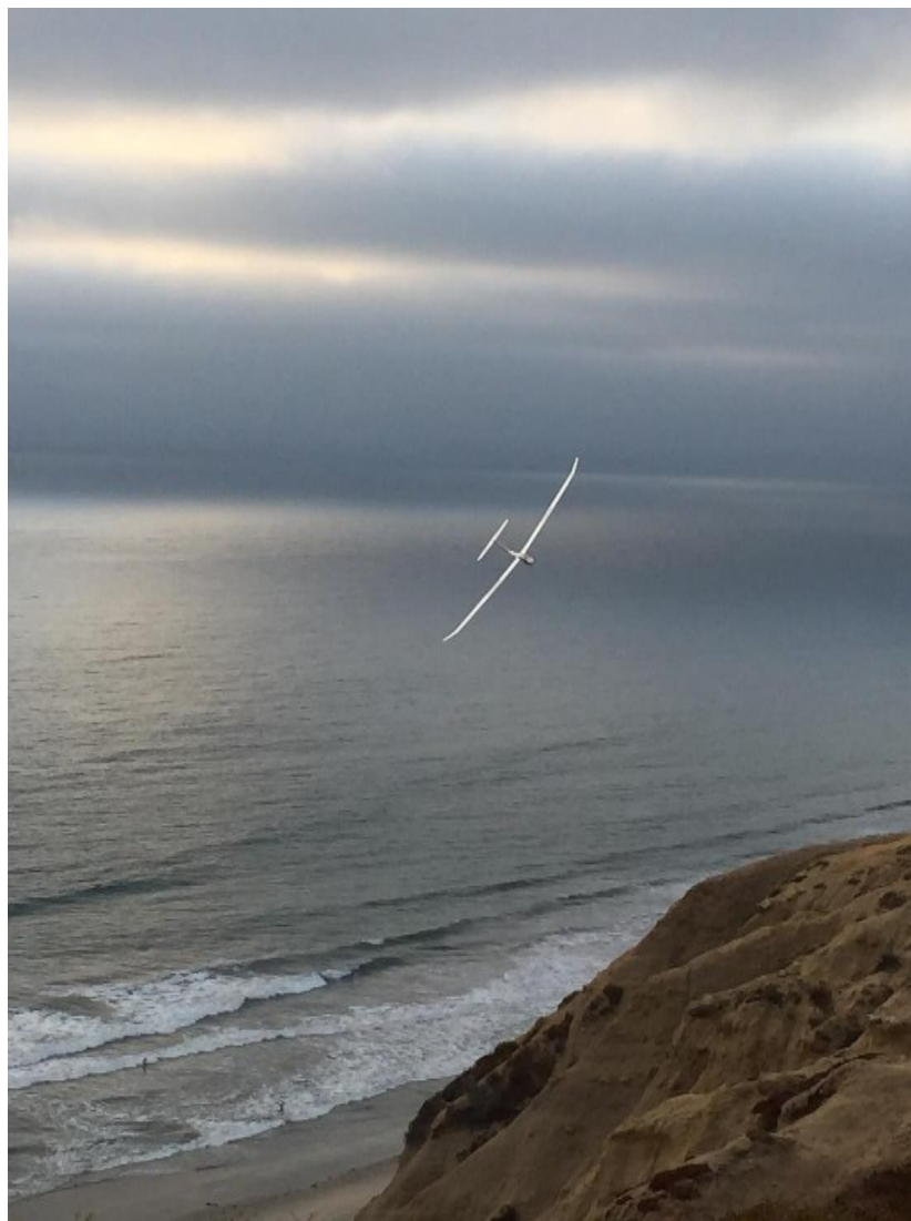
Scale flying over Torrey