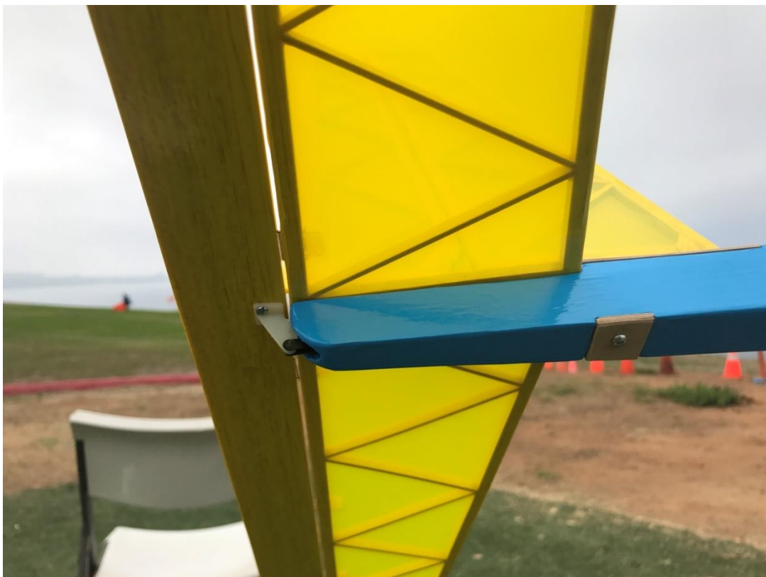
Detail at the underside of the tail showing the through-bolt connection for the fin