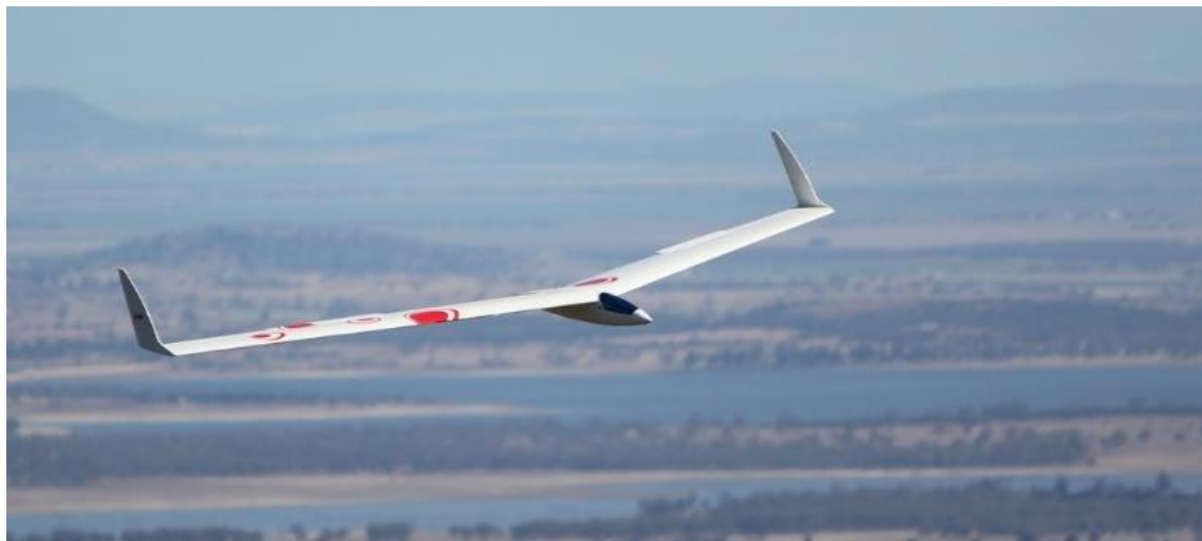
Flying wing over Manilla, New South Wales, Australia during Martin Taraz's annual pilgrimage