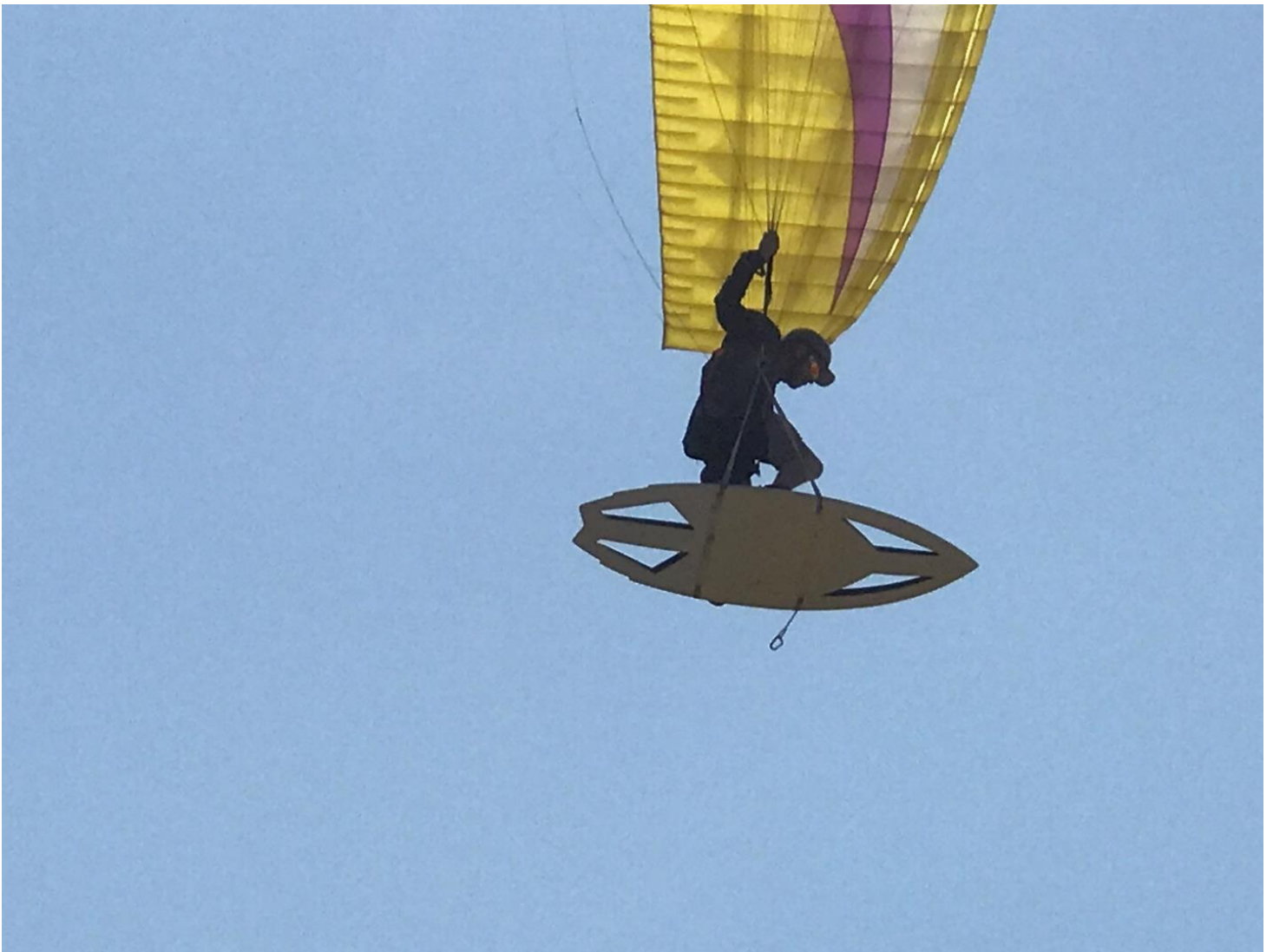
Spotted at Torrey, a flying surfboard

The Torrey Pines Soaring Council is planning to meet at the Gliderport, 6 pm, Monday, October 16 th . Attendance has been sparse and meetings have not had a quorum. Regardless, if you're interested in participating or have ideas to improve the conditions at Torrey, contact me at tpgslope@gmail.com and I'll keep you apprised of the meeting.