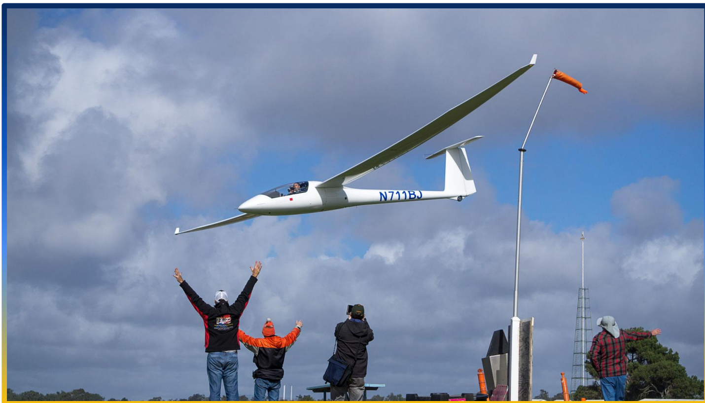
February Winner – Full-scale Stemme S-10 flyby at Torrey