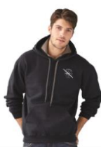
Product ID: A382-537-7660 Digitally Printed Gildan Hooded Sweatshirt