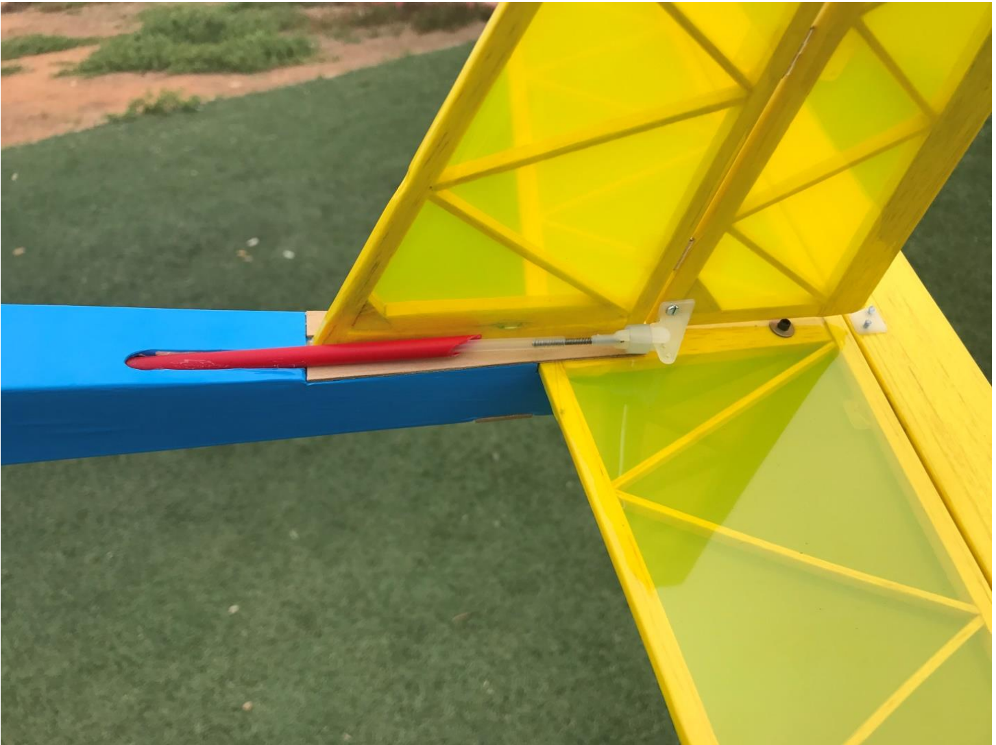
Detail of the empennage, showing the fin, rudder and horizontal stab, all removable for travel.

Fall and winter is desert season. Shoot me an email at tpgslope@gmail.com if you're interested in a Goal and Return desert run. I need to complete a 1 km goal and return.