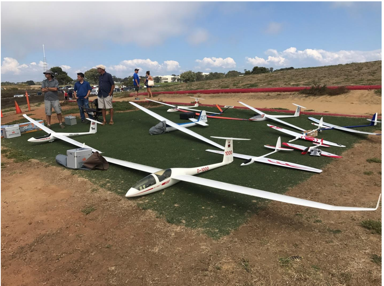
Veep Ian, UCSD Dan and a spectator in a Field of Sailplanes