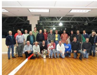
TPG Members 2012 Christmas Party