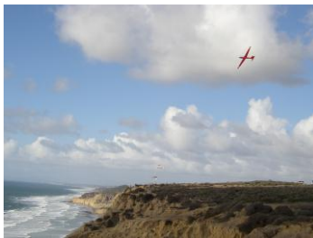
Torrey Pines San Diego, CA

* February 16th TP Glider Port Ratings/Fun Fly day. We'll be having a get together like last year and it's a great opportunity to take care of the paperwork, get a pilot rating, and get in some fun flying. Probably even enjoy some great food. We'll have more details coming so stay tuned by coming to the January TPG meeting or check out one of these sites: http://groups.yahoo.com/group/TPGulls/ or http://www.rcgroups.com/torrey-pines-gulls-672/