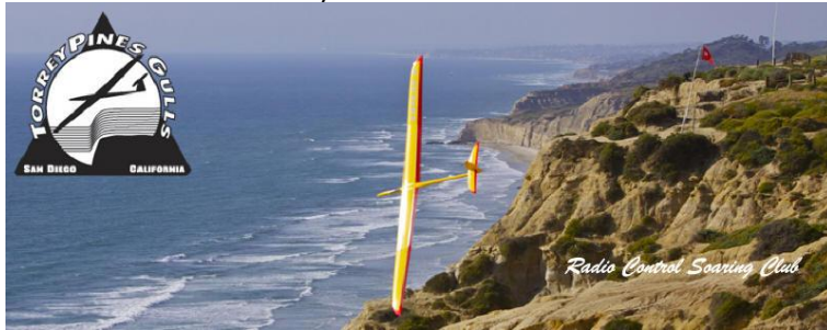
Torrey Pine Glider Port