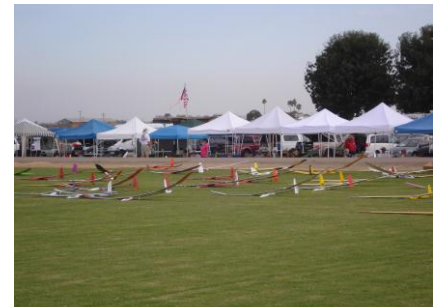
Visalia 2012- 2 day contest