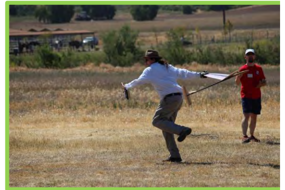
Check out the Launch IHGF 2013