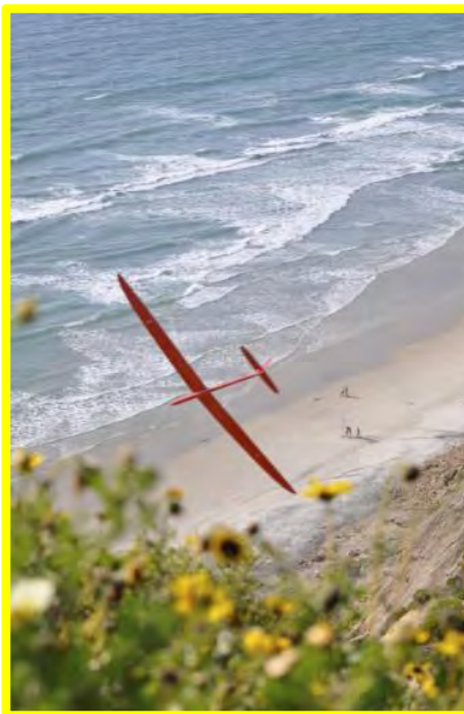
Torrey Pines 2013