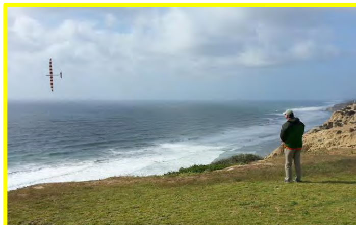
Marty Dine @ Torrey Pines 2013