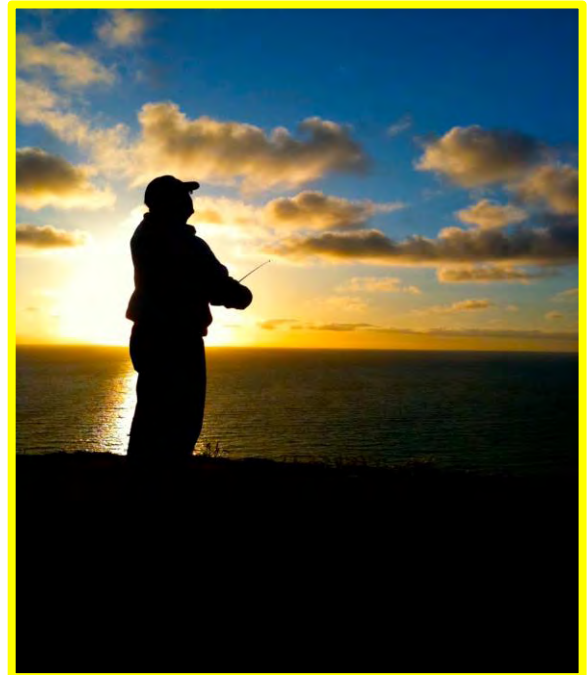
Torrey Pine Glider Port