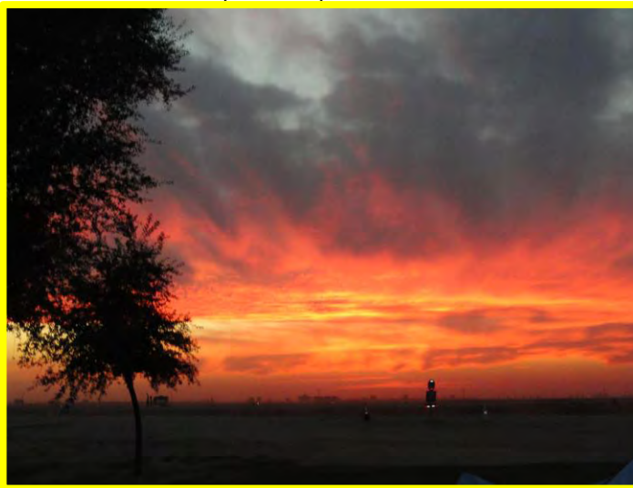
Visalia 2 day contest 2012 Sunset