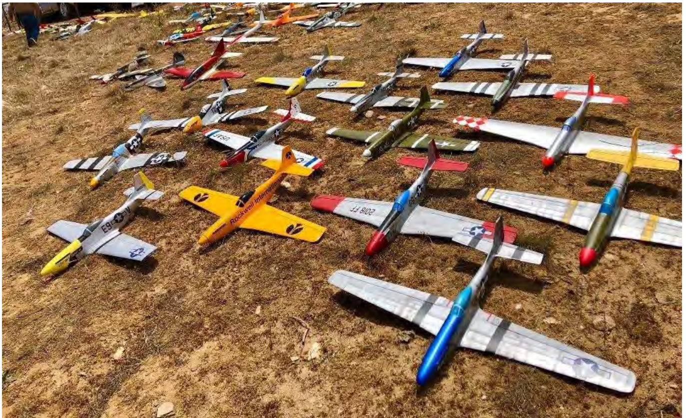
Group build Mustangs at this year's PSS FakeFest at Cajon