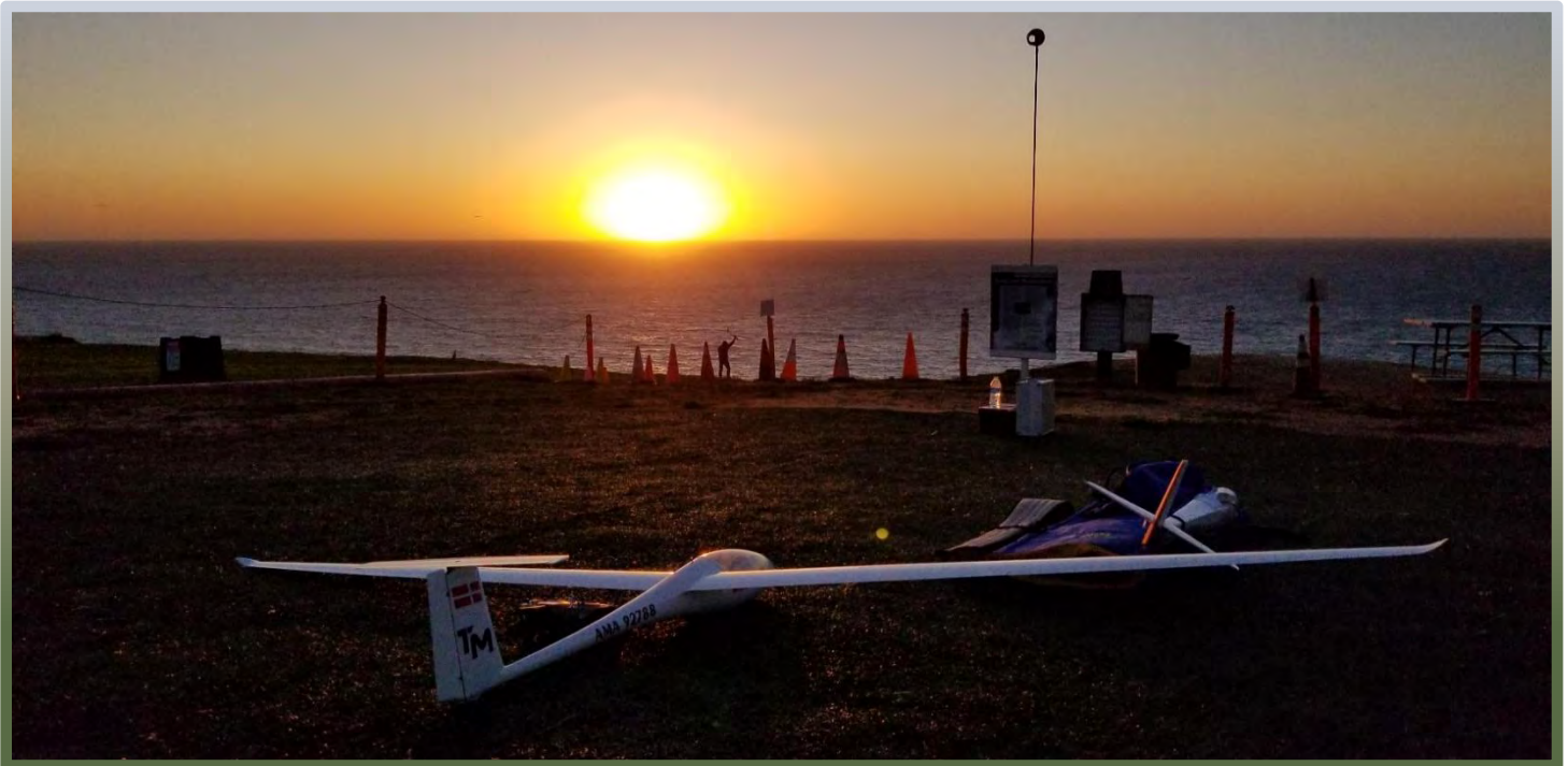
February Co-Winner – 3m ASH-26 at the end of the Fun Fly day