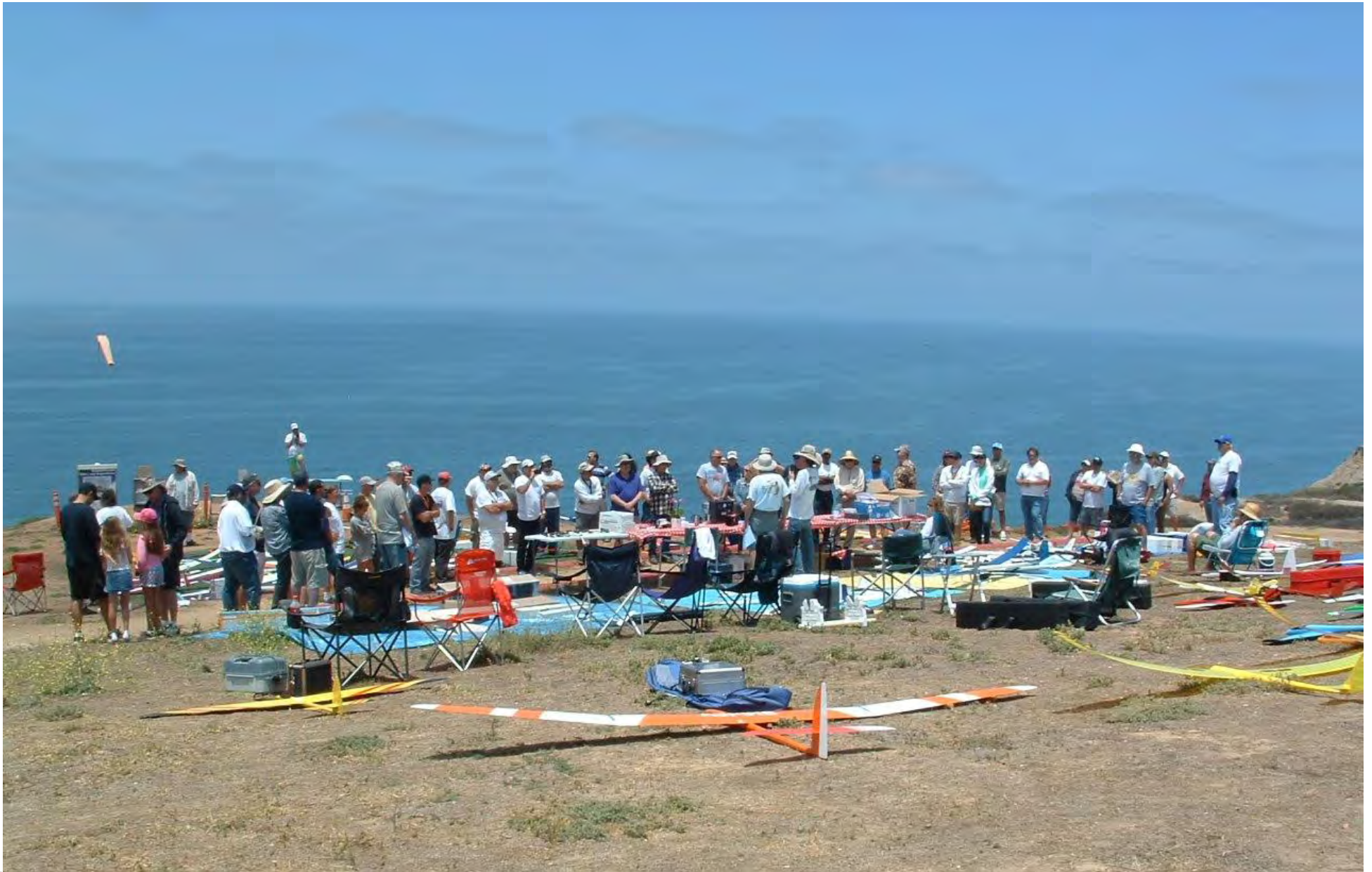
The raffle drawing. This year's raffle raised $1,250.00 for the American Heart Association!