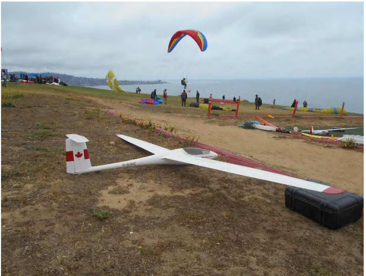
ASH 26 at the May Fun Fly