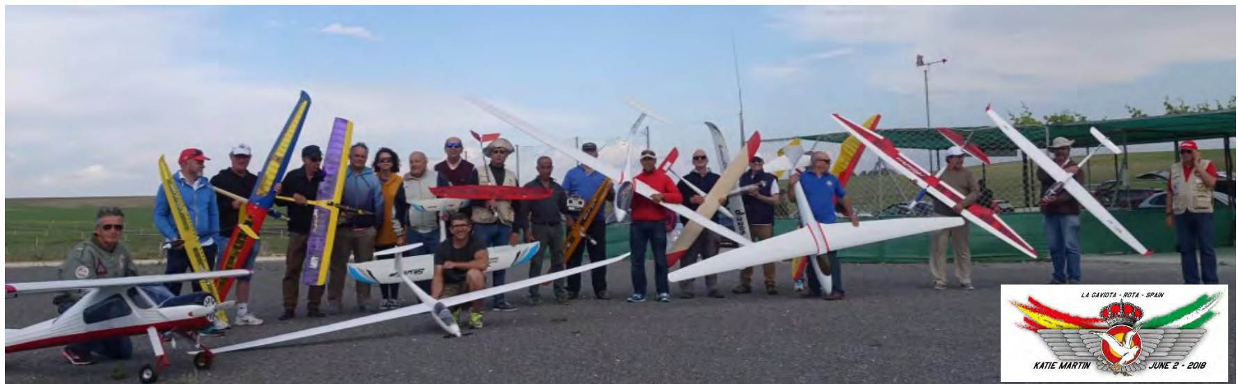
The Spanish contingent gathered for the Tribute!