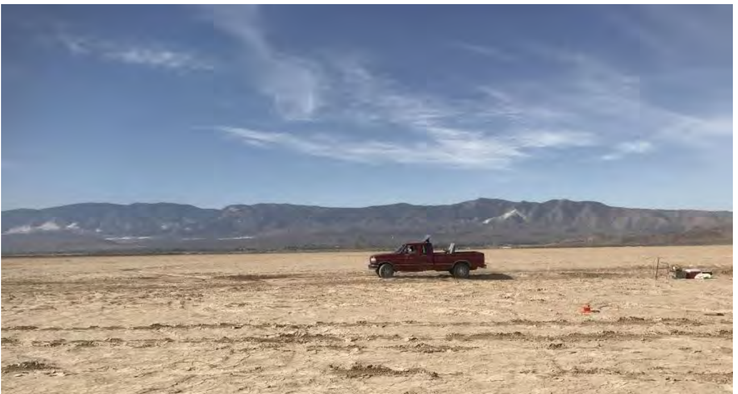
Imagine Chuck riding the back of this truck going down the dirt road for the G&R attempt.

Chuck went later, but also landed short. It looked like the thermals were very far apart.