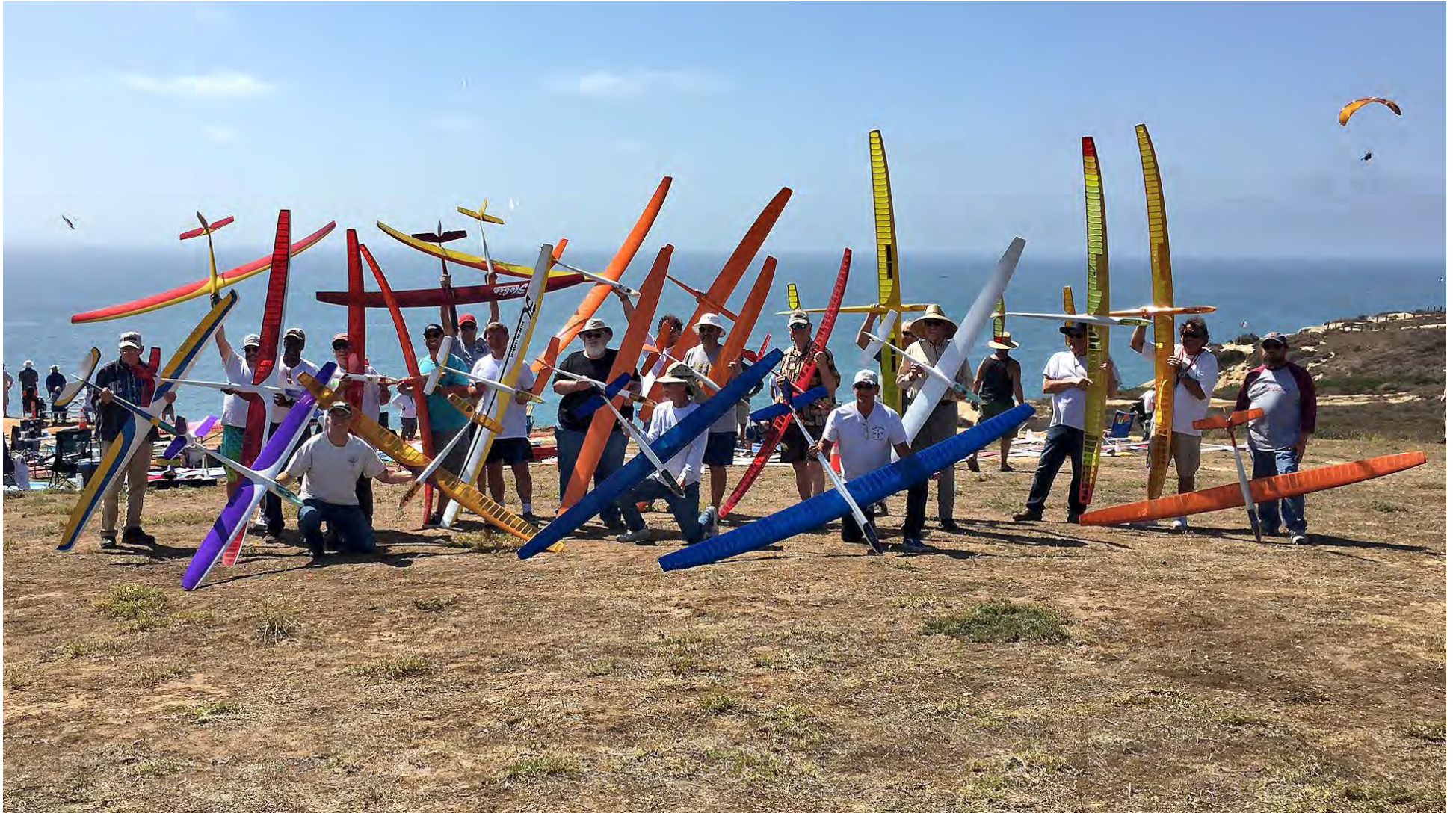
Hobie Hawks and SuperHawks gathered at Torrey. This is only about 60% of the Hawks at the event!