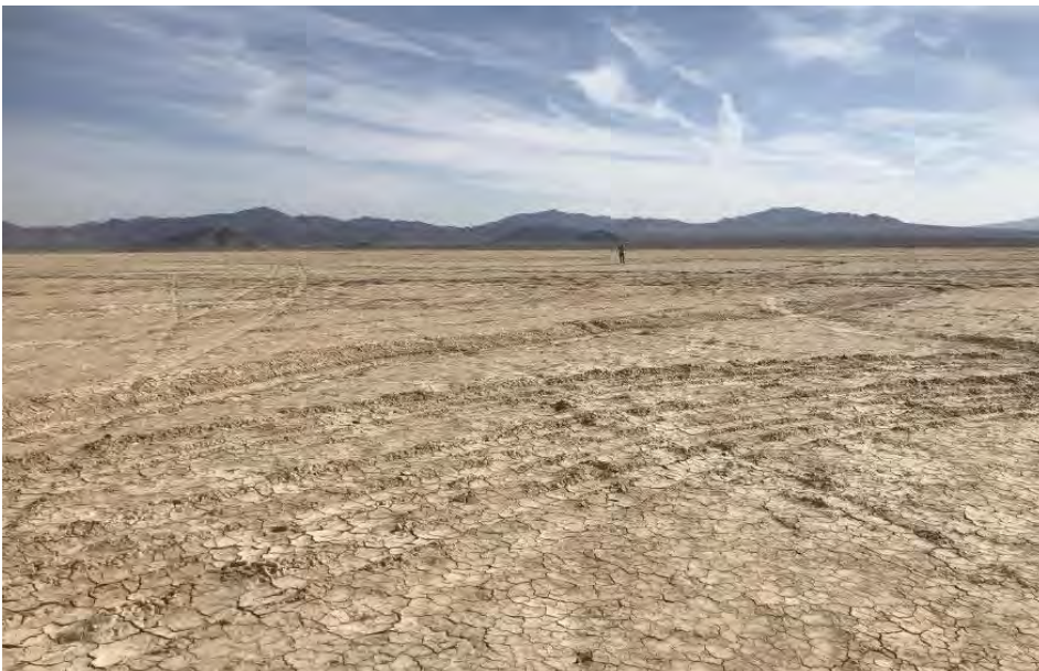
Barren, featureless landscape