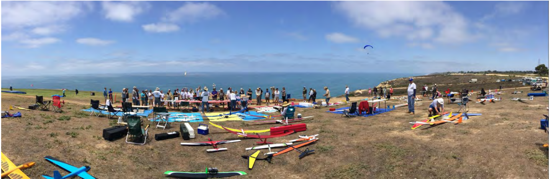
Great Torrey turnout!