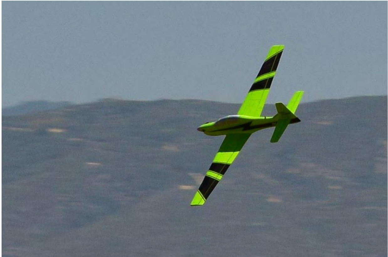
Brian Laird's Tucano at Cajon