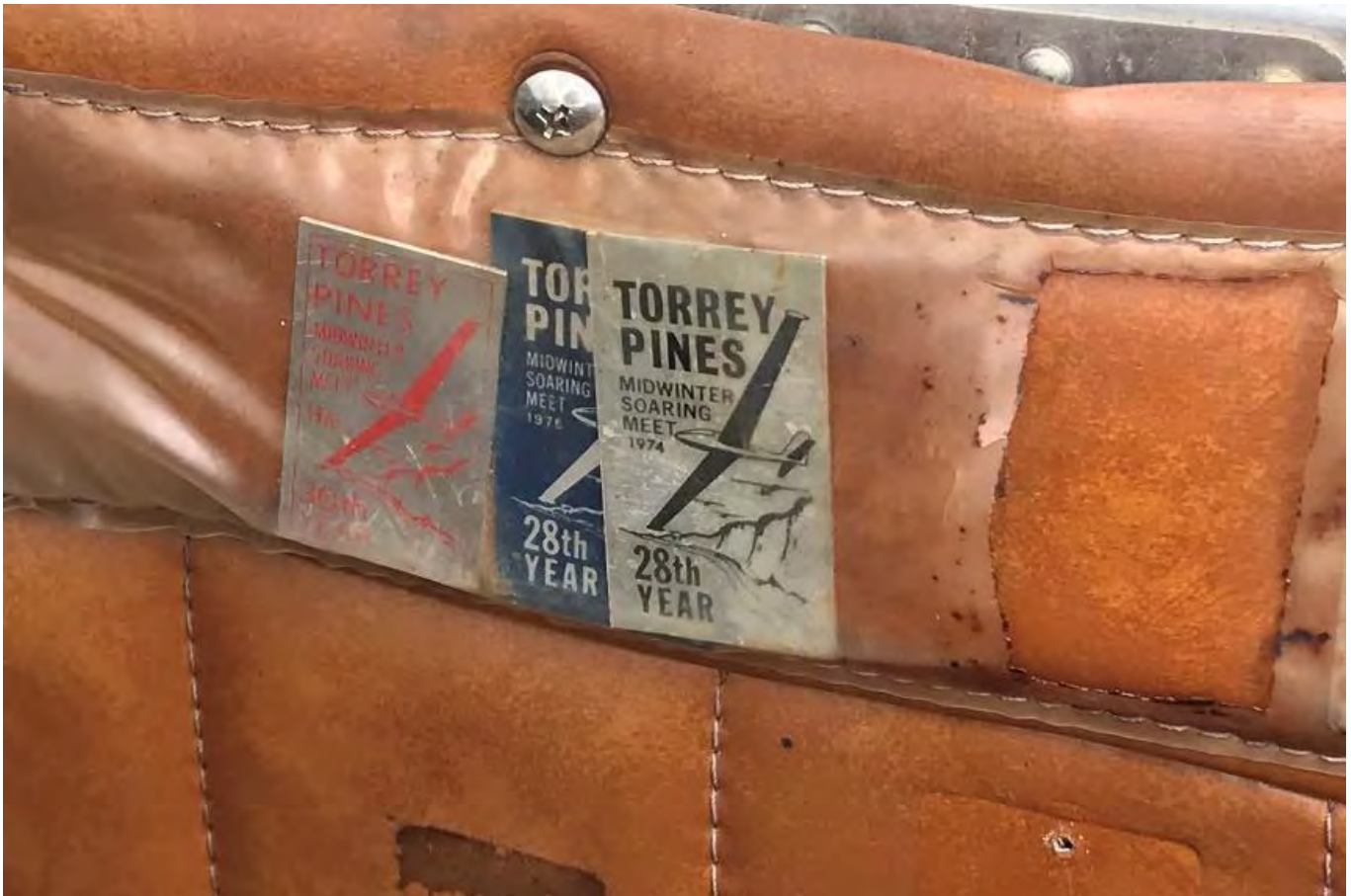
Check out the mementos from the 1974, '75 and '76 Midwinter Soaring Meets!