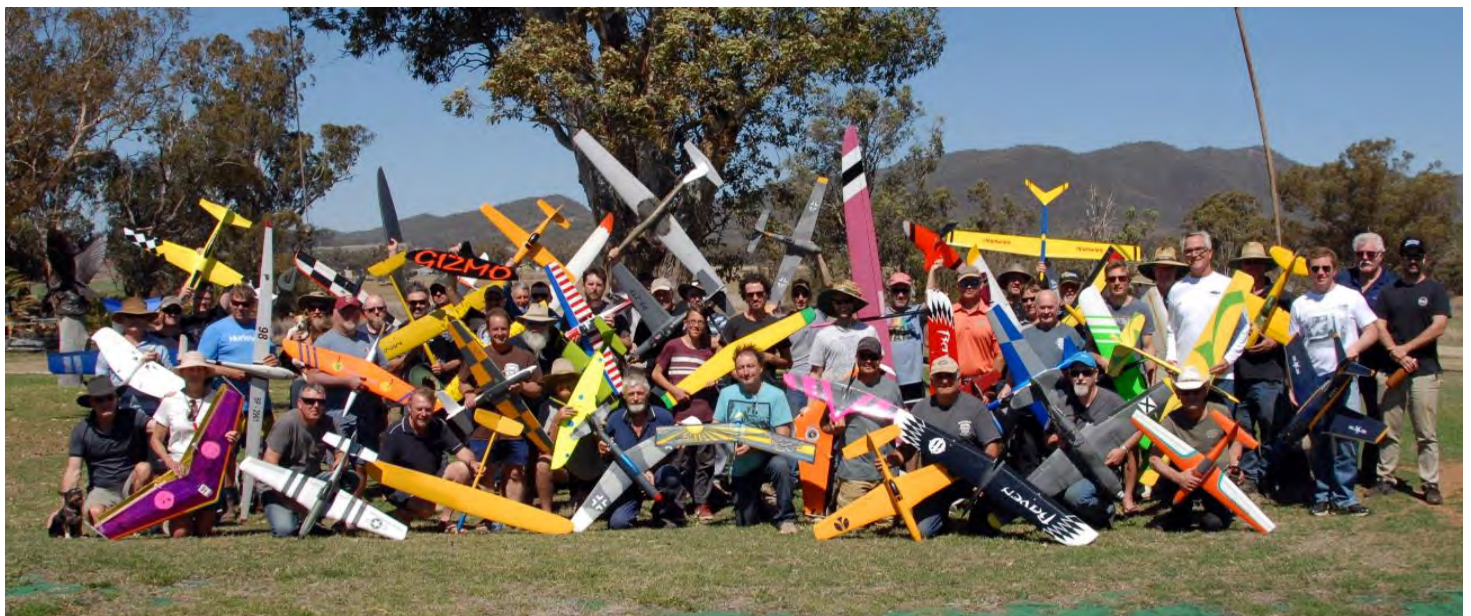
Group photo from Manilla Slope Fest in Australia