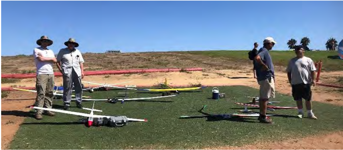
The last Fun Fly for 2018 will be the Saturday after Thanksgiving, November 30.