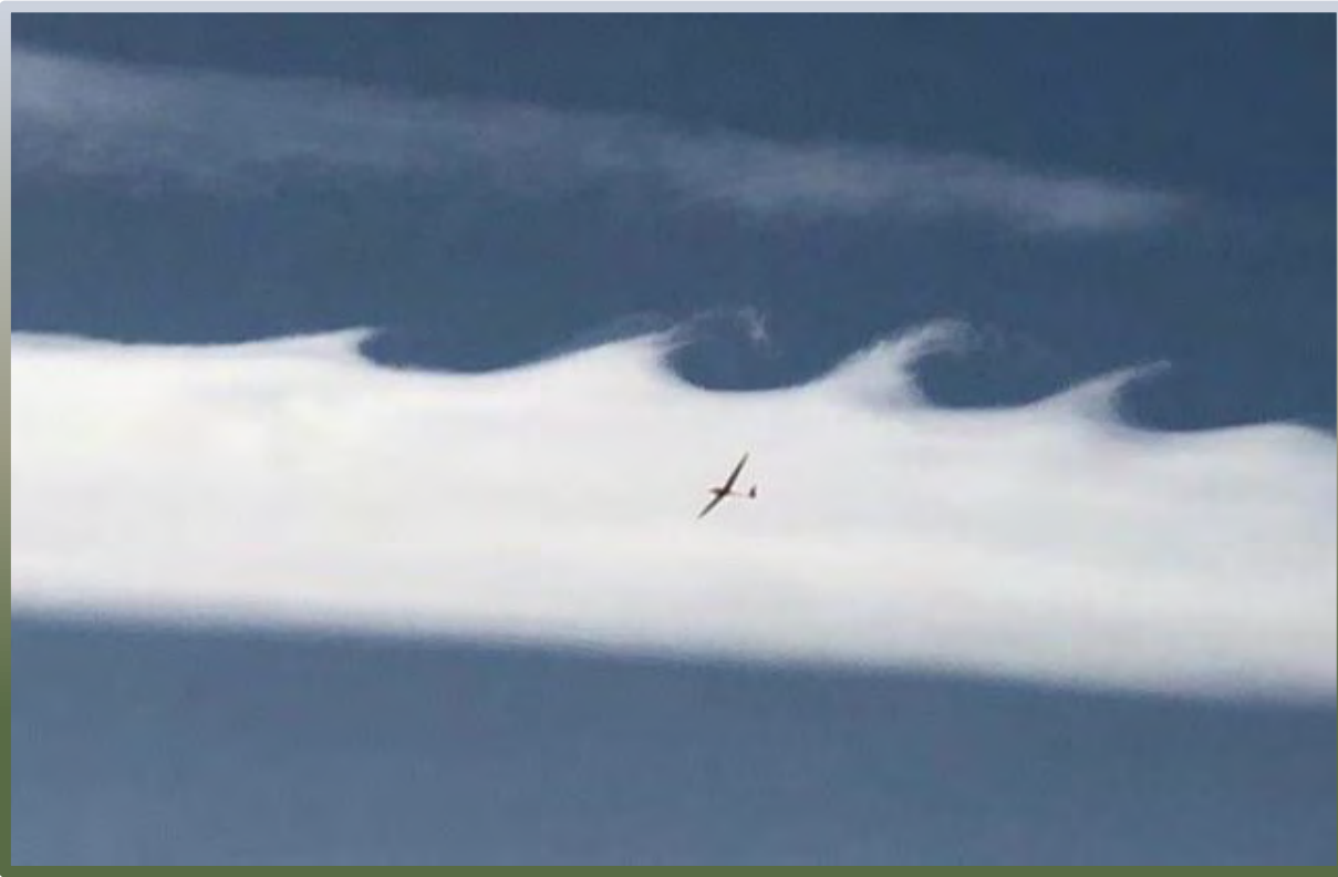
May Co Winner – Steffen Peters' 6m LET DG-1000 taking advantage of great Torrey lift with an unusual saw tooth-shaped cloud formation setting the stage.