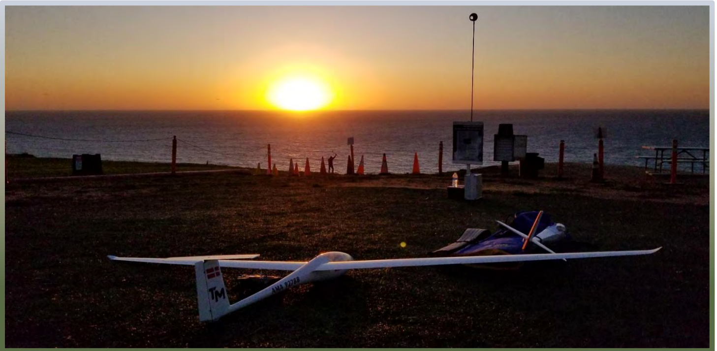
February Co-Winner – 3m ASH-26 at the end of the Fun Fly day