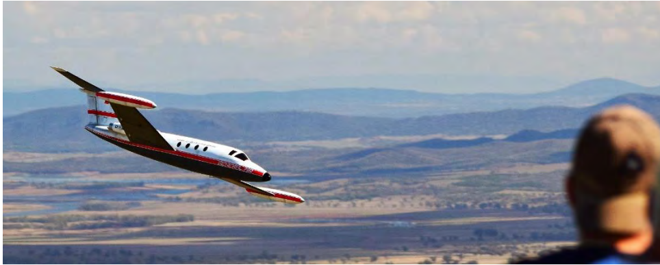
Flyby at Manilla Slope Fest