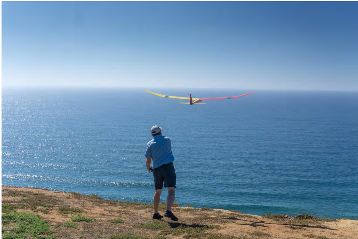
Chuck Norris launching his Skybench Oly IIS for his LSF 2-hour slope flight