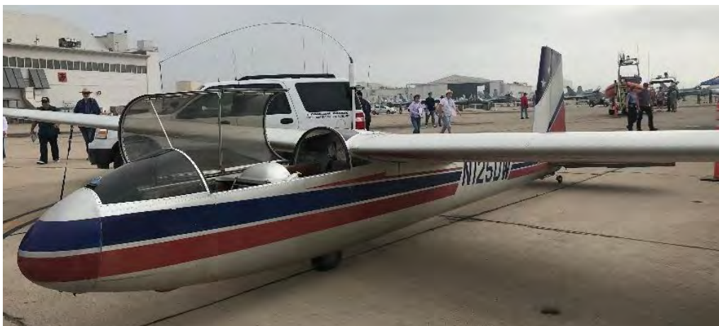
...and inside the cockpit, I saw.....