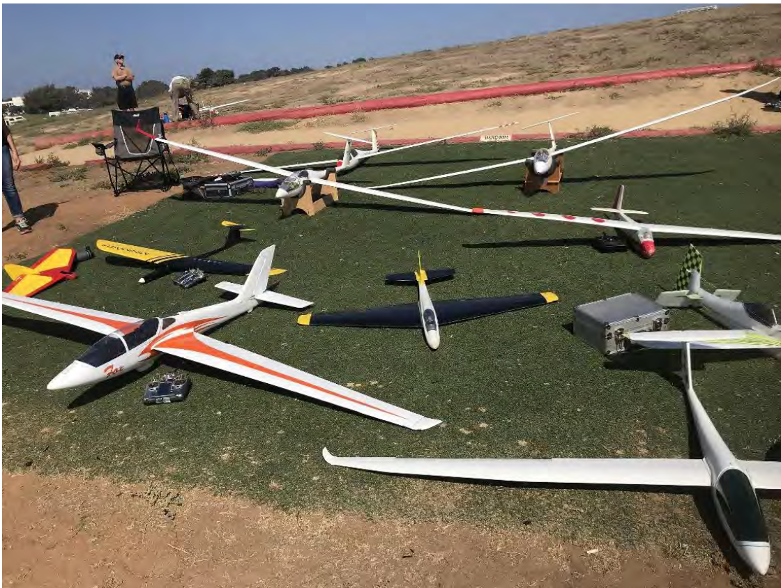
August 25 th Fun Fly