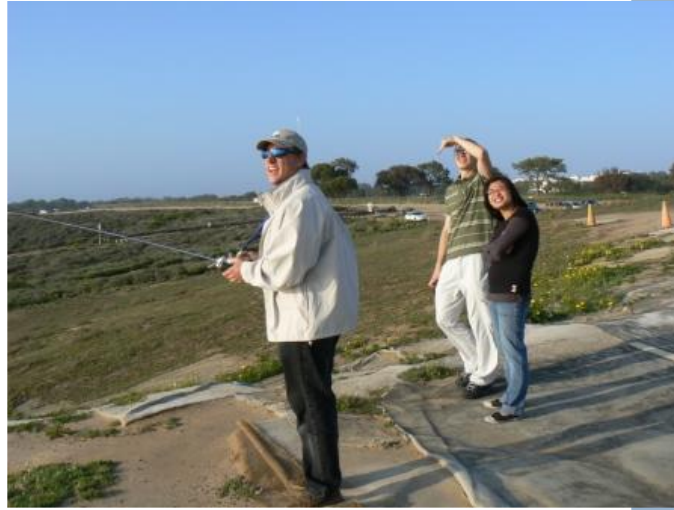
Above: A good day with good guys makes for a good time.