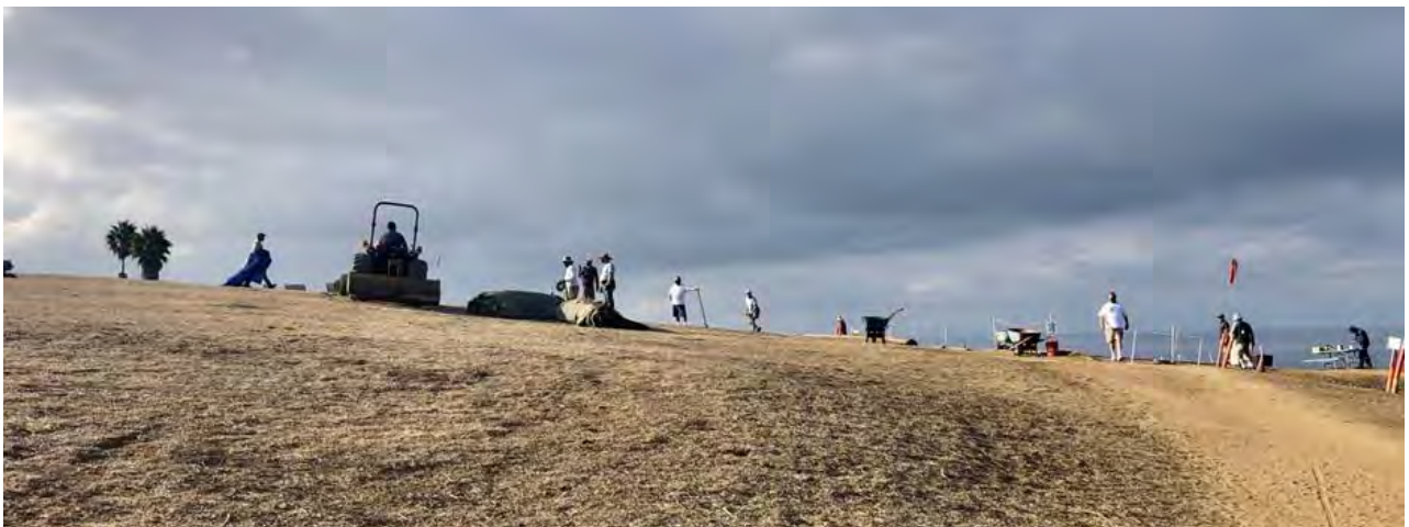
A cool day to work with a view2 – lots of fresh air

Here are some pics of the last install day, October 10 th .