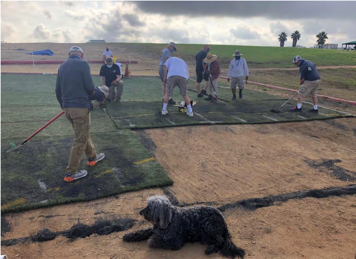
Many hands make light work.