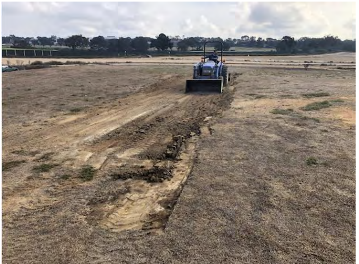
Leveling the landing strip. No more snake or gopher holes!