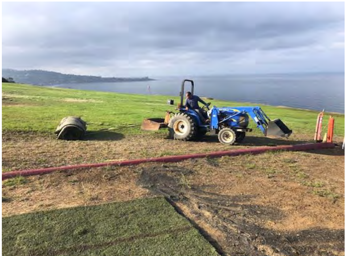
So much easier doing it this way