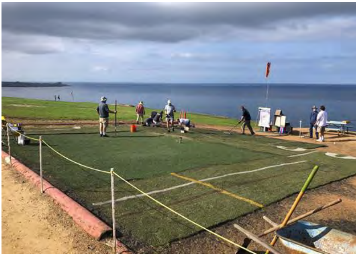
After - much more room!