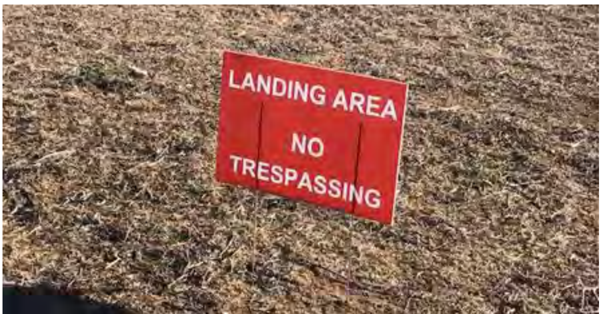
One of about a dozen signs. These are about 18" wide x 12" high. MUCH needed; thanks Jerry!