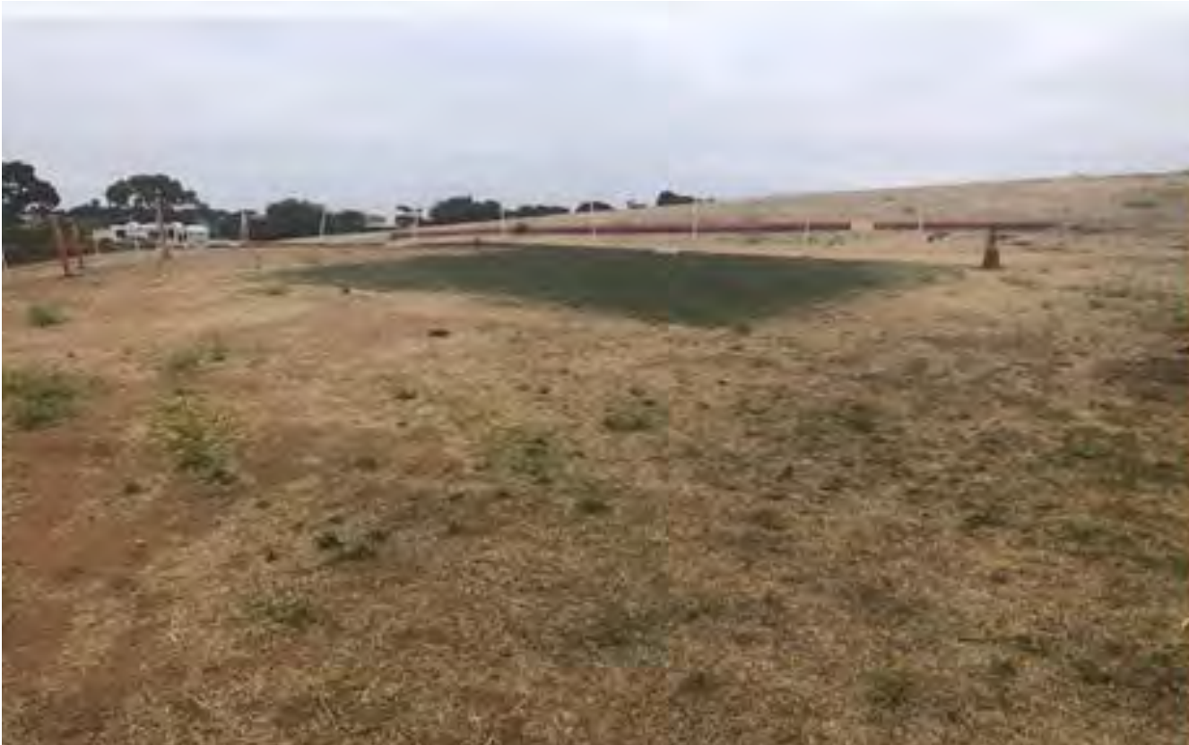
Pit area before. A couple of large scale planes here took up the whole area.