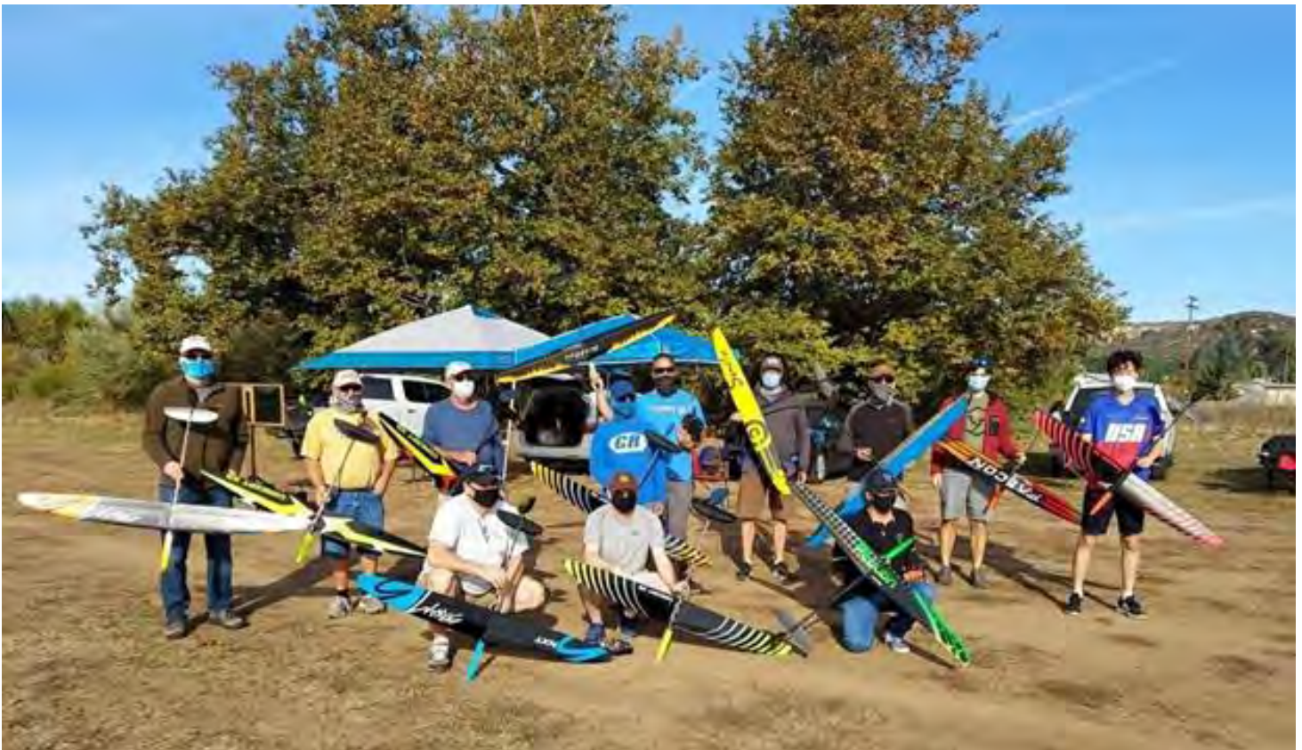
The 12 DLG competitors on November 21, 2020 at the Poway Flight Center. Yes, they really are all smiling....