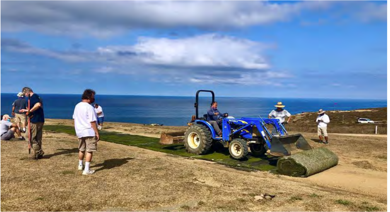
Unrolling with the infill still in the AstroTurf. Four more rolls are going here to double the width.