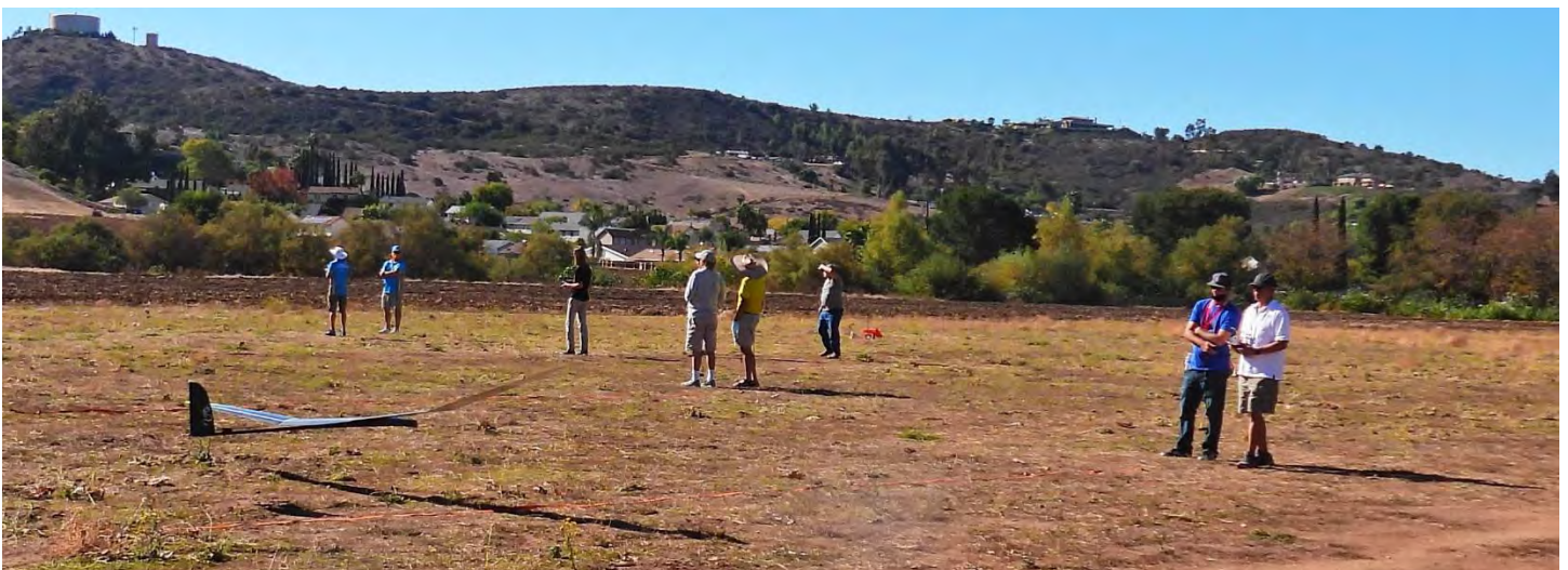
Contest landing