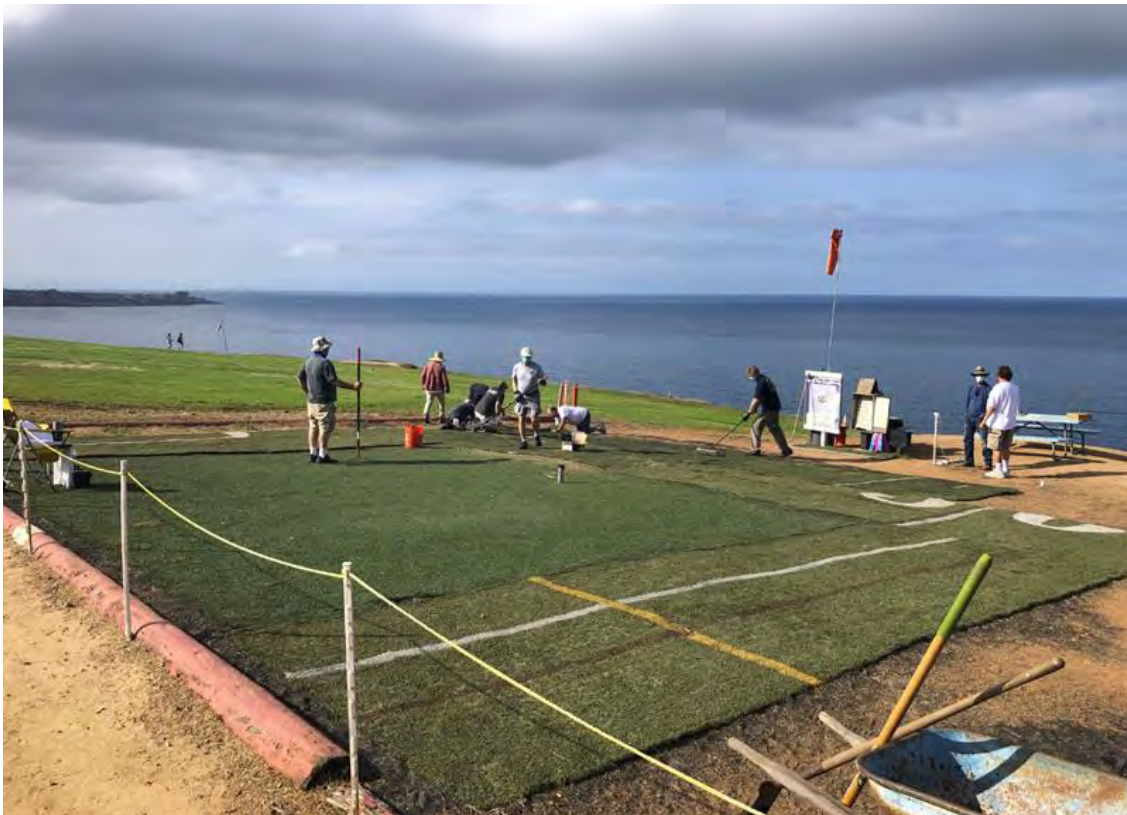
Our new mini football field. Now, we can have many more planes and more equipment without being in the dirt.