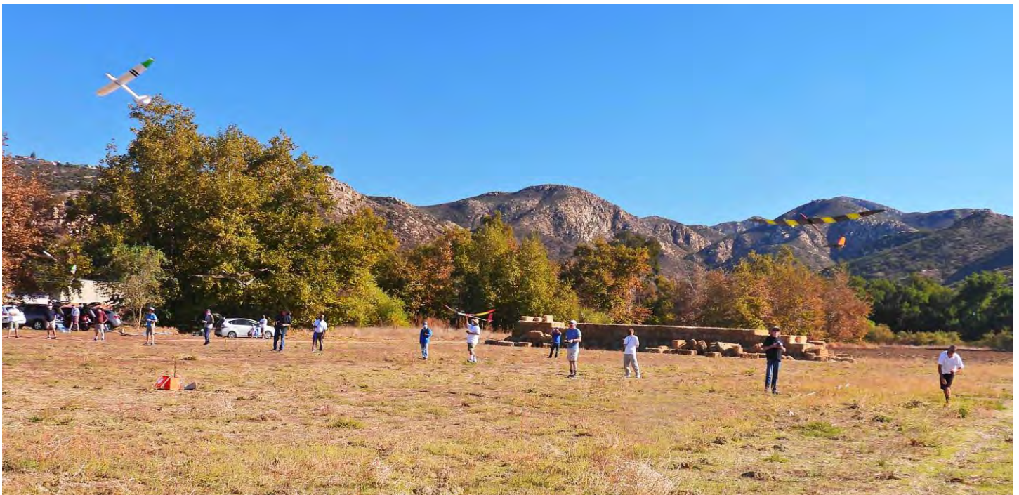
Contest launch