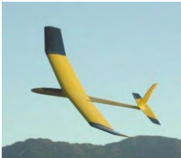
CR Aircraft Climmax