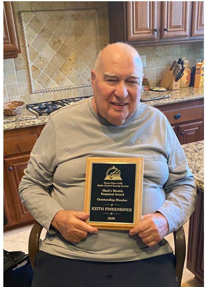
Modeler of the Year awardees now receive a special award plaque to keep after the trophy