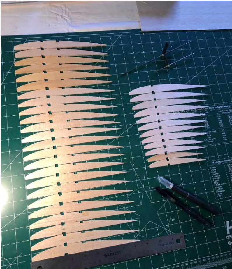
Ribs cut individually with an X-Acto