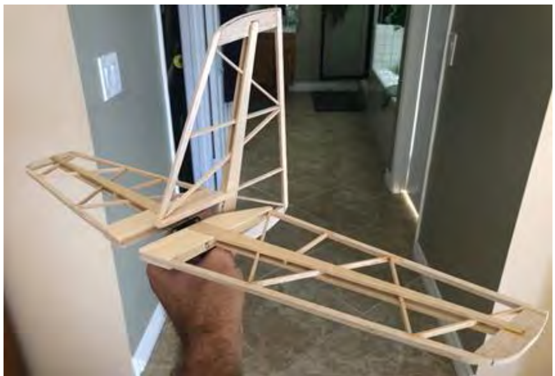
The tail feathers were pretty straightforward.