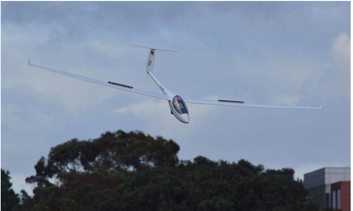
Scale ASW-27 with spoilers deployed about to land at Torrey