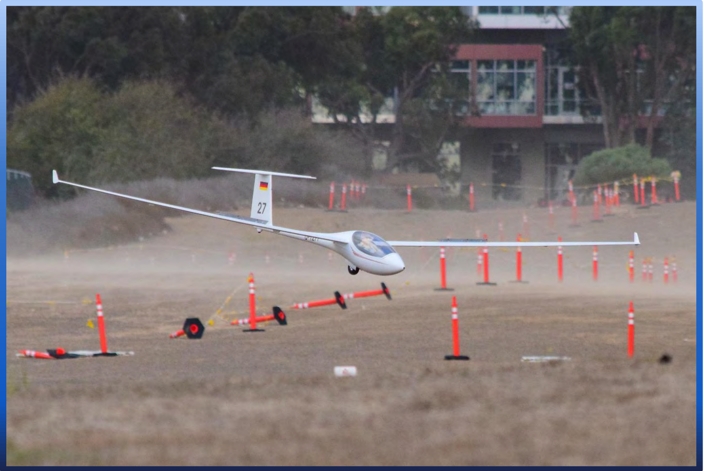
January Co-Winner – Scale ASW-27 coming in to land on a windy Torrey day