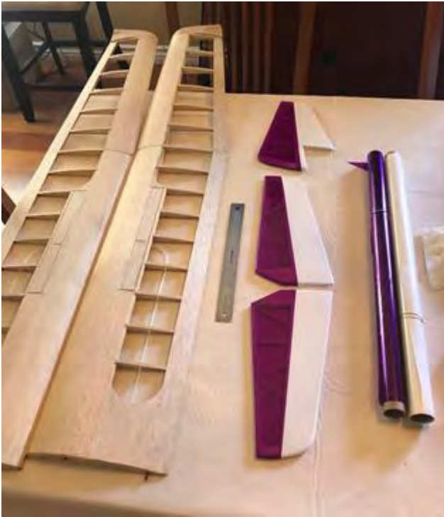
Covering time!