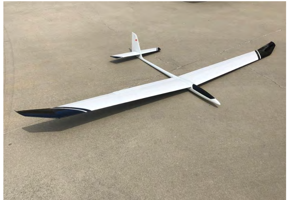
Airtronics Falcon 880