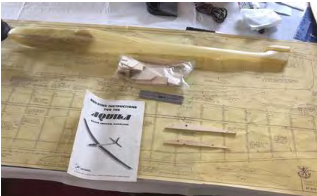
Here's what I started with. The newspaper that's in the fuse was dated from 1978.

As promised, here's the Aquila that was saved from the landfill. You've seen some of the pics earlier this year, but I'll show some of them again. This is the first wing that I've scratch built from plans, and can honestly say it was a blast!