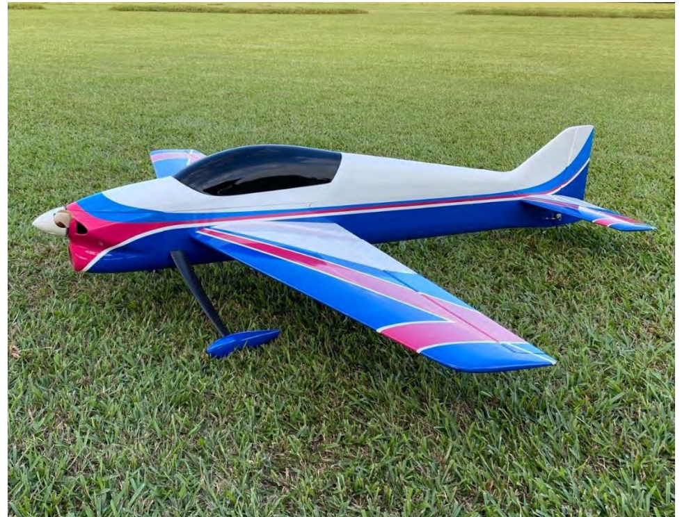
Another one of Ron's pattern aircraft, this one is a Vanquish, a kit offered by Extreme Flight Models.