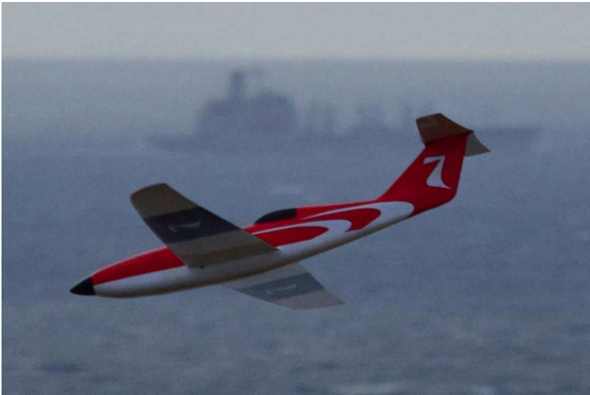
Zephyr at Torrey with a ghostly ship as a backdrop