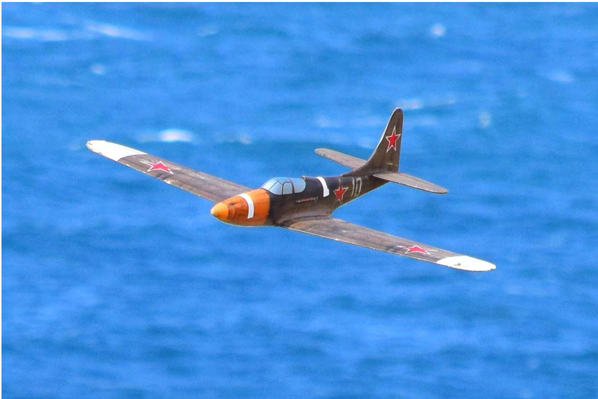
Airacobra at Torrey