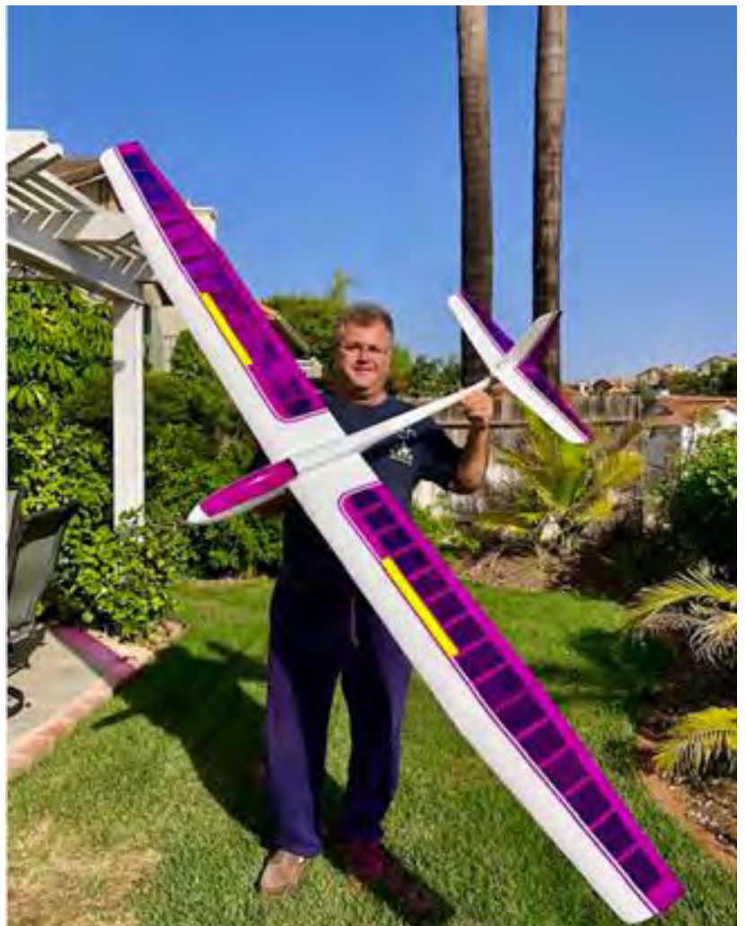
Ready to maiden