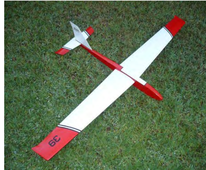
CR Aircraft Turbo