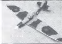
A bit of slope memorabilia – back when you could buy a complete PSS kit for $99.95 (mid-1980s ad)