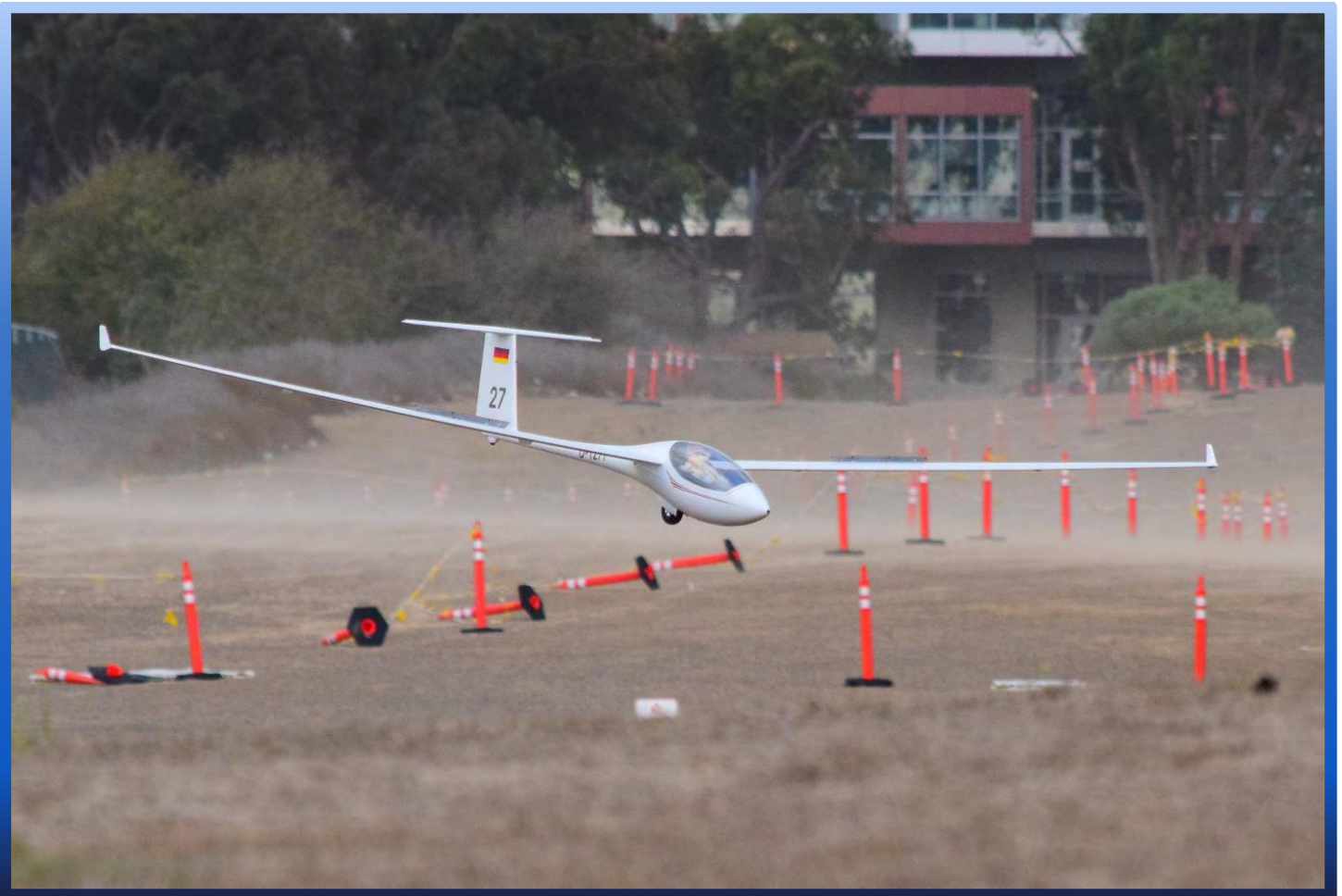
January Co-Winner – Scale ASW-27 coming in to land on a windy Torrey day

A yearly winner will be selected from among the monthly winners and will receive a prize (their photo will be used as the website and newsletter masthead AND will appear on the following year's club membership card). Needless to say, horizontal format photos are preferred. Email your photos (.JPG format preferred) to Dale Gottdank at submit@torreypinesgulls.org . Please provide your name, location of photo and photo description.