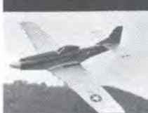
A bit of slope memorabilia – back when you could buy a complete PSS kit for $99.95 (mid-1980s ad)