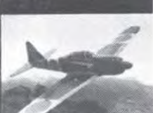
A bit of slope memorabilia – back when you could buy a complete PSS kit for $99.95 (mid-1980s ad)