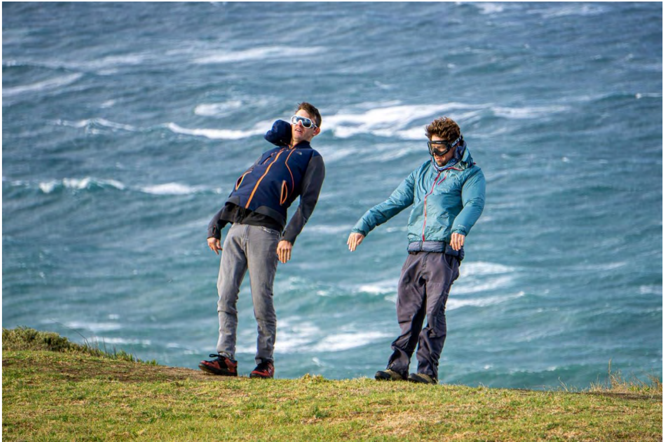
Revisiting that epic wind day at Torrey in Jquary