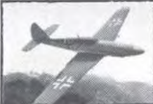
A bit of slope memorabilia – back when you could buy a complete PSS kit for $99.95 (mid-1980s ad)