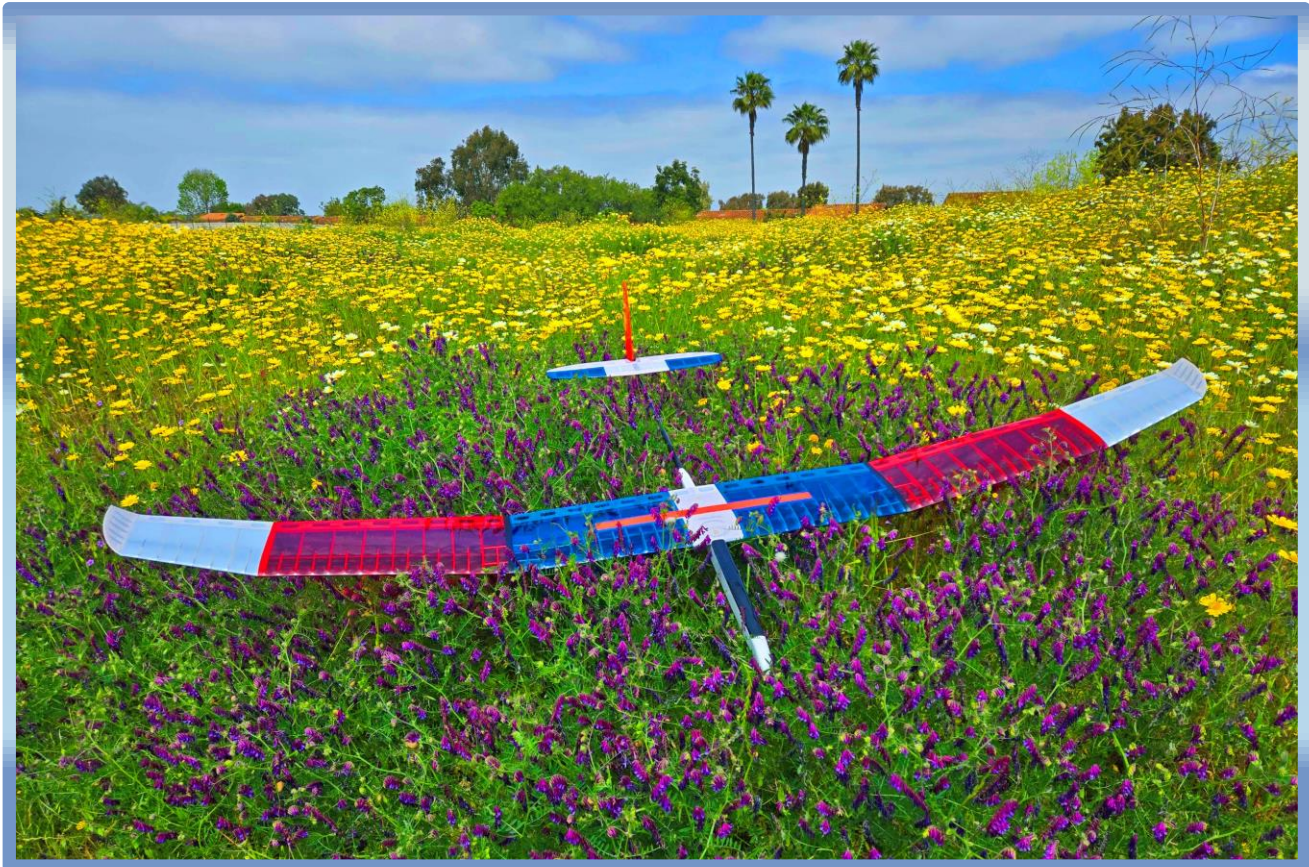
May Co-Winner – Gary Fogel's Yellow Jacket amid the Encinitas field wildflowers