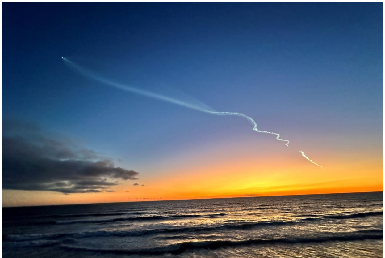
Another SpaceX launch, another great photo!