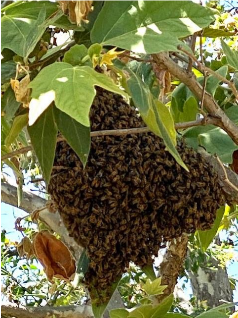
One of several bee hives that have enjoyed the Poway trees.