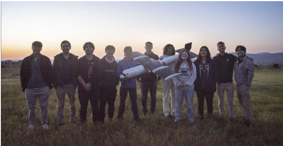
Test Flight Team