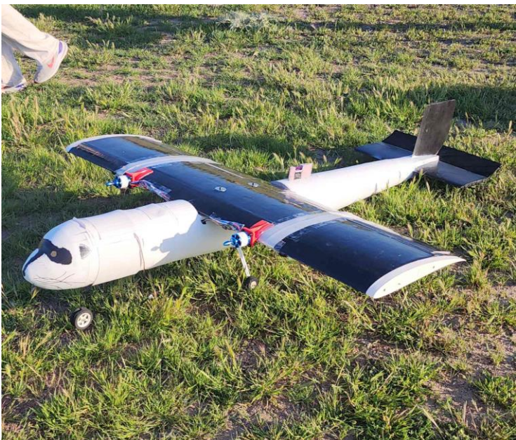
DBF Competition plane