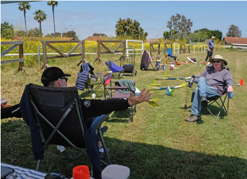
Break time