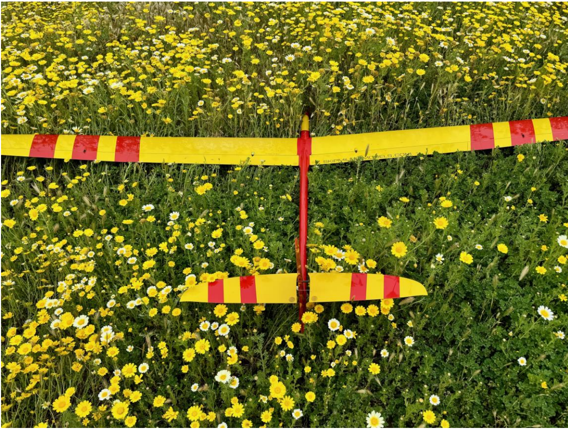
Ian Cummings' Orca on a soft cliffside landing spot at Torrey