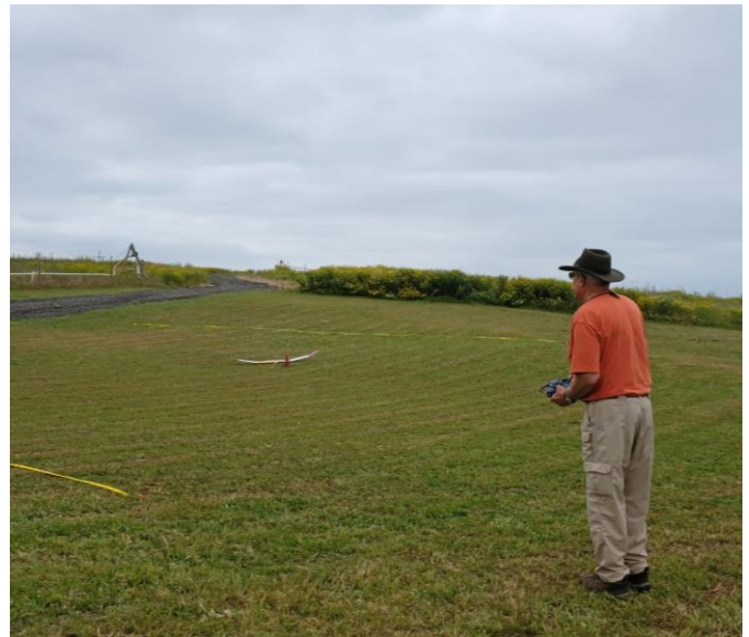
...and more flying

Meanwhile, Gary, Miro, and I continued to hunt lift, run downwind, and then press home. Six-minute flights were available, except for one notable cycle where all three of us struggled for two minutes. I managed to surf behind the landing tapes for 30 seconds longer than Gary, which proved pivotal.