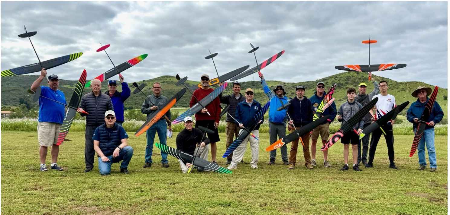
Group shot (Bob Hirsch photo))