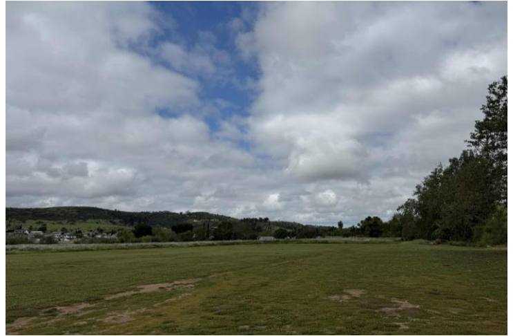
Poway field mowed and ready for the 29 th IHLGF