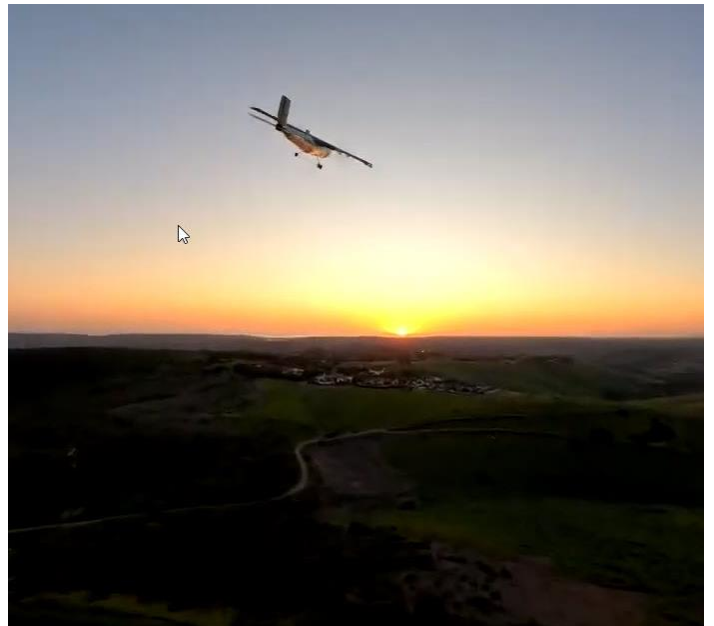
Screenshot of the test flight