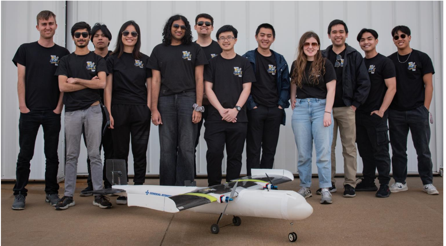
The AIAA Design/Build/Fly at USCD project team