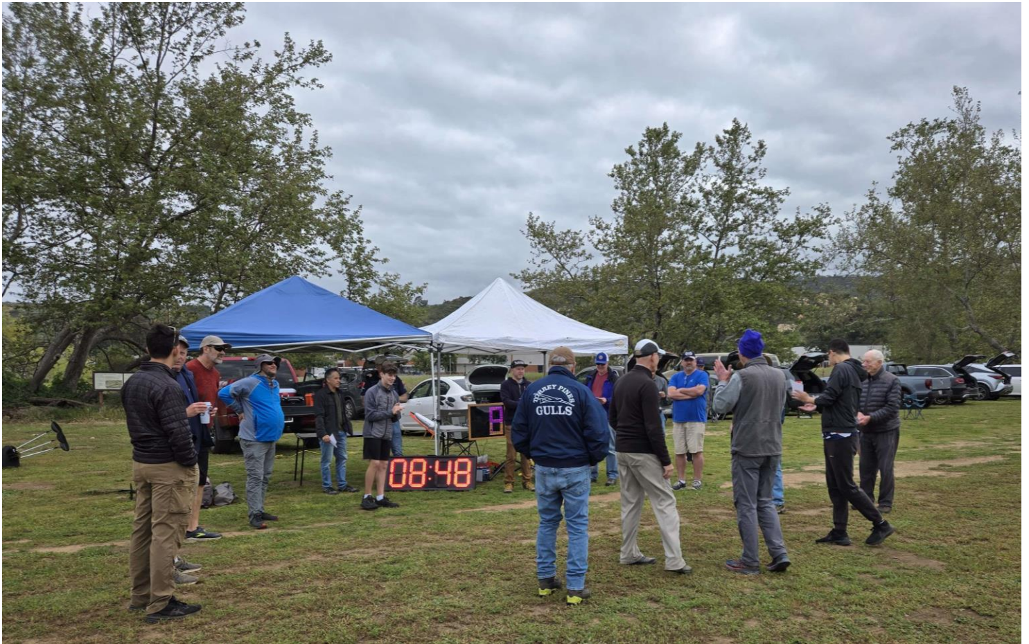
Pilots meeting

The April DLG contest/clinic was held on Saturday April 13 th with 16 pilots in attendance. As we've done most of the year, we split into two flight groups in order to accommodate eight rounds of flying. More rounds means more stick time! And more stick time in preparation for IHLGF was the goal. Charles Martin was CD and he picked some heavy-hitting tasks that kept us working hard all day. We were once again greeted with overcast skies most of the day with winds out of the south. The NWS called for strong gusts upwards of 20mph in the afternoon but thankfully wind of that strength never materialized.