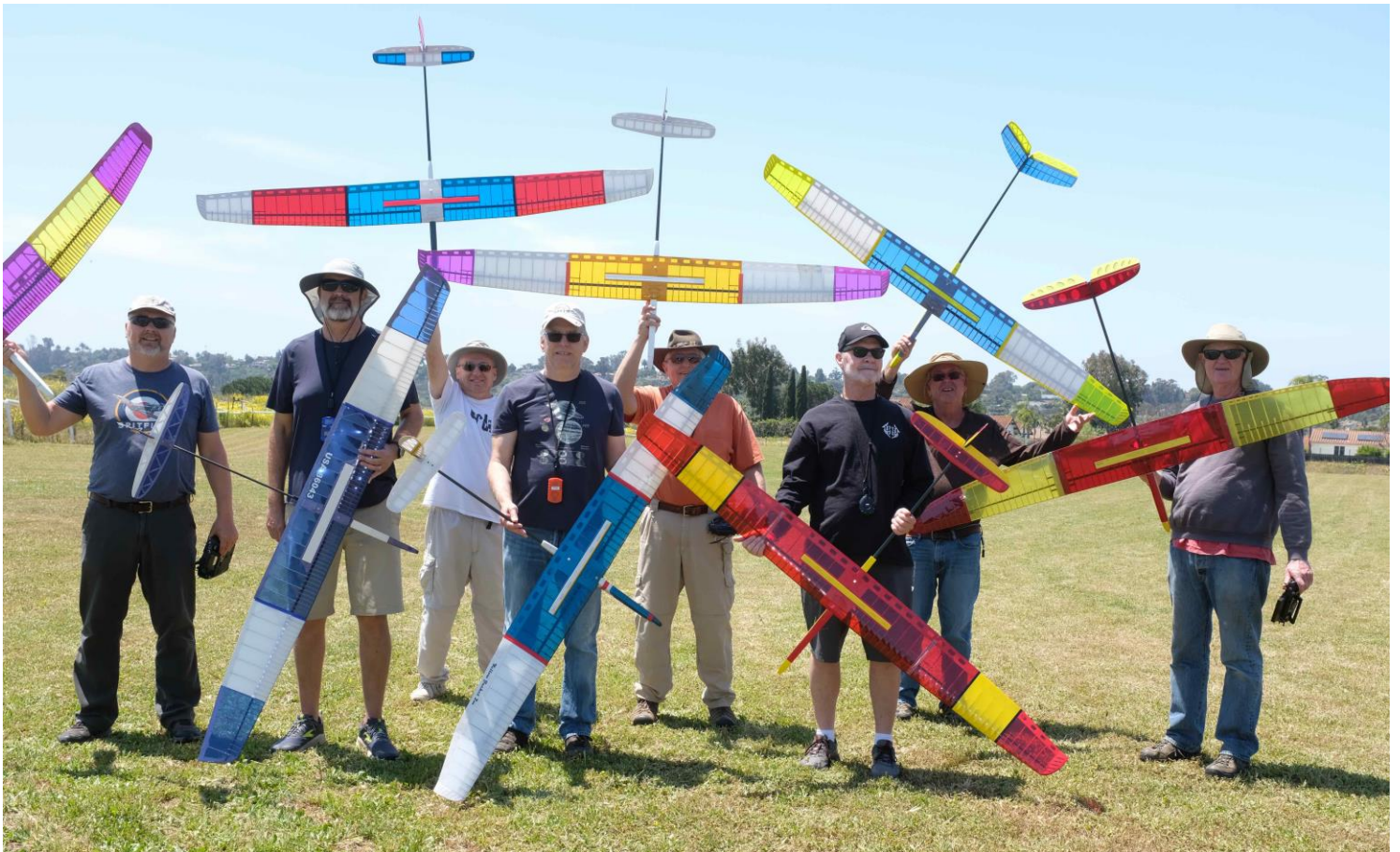
Tow Hook pilots