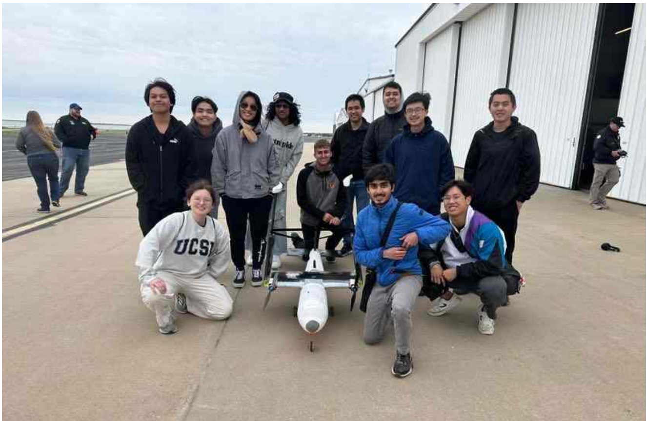
At the competition